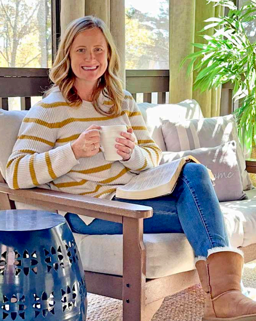
I LOVE READING GOD'S WORD WITH A CUP OF COFFEE