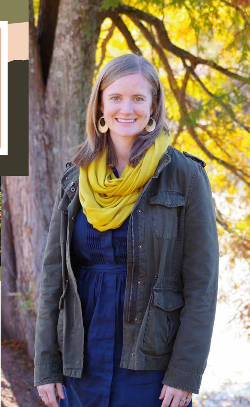
I LOVE SEEING MY NEURO PATIENTS IMPROVE

As a nurse, she sees it as a privilege to love others and take care of them in their most vulnerable state. She keeps very flexible hours as a part time radiology nurse only working a few days a month so she can be home with family.