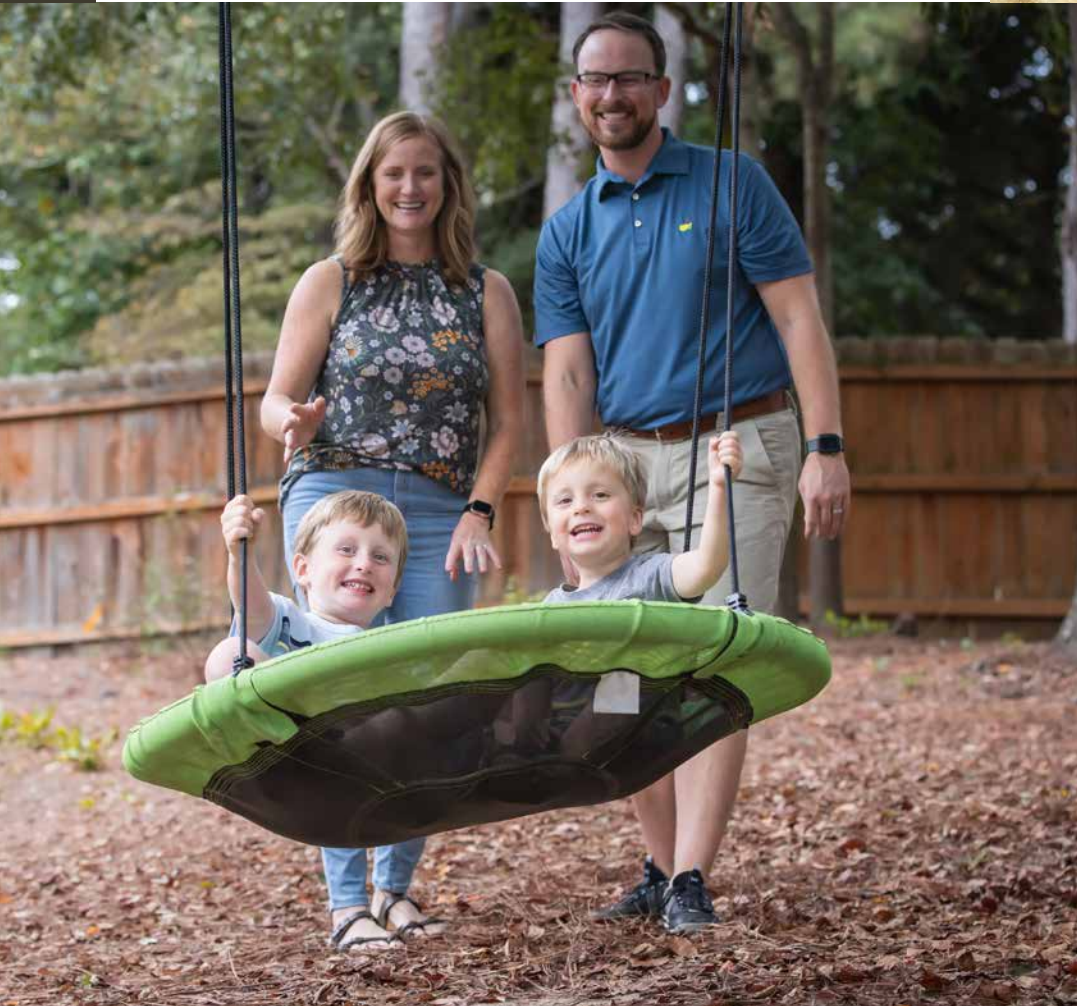
WE LOVE HOSTING PARTIES AT HOME