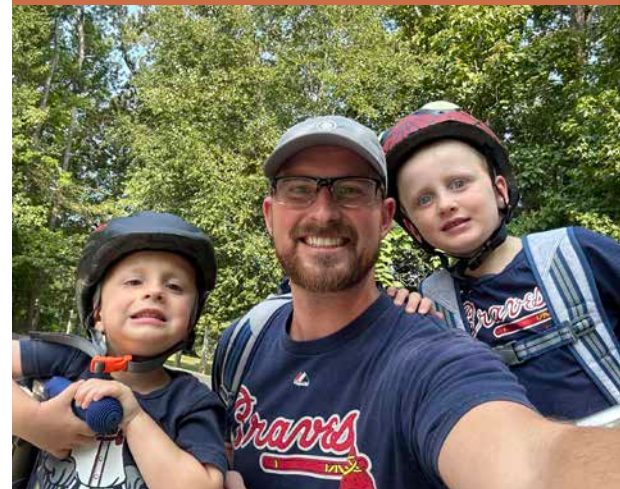
SPENDING TIME FISHING