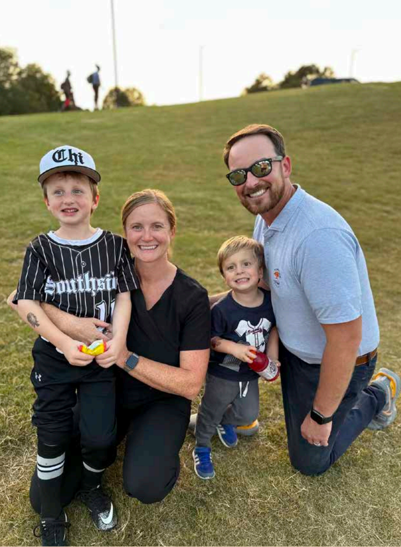
SUPPORTING OUR LITTLE LEAGUE BASEBALL PLAYER