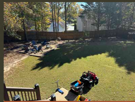
OUR BACKYARD HAS SO MUCH ROOM