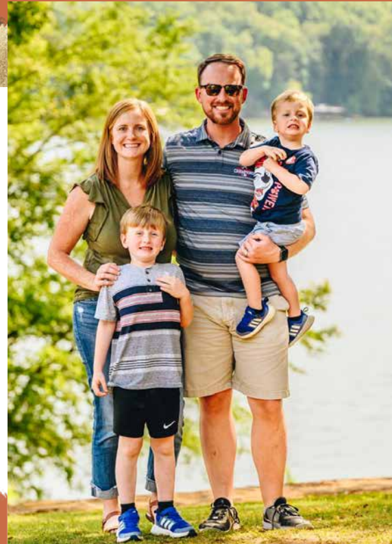
ALL SMILES AT FAMILY CAMP

We host and co-lead a small group of people weekly from our church called a missional community group. We have 7 families who have been in each other's lives for 6 years now. We study the scriptures, pray together, serve one another, and live on mission together. These families have kids the same age as ours and we love them like family!