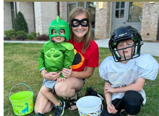
I LOVE VOLUNTEERING IN THE COMMUNITY