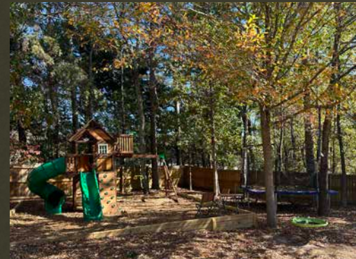
WE HAVE MANY PLAYDATES HERE