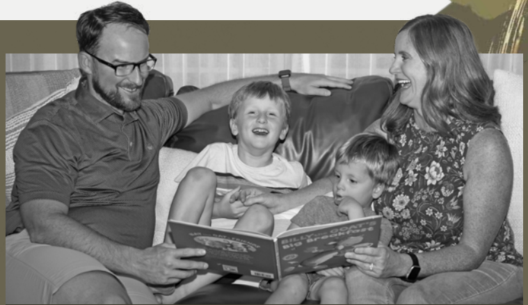
WE OFTEN BURST OUT LAUGHING WHEN WE READ BOOKS

BE KIND /// LOVE UNCONDITIONALLY AND ALWAYS FORGIVE /// CELEBRATE THE WINS AND LEARN FROM THE LOSSES /// SHOW GRATITUDE BY COUNTING YOUR BLESSINGS /// LAUGH AND DANCE OFTEN!