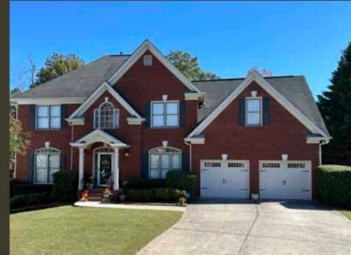
THE PLACE WE CALL HOME