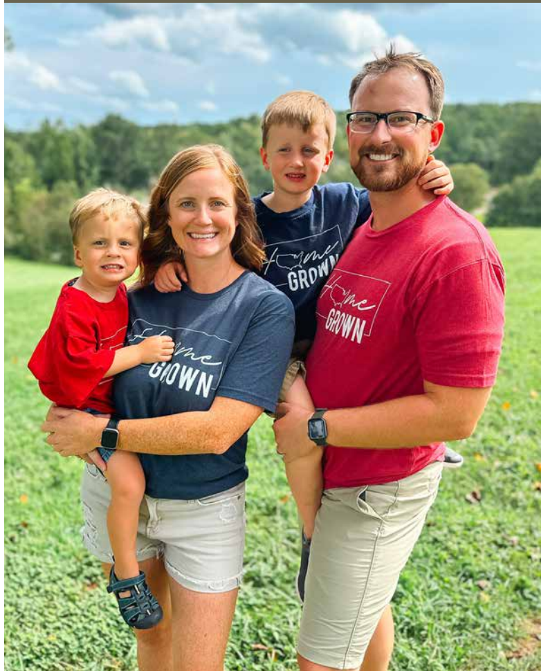
OUR FAMILY (SO FAR!) IN MATCHING T-SHIRTS

Adoption has been in our conversations since we were dating and we've always known it was part of God's plan for our family. After our 2nd was born traumatically through a placental abruption and a 3 week NICU visit, our doctor cautioned us in pursuing another pregnancy. After processing through this news, we felt God tugging at our hearts to begin the journey to grow our family through adoption. We very much want another child and feel peaceful and confident that God is leading us to pursue adoption. We are passionate about teaching the next generation to "love God and love others" and we believe adoption is a beautiful way to do that. We are eager to meet you, get to know you and hopefully get to love you as well.