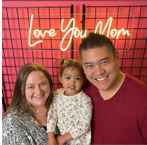
Mother's Day 2023