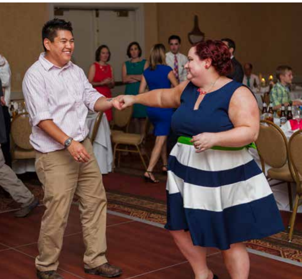
Dancing together at Bridget's best friend's wedding