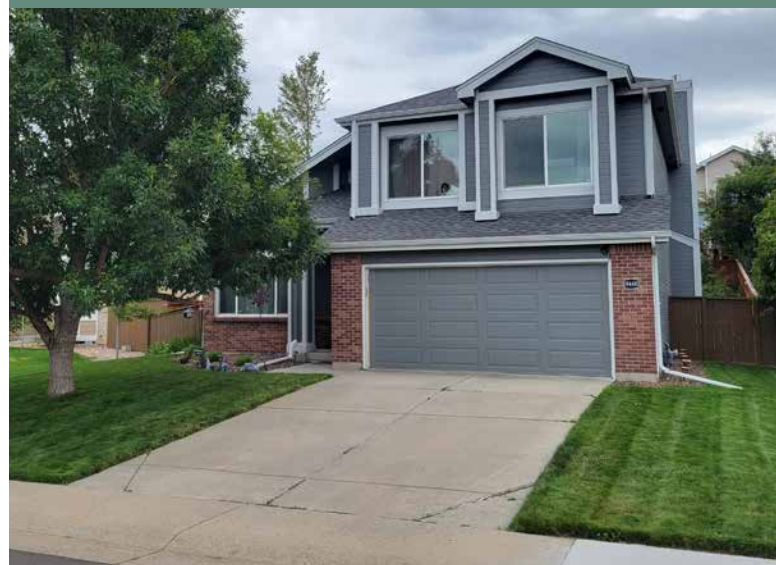
The front of our home