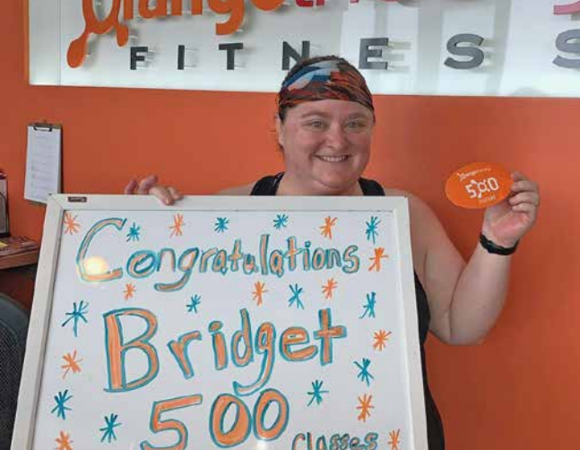
Celebrating 500 classes at OrangeTheory