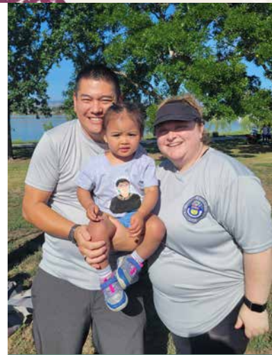
Family fundraiser walk