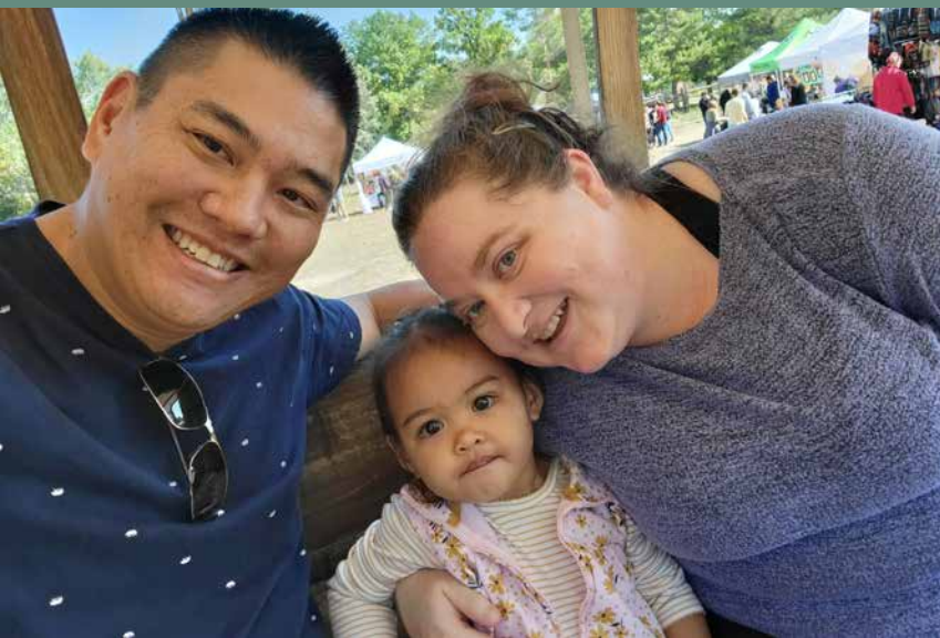
Family fun at a Fall festival

► We want to build a life for our children that is grounded in a strong education and life experiences. We are also dedicated to having our children grow up with strong Christian values. This means attending church on a weekly basis and fostering a relationship with God. Our hope for our children is that they have a purposeful and meaningful life.