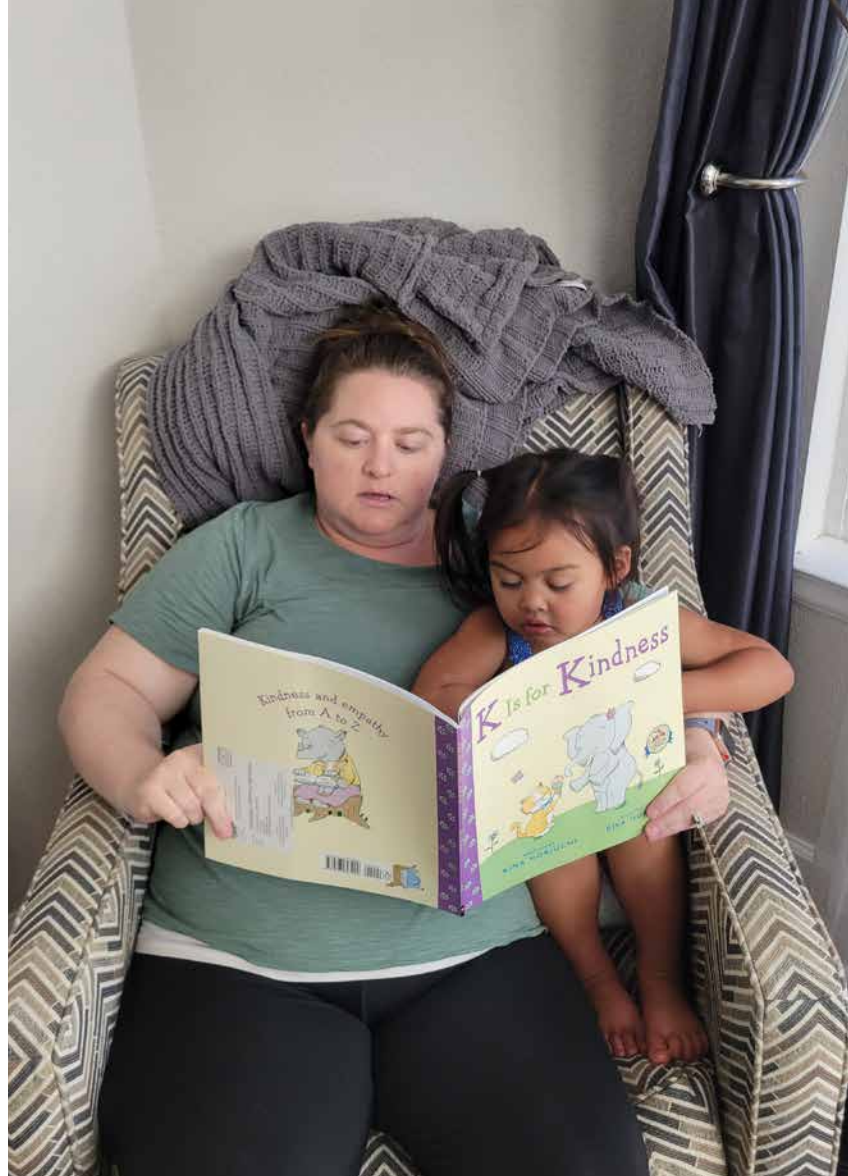
We love story time!