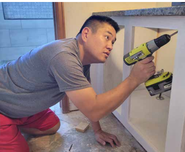
Remodeling the bathroom