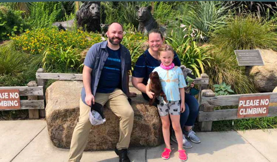
AUNTIECAMP ZOO DAY