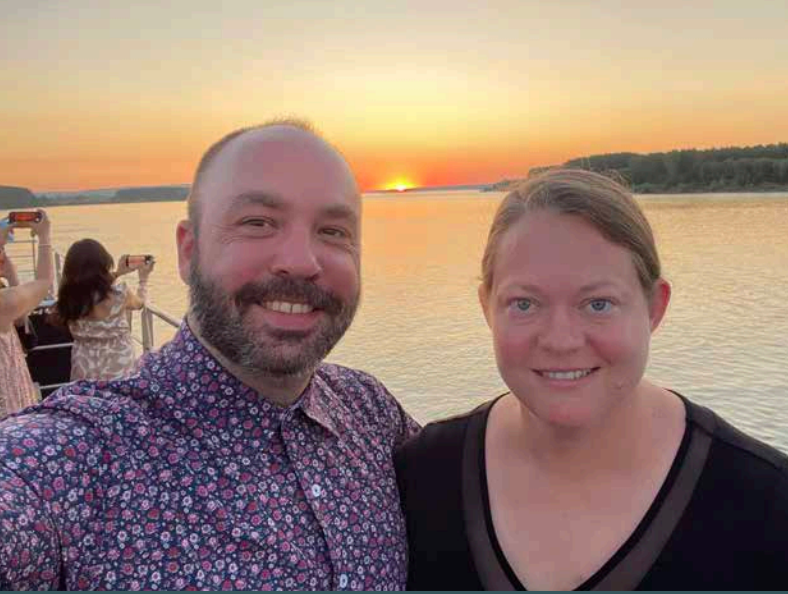
TAKING IN A STUNNING SUNSET