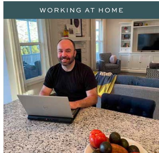
WORKING AT HOME