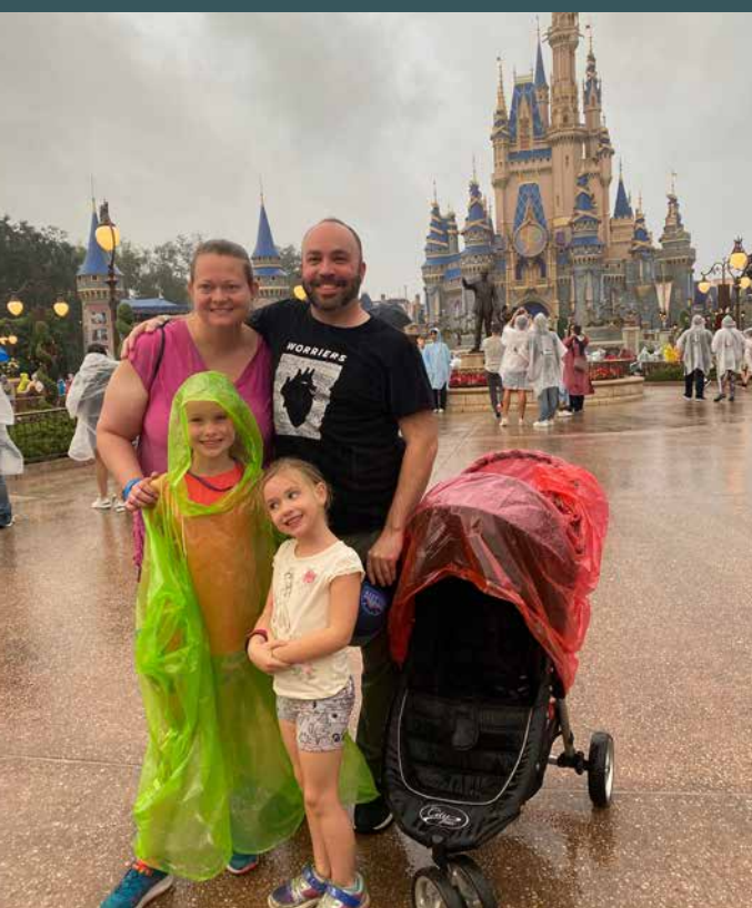
FAMILY TRIP TO DISNEY