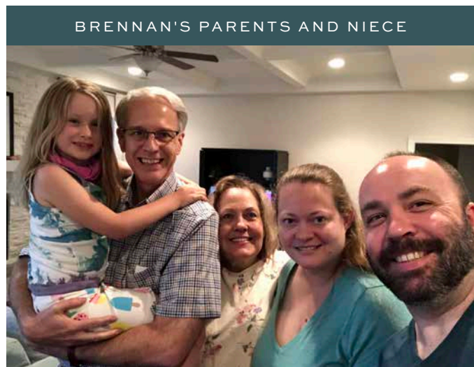
BRENNAN'S PARENTS AND NIECE