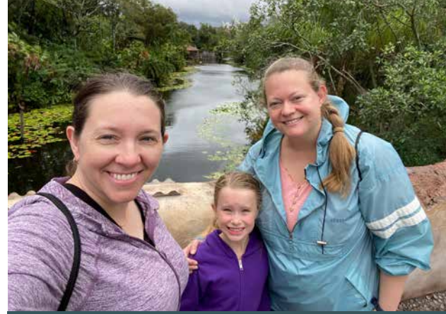
BRENNAN'S SISTER AND NIECE