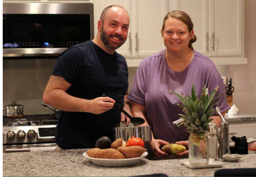
COOKING DINNER TOGETHER