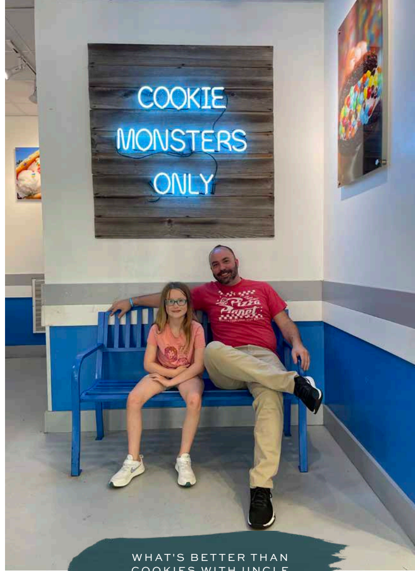
WHAT'S BETTER THAN COOKIES WITH UNCLE TRAVIS?