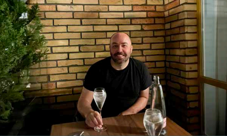
DINNER IN BUDAPEST