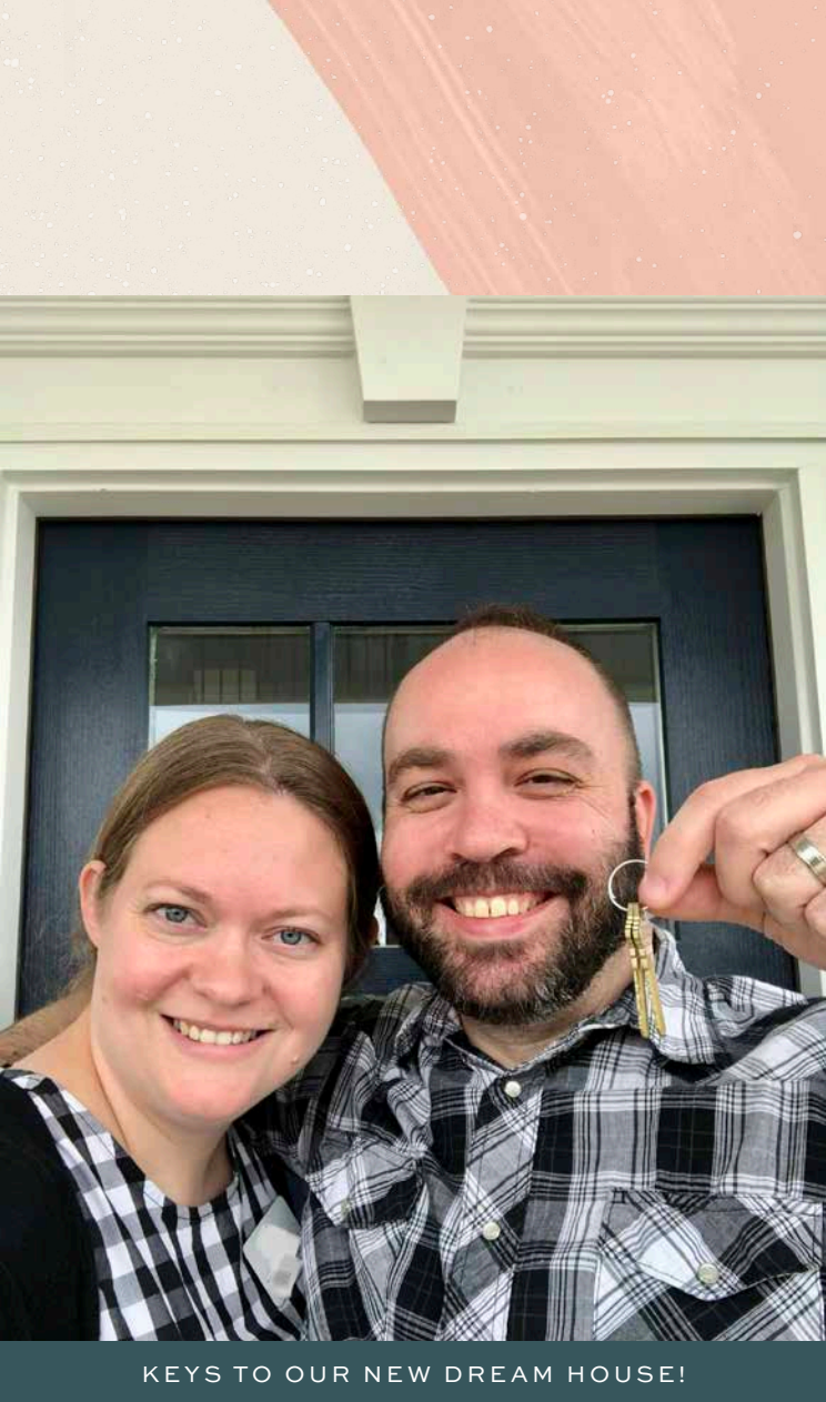
KEYS TO OUR NEW DREAM HOUSE!