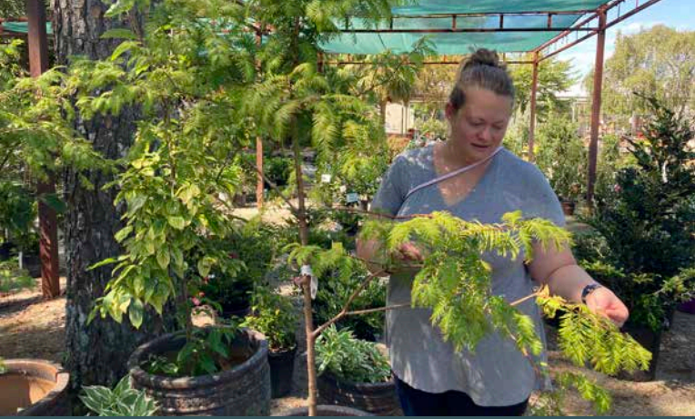
AT A LOCAL GARDEN CENTER