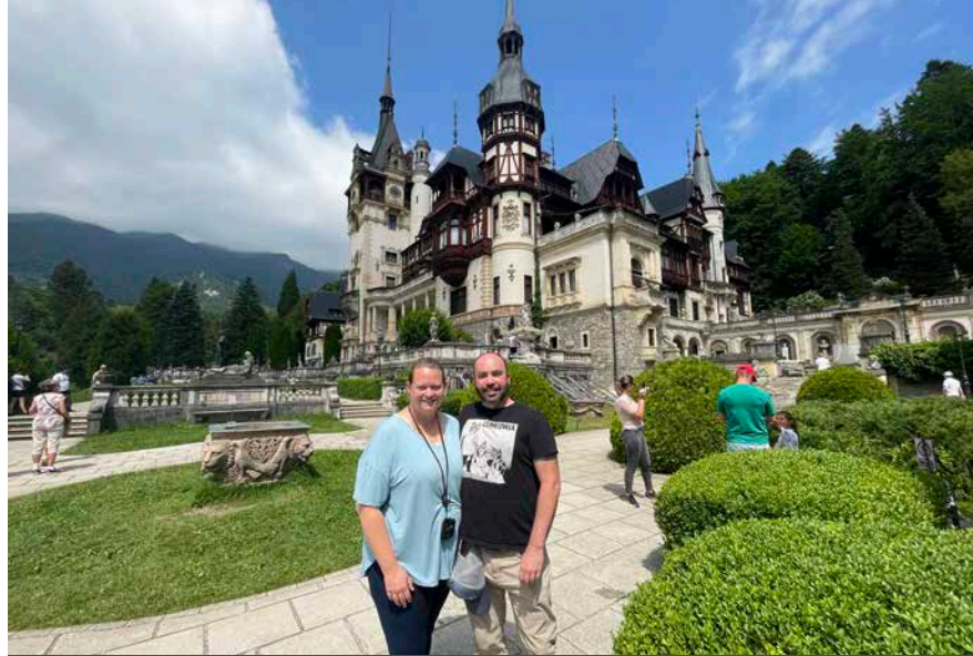
PELES CASTLE IN ROMANIA