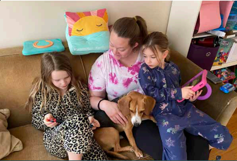
VIDEO GAMES WITH OUR NIECES