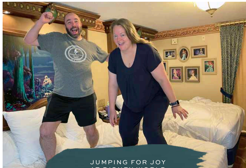
JUMPING FOR JOY AT DISNEY WORLD