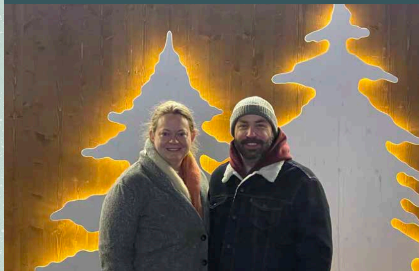
CHRISTMAS MARKET IN VIENNA