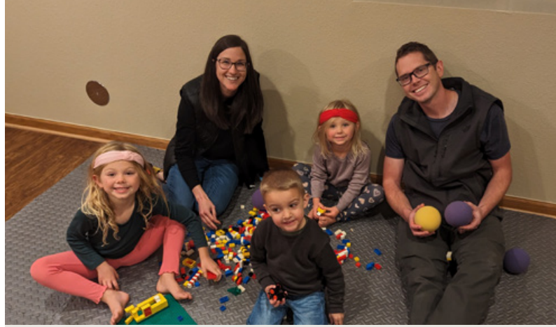
WE TAKE TURNS AT SMALL GROUP PLAYING WITH THE KIDDOS WHILE PARENTS DO A BRIEF STUDY, THEN WE ALL COME BACK TOGETHER TO SING