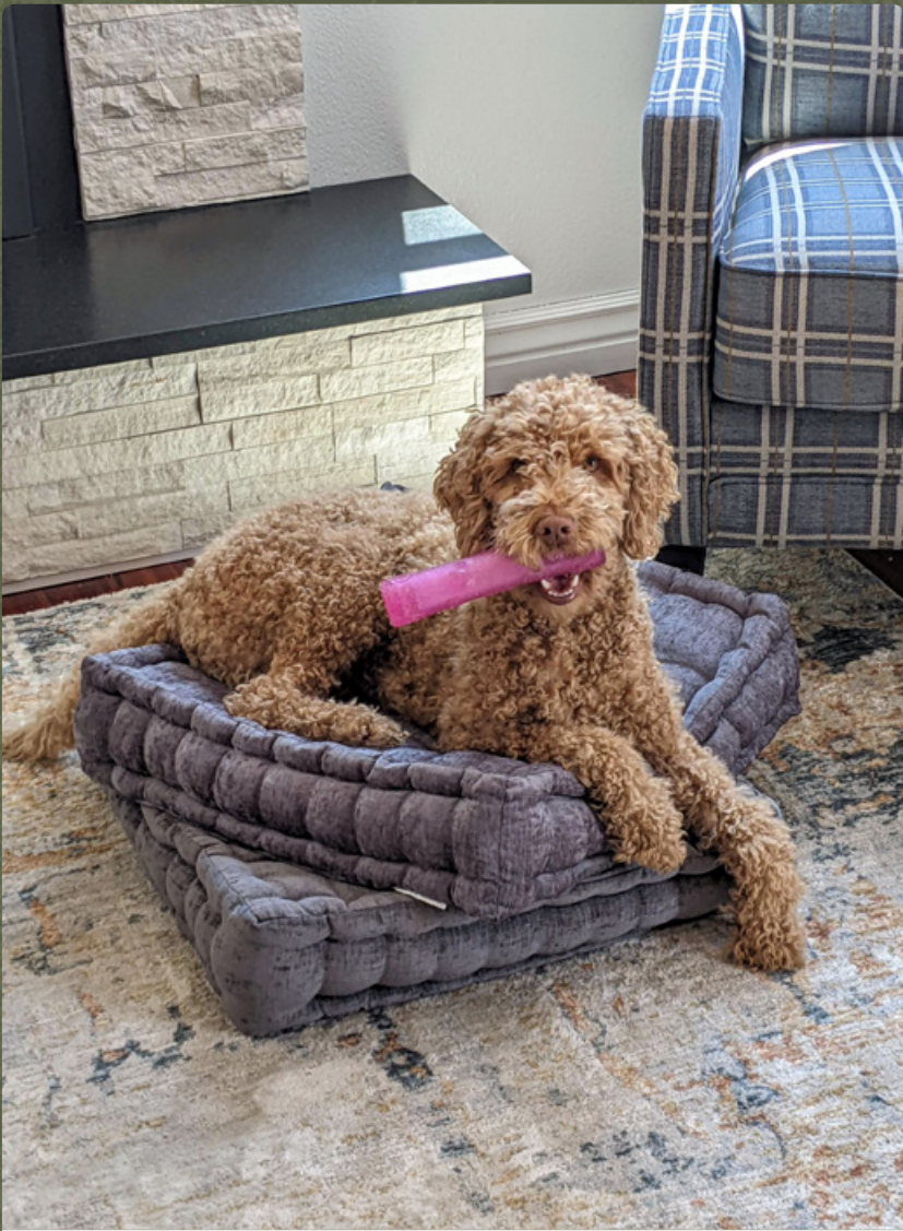
BETSY LOVES COMFORT AND PLAYING WITH HER TOYS

Last year we worked hard to paint and freshen up the main floor to make it warm and inviting. We brightened up the space and have cozy leather couches to plop down on. A fluffy pillow or cozy blanket is never far away. Our living room also has an overflowing basket of children's toys so that they feel just as welcome in our home. A favorite for the girls is an oversized My Little Pony with hot-pink hair, while the boys gravitate to a variety of trucks, and all seem to enjoy the Mrs. Potato Head. We love having a dining room with a large table for everyone to squeeze in around. We believe that food not only nourishes the body but also the soul. Because of that, our kitchen is a major fixture of our home and Alex is often baking sourdough bread or experimenting with new recipes in hopes of blessing Colton and anyone sharing at our table.