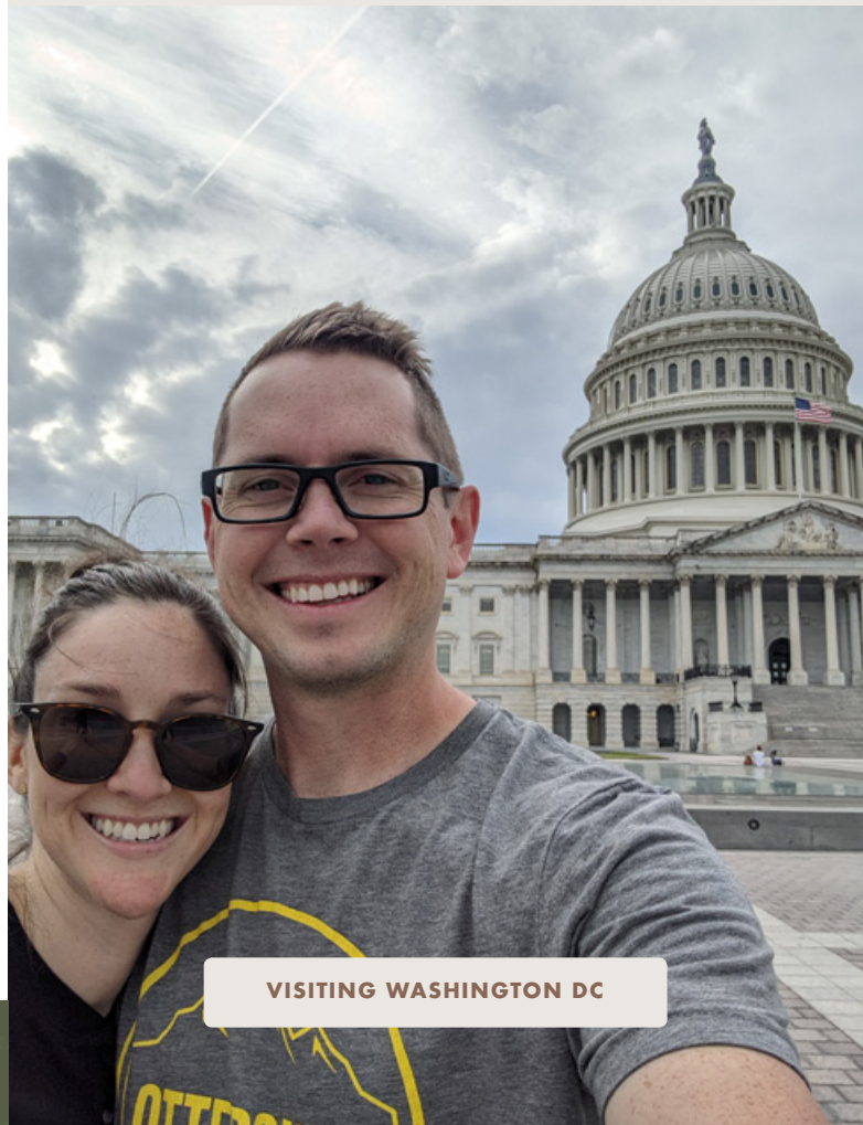
VISITING WASHINGTON DC