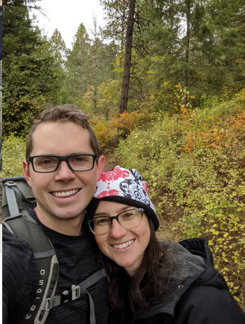
HIKING IN THE BEAUTIFUL PACIFIC NORTHWEST

Outside of hosting family and friends, there is a quiet emptiness in our home that is just waiting to be filled with the noise and joy of the blessing of children. We long for the cries, cooing, and giggles of a child to fill our home. In our years long struggle with infertility, our hearts have longed for a child to pour out our love on.