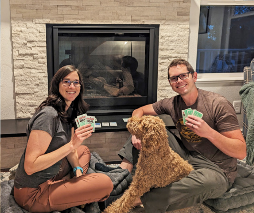
WE OFTEN WIND DOWN IN THE EVENING WITH A FEW ROUNDS OF MONOPOLY DEAL

We connected over a shared faith in the God of the Christian Bible, a shared belief in the importance of education, and a love for being active and getting outside in our beautiful state. We did pre-marital counseling and that has continued to serve us well, as well as having a strong community around us, in navigating both the joys and the bumps in marriage. And when we have a bump, we are committed to working it out together and strive to be quick to ask for forgiveness and seek reconciliation before the sun goes down. We value transparency and honesty in our marriage and we're one another's best friend and "safe place" to process both the joys and hard experiences of life. Our marriage is marked by striving to love God and love our neighbor, which includes one another as our most important "neighbor".