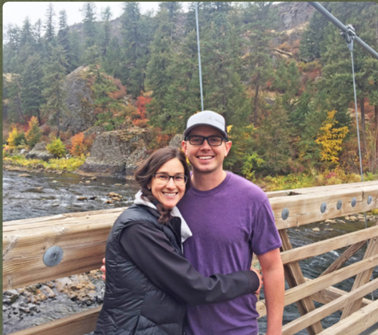
VACATION IN SPOKANE VISITING GOOD FRIENDS