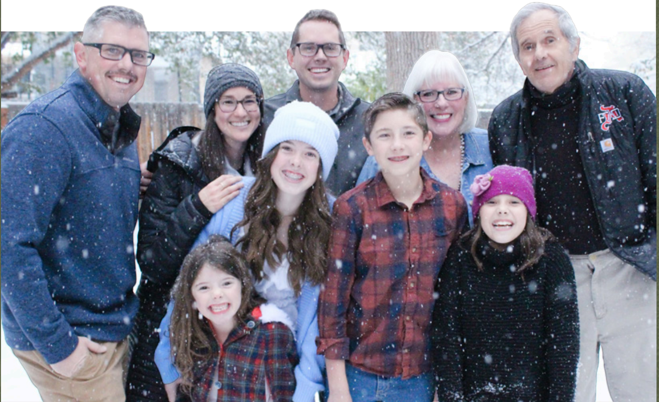
SNOW DAY FOLLOWED BY THE BEST MEATBALLS AND ALFREDO PASTA BY OUR SISTER-IN-LAW AMBER