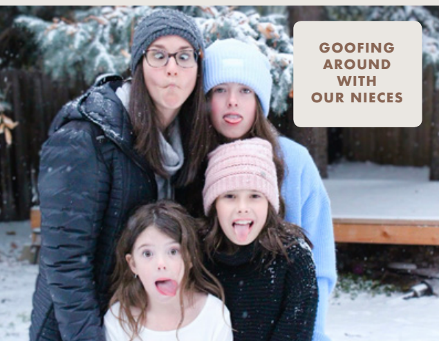
GOOFING AROUND WITH OUR NIECES

We are grateful to live close to family.