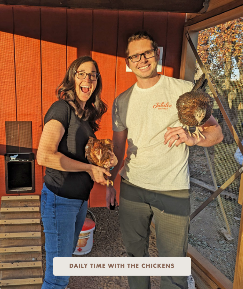
DAILY TIME WITH THE CHICKENS