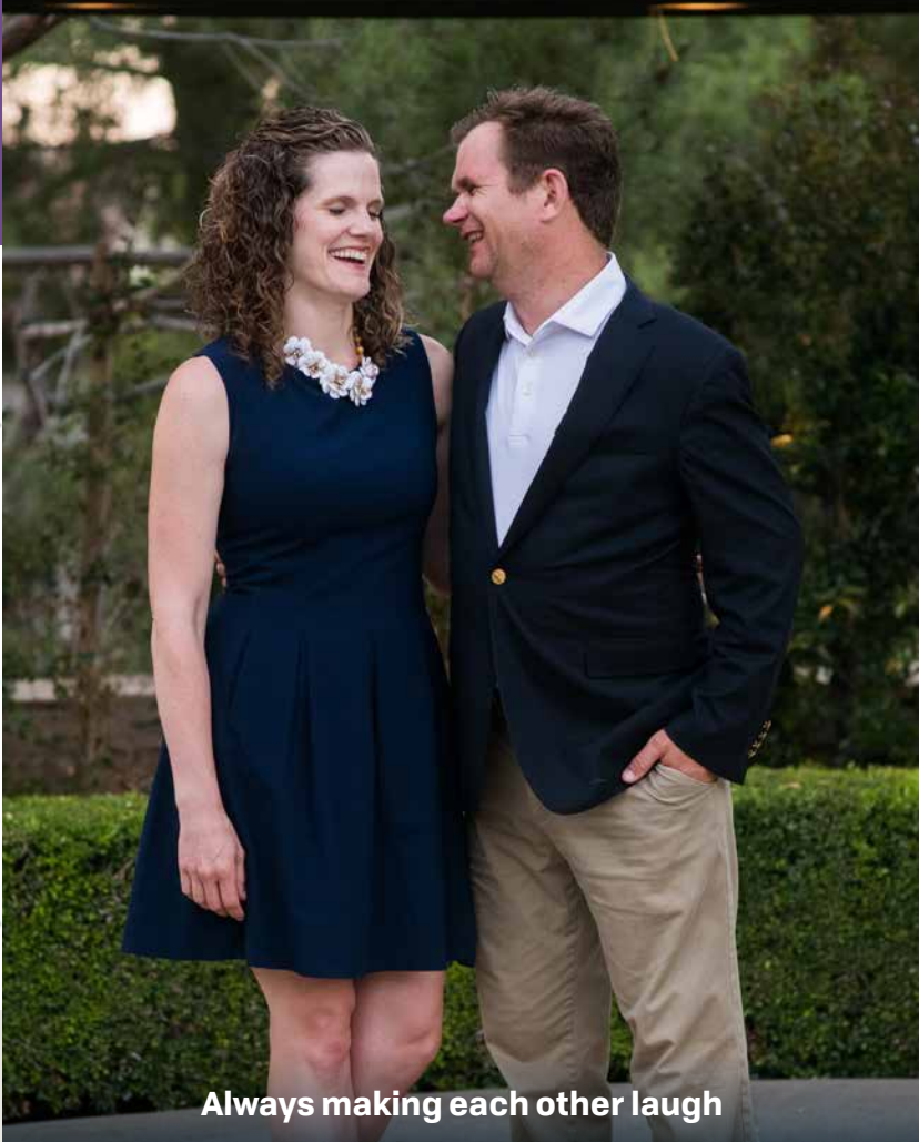
Always making each other laugh