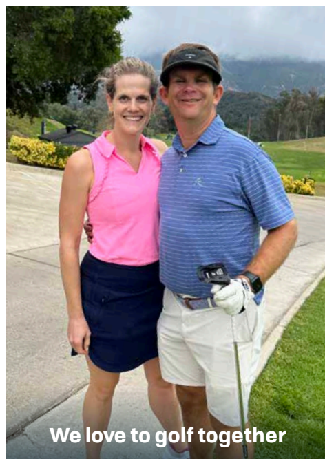
We love to golf together