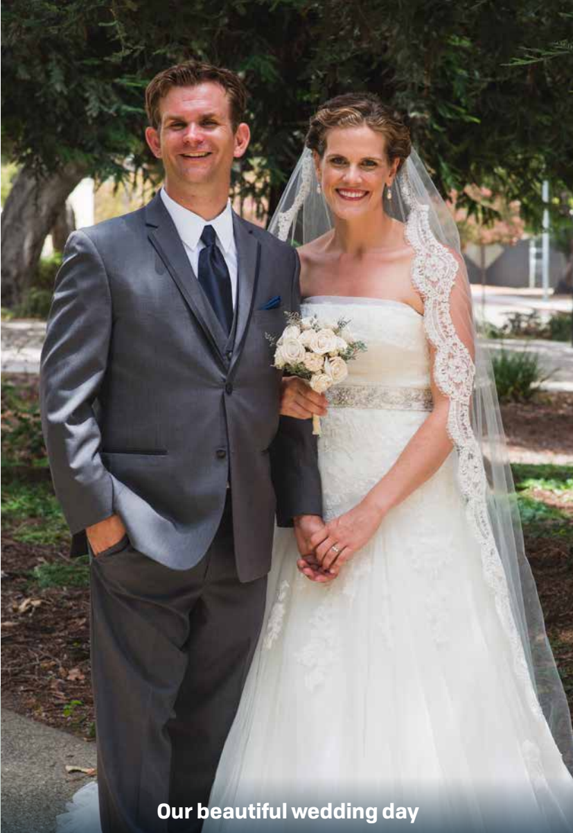
Our beautiful wedding day

We were both raised in Southern California and have been happily married for nine years.