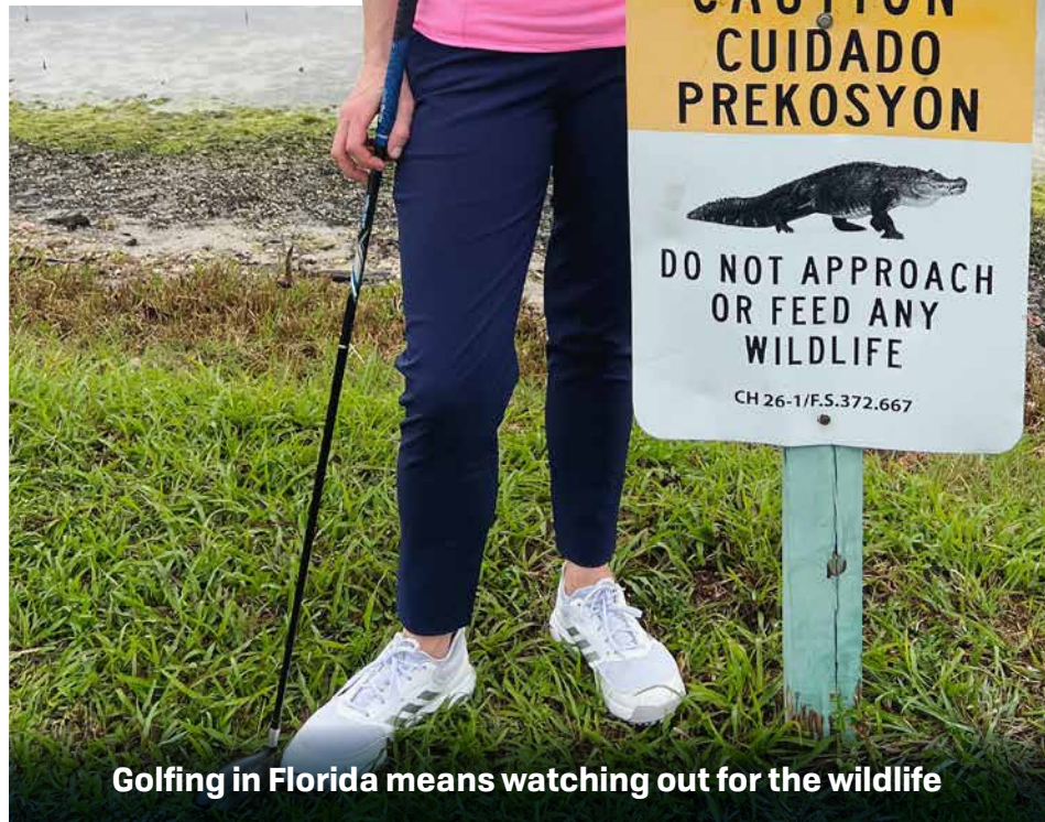
Golfing in Florida means watching out for the wildlife