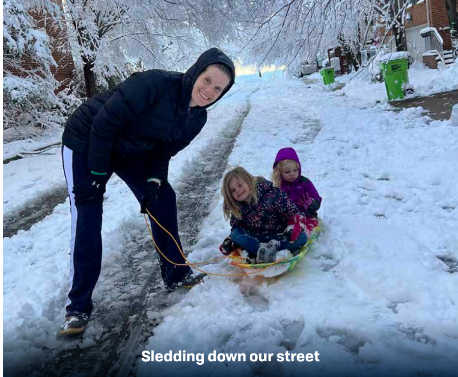
Sledding down our street