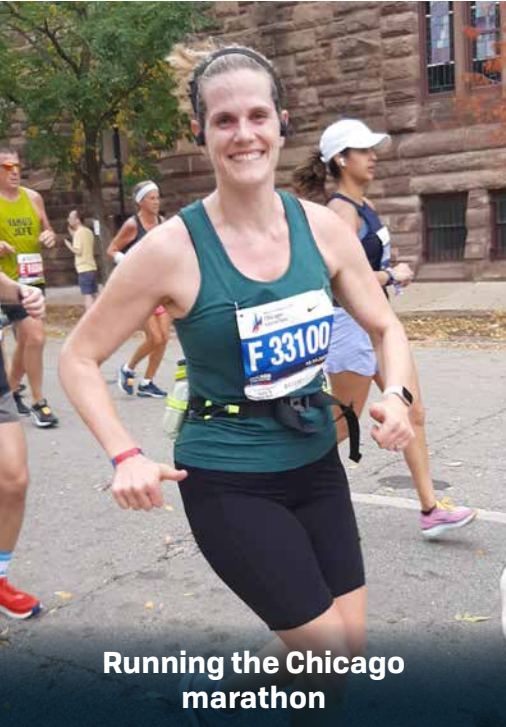
Running the Chicago marathon