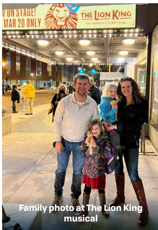
Family photo at The Lion King musical