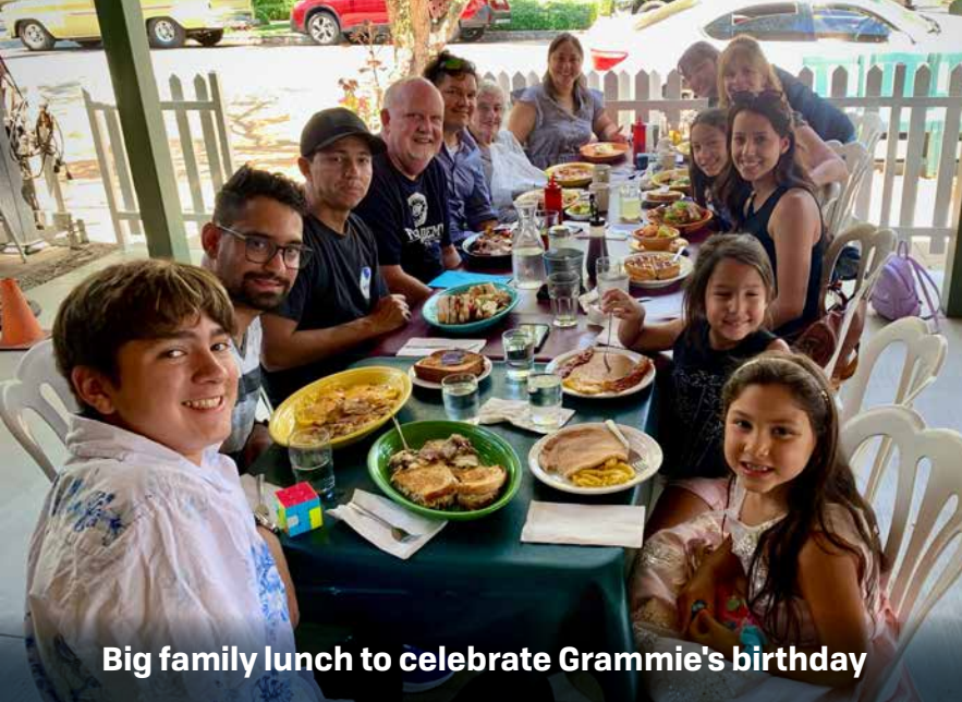
Big family lunch to celebrate Grammie's birthday

Abby's family is very large and very loud!