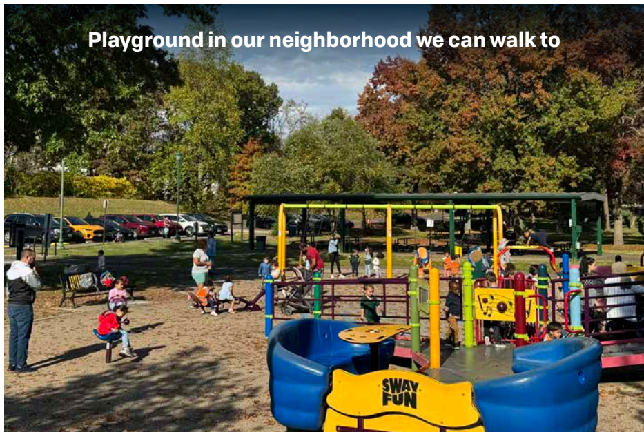
Playground in our neighborhood we can walk to