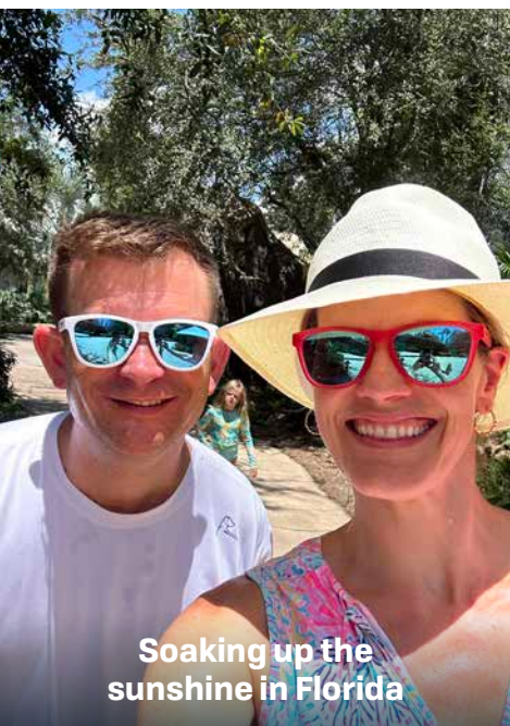
Soaking up the sunshine in Florida

We love to play golf together and throw some fierce competition out there on the fairway into our loving marriage.