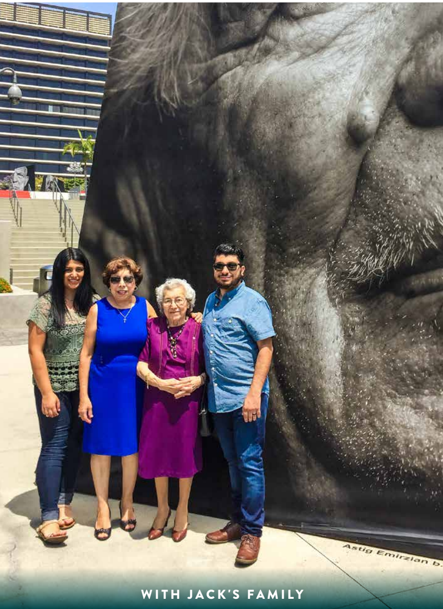
WITH JACK'S FAMILY