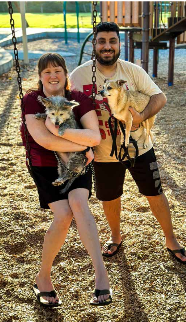
↓ AT THE PARK WITH OUR DOGS