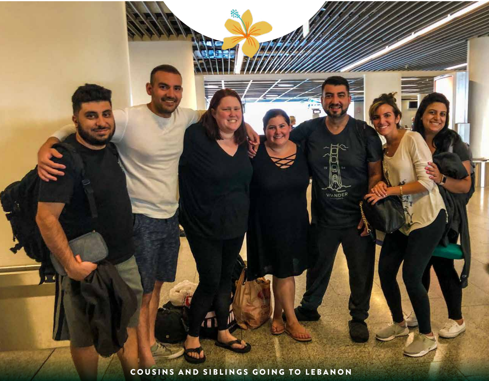
COUSINS AND SIBLINGS GOING TO LEBANON