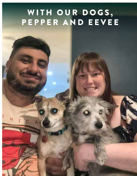
WITH OUR DOGS, PEPPER AND EEVEE

A quick friendship developed, but it wasn't until years later that we knew God had a lifelong plan for us together!