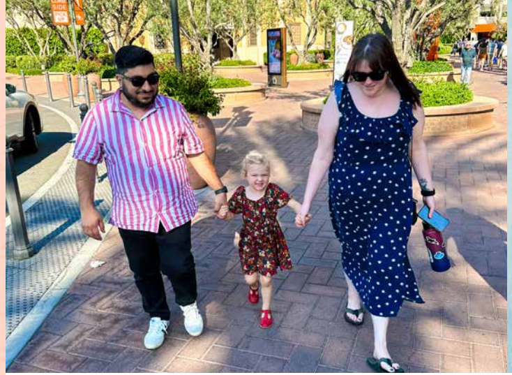
↑ SPENDING TIME WITH OUR FRIEND'S DAUGHTER