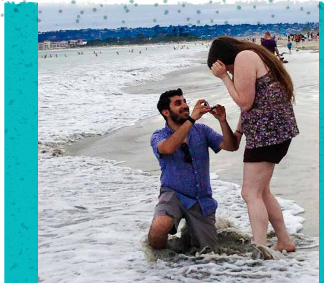
OUR PROPOSAL AT THE OCEAN

A quick friendship developed, but it wasn't until years later that we knew God had a lifelong plan for us together!