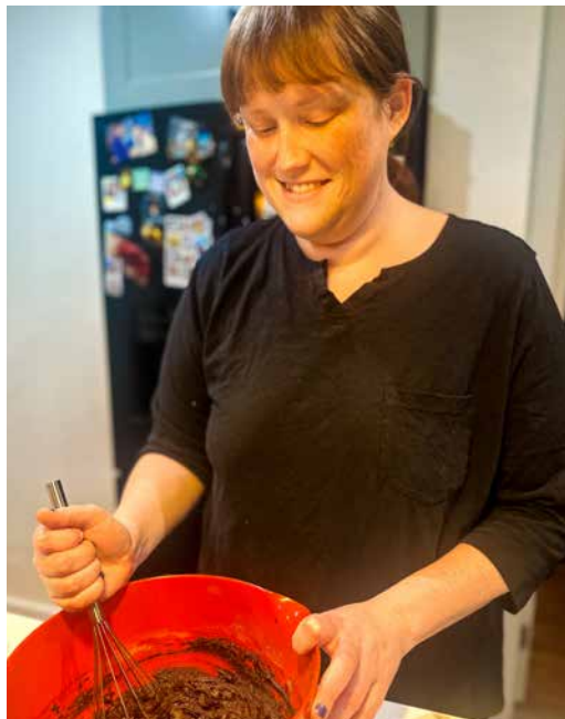
↑ READY, SET, BAKE!