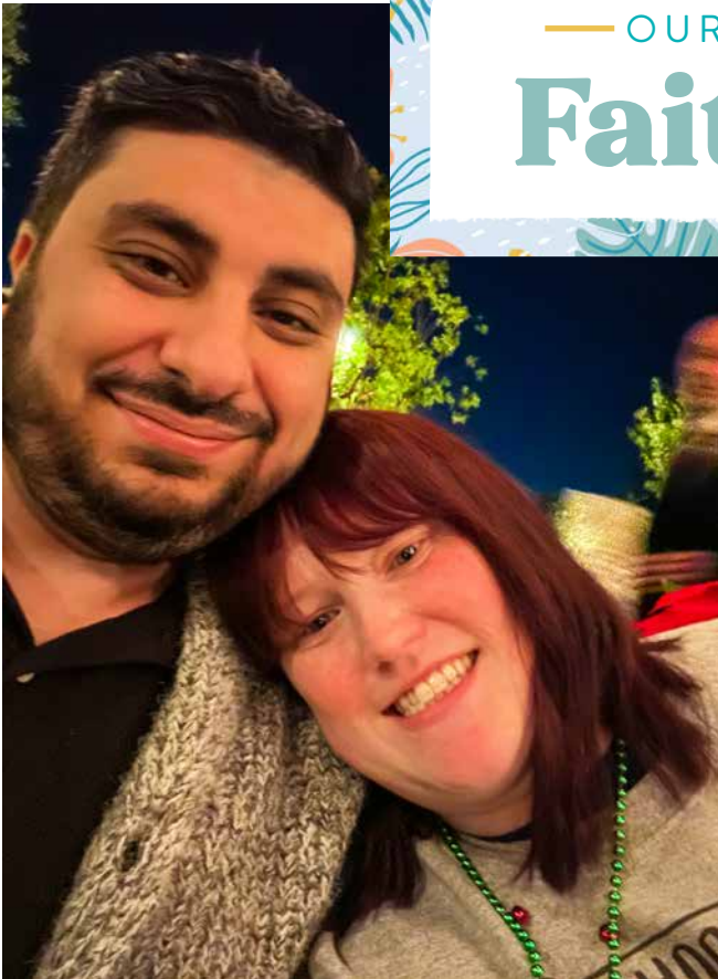
↓ AT OUR CHURCH HOLIDAY PARTY