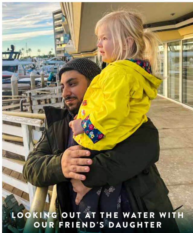
LOOKING OUT AT THE WATER WITH OUR FRIEND'S DAUGHTER