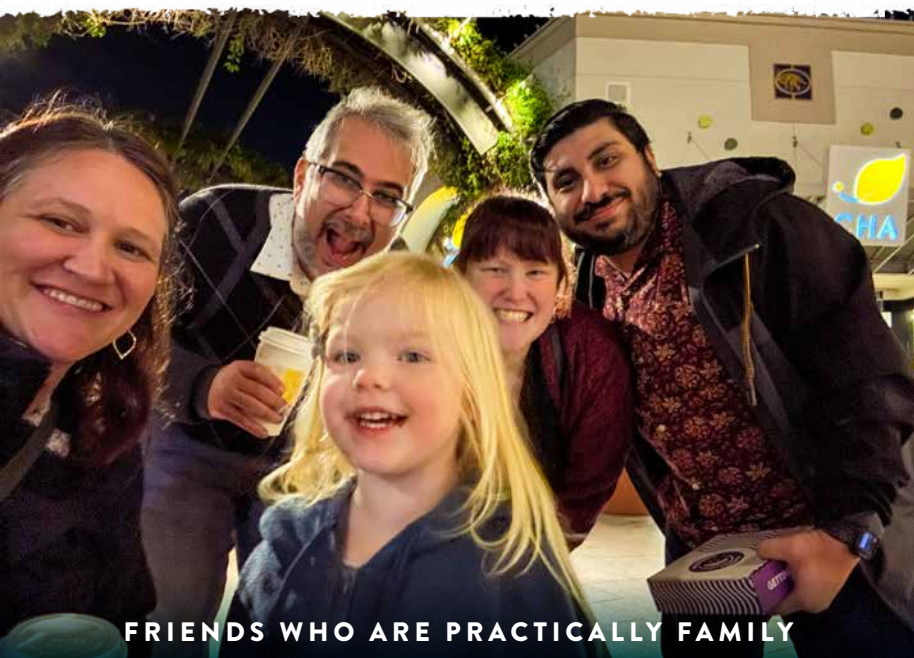
FRIENDS WHO ARE PRACTICALLY FAMILY

We have a circle of close friends who are pretty much family to us. Some of our closest friends have adopted as well and have been extremely supportive of us in our journey so far. We also have incredible support in our church family in Orange County, that we attend every week.