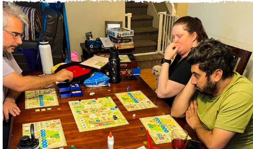
↑ GAME NIGHT GETTING INTENSE