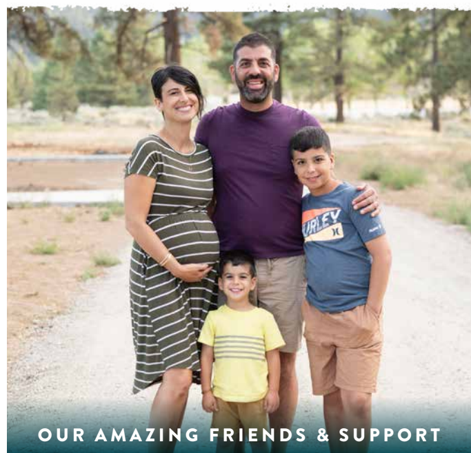
OUR AMAZING FRIENDS & SUPPORT