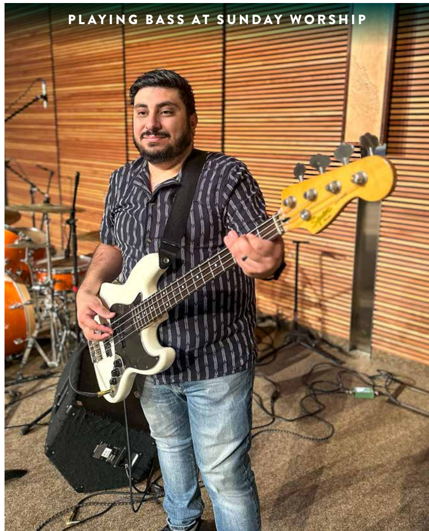
PLAYING BASS AT SUNDAY WORSHIP