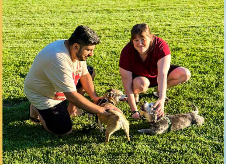
↑ PLAYING WITH OUR DOGS AT THE PARK

Pepper & Eevee were kennel mates at the shelter, and we knew they had to stay together as soon as we saw them. They both have huge personalities, and are a huge source of joy in our lives.