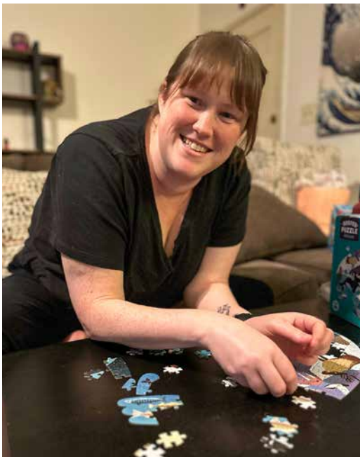
↑ PUTTING TOGETHER A PUZZLE