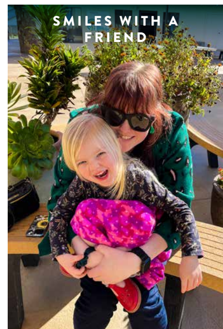
SMILES WITH A FRIEND