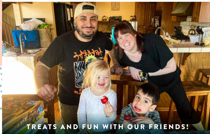
TREATS AND FUN WITH OUR FRIENDS!