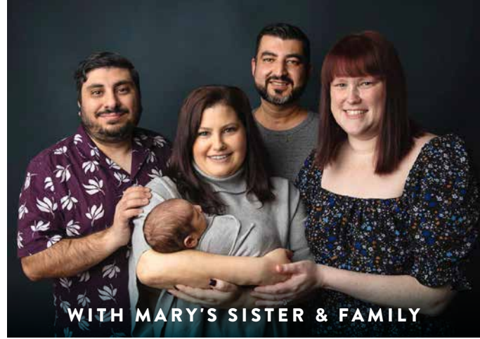
WITH MARY'S SISTER & FAMILY