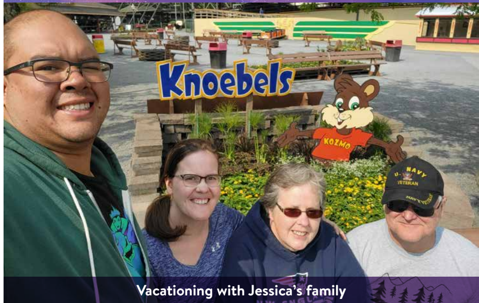
Vacationing with Jessica's family