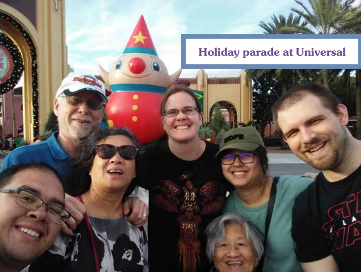
Holiday parade at Universal