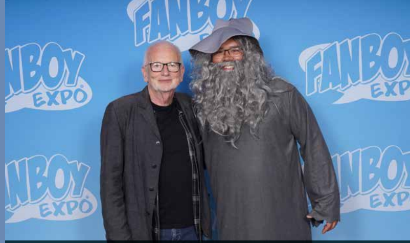
Cosplaying as Gandalf