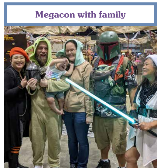
Megacon with family