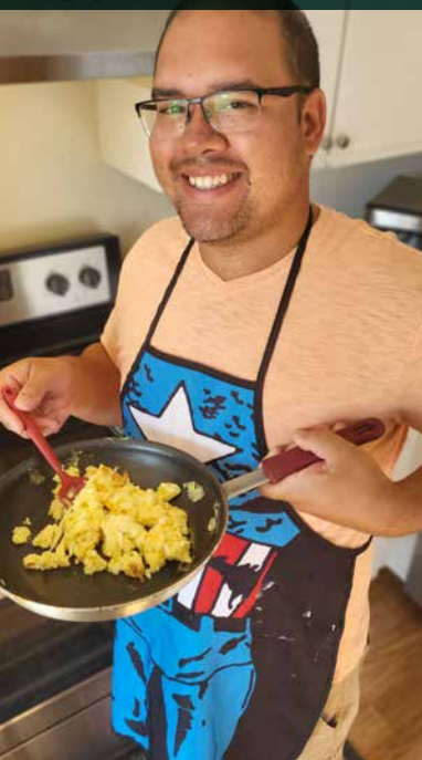
Making scrambled eggs