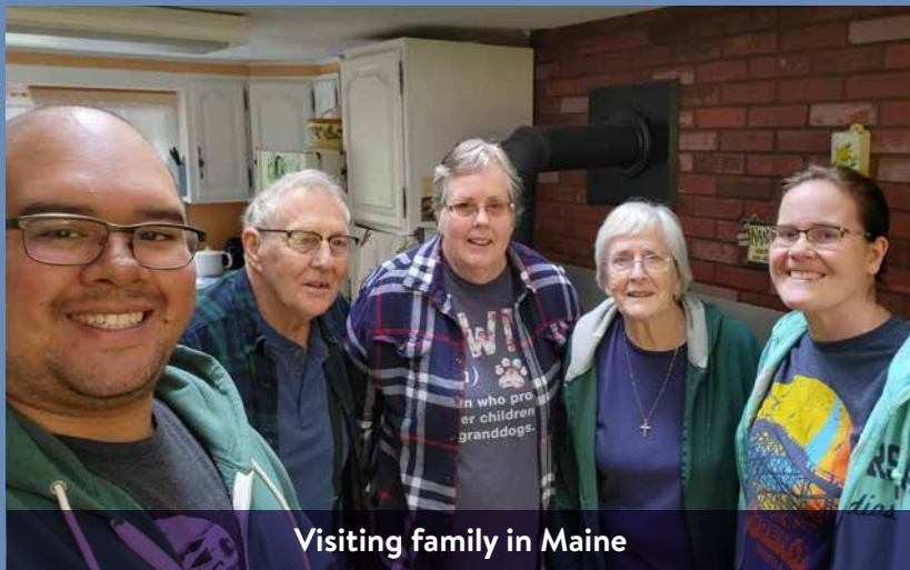
Visiting family in Maine