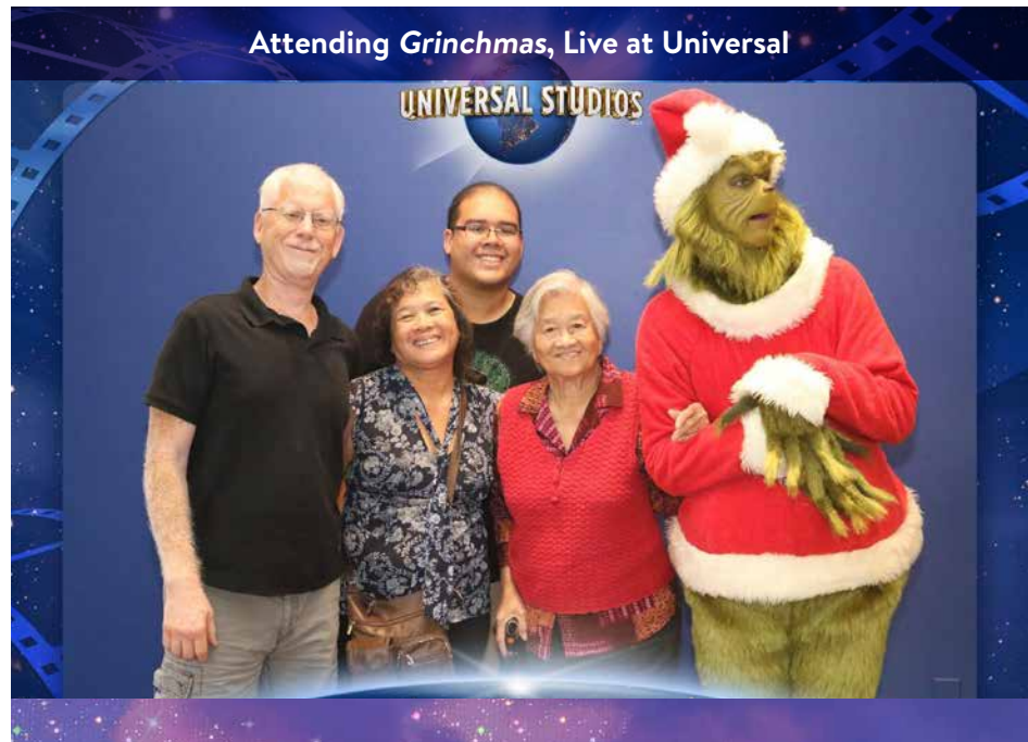
Attending Grinchmas, Live at Universal