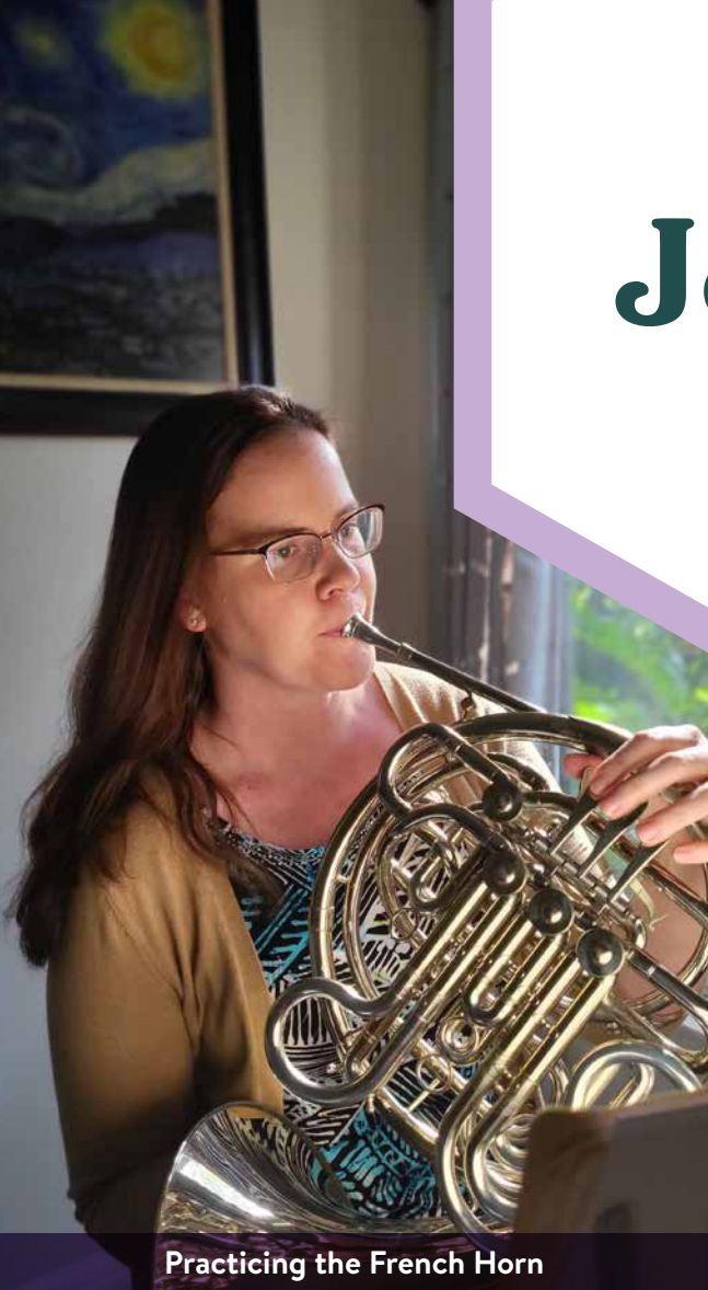
Practicing the French Horn