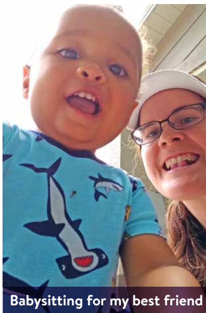
Babysitting for my best friend