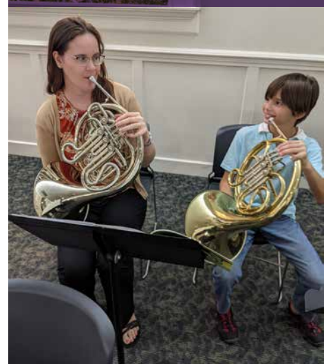
Teaching French Horn lessons