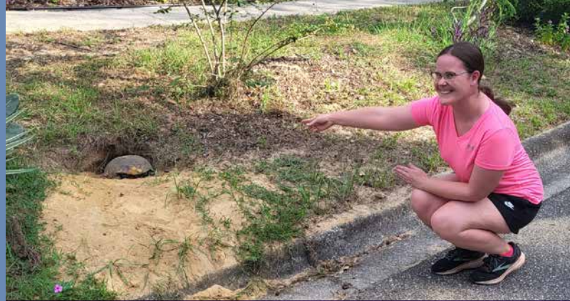
Checking on the tortoise during her weekly walk