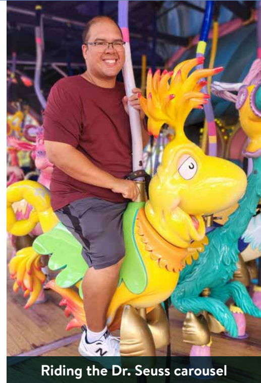
Riding the Dr. Seuss carousel