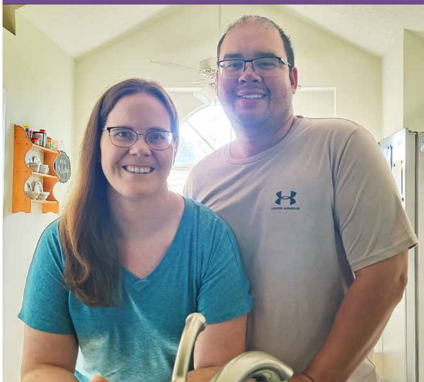
At home together