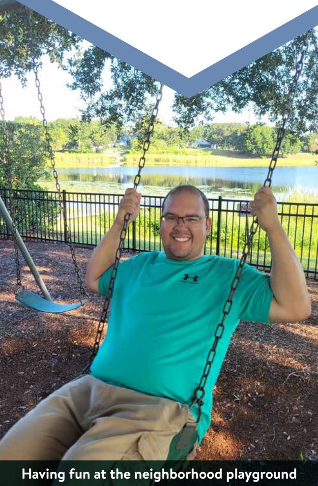
Having fun at the neighborhood playground