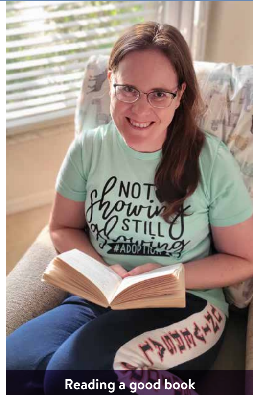
Reading a good book