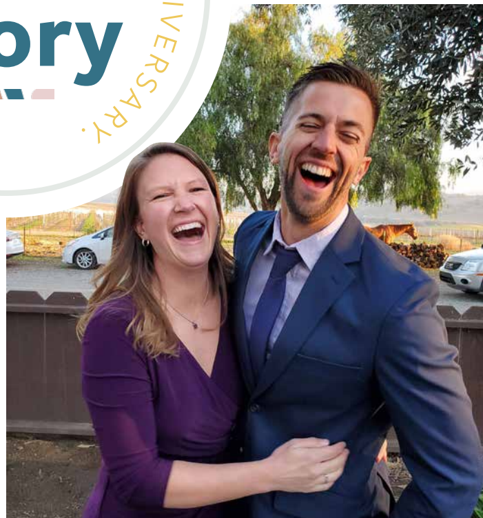
We are always ready to laugh and enjoy life

We make time each morning to snuggle and enjoy coffee together. Its a great way to start the day