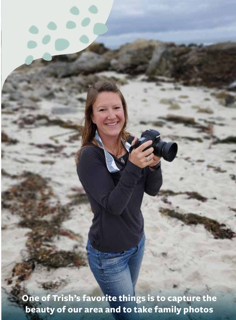
One of Trish's favorite things is to capture the beauty of our area and to take family photos