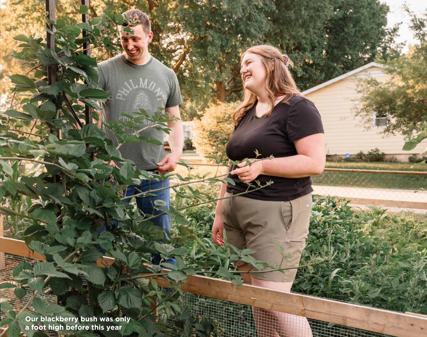
Our blackberry bush was only a foot high before this year