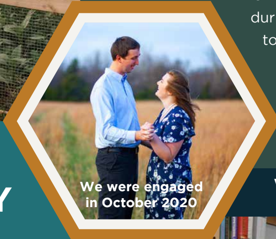
We were engaged in October 2020