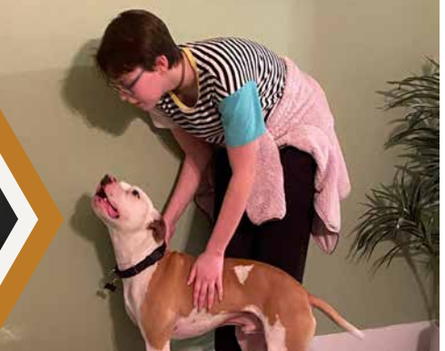
Our niece loves to visit Bumi and give him some love