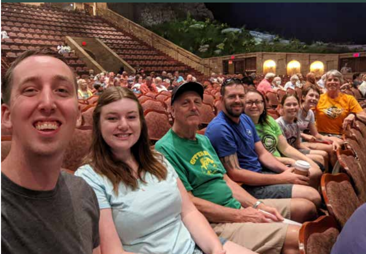
We enjoy theatre productions as a family