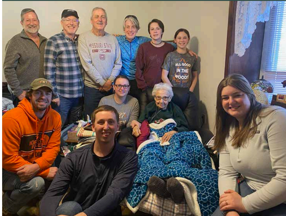
Family is very important to us!