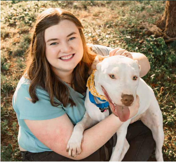
Hamlin prefers to be in someone's lap at all times