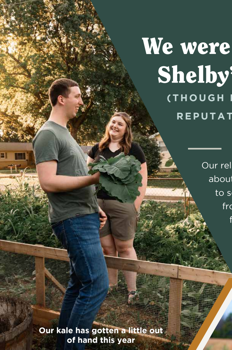
Our kale has gotten a little out of hand this year

We like to explore antique stores on the weekends