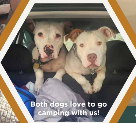
Both dogs love to go camping with us!