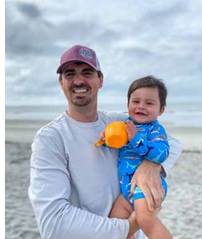
At the beach