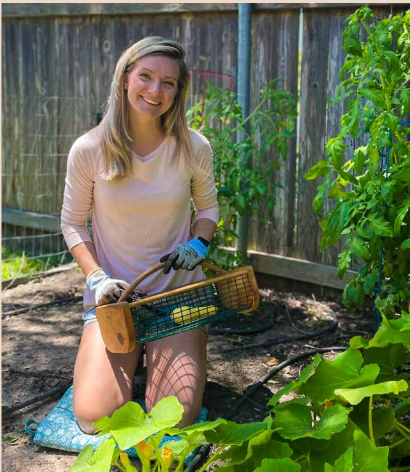
Working in our backyard garden

It is a time to myself to think, pray and clear my head as I start my day.