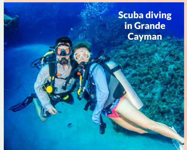
Scuba diving in Grande Cayman