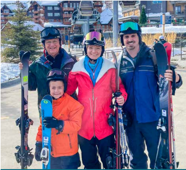
We took our nephew & Paul's dad skiing