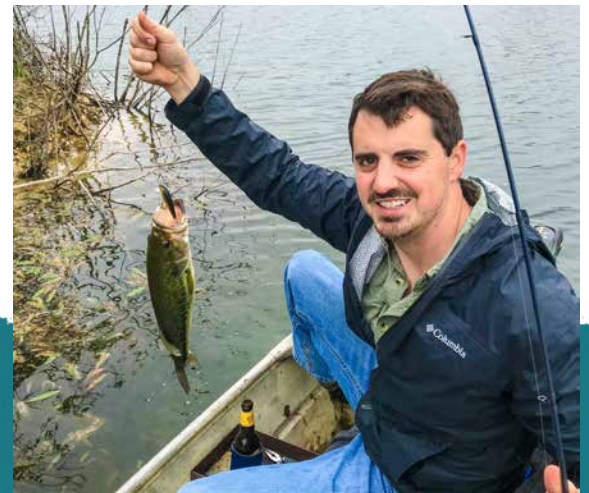
Fishing is a favorite hobby