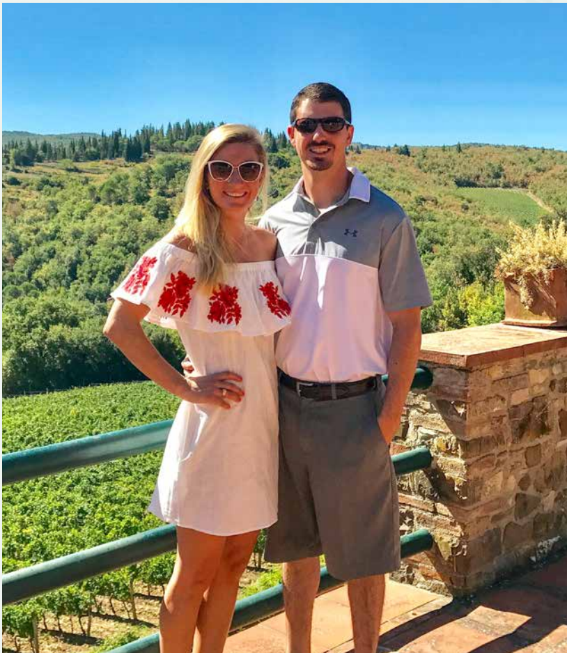
Wine tasting in Italy

It's so good to meet new people and learn new things. We want them to know there is a big beautiful world out there waiting to be explored.