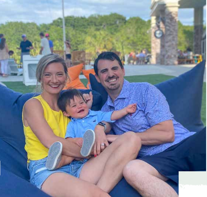
We can't wait for our family to grow!