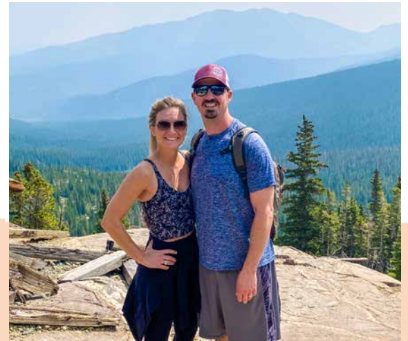
Hiking in Breck, Colorado