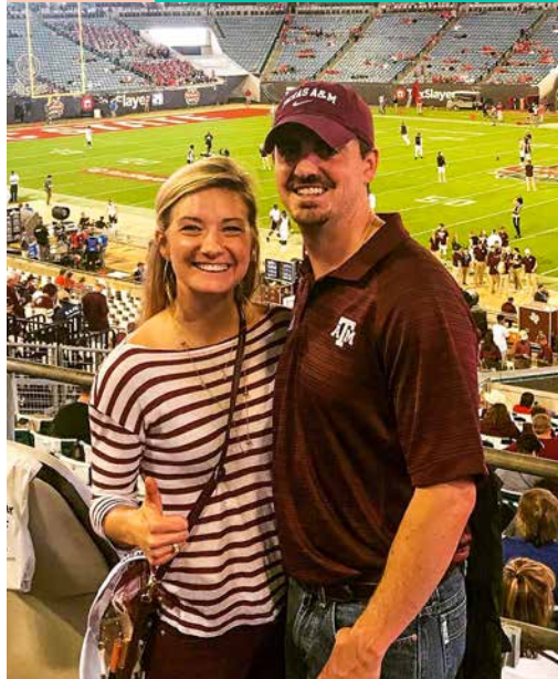
At a Texas A&M football game