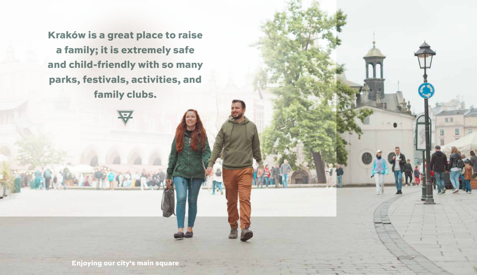
Enjoying our city's main square