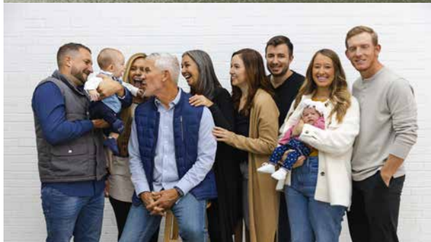
Of course the grandchildren are the stars of the family