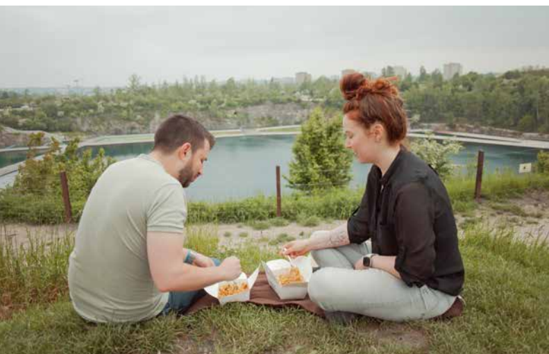
Indian food picnic at a quarry 10 minutes from our home

The home we are building in 2023 is on the side of a hill with a view of the Polish mountains, an established neighborhood with young families, and a park less than a two-minute walk away. In addition, we will have a large yard to enjoy the four seasons and a large garden of all different vegetables and fruits for our children and us to play, learn, and eat from.