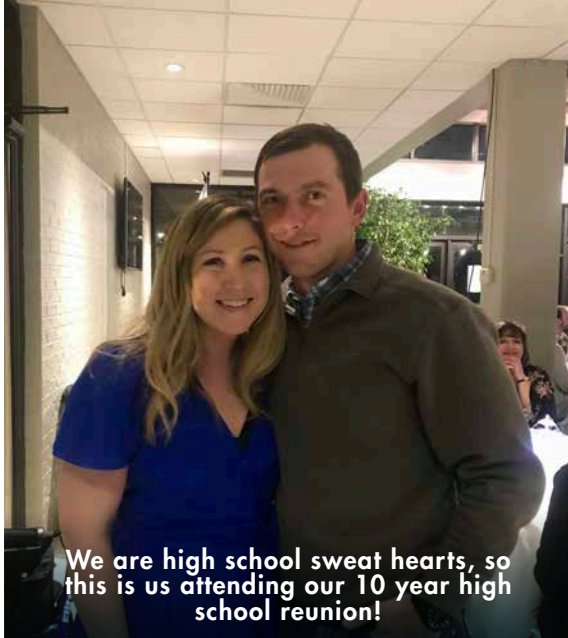
We are high school sweat hearts, so this is us attending our 10 year high school reunion!