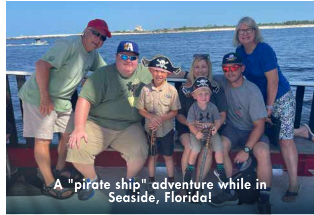
A "pirate ship" adventure while in Seaside, Florida!