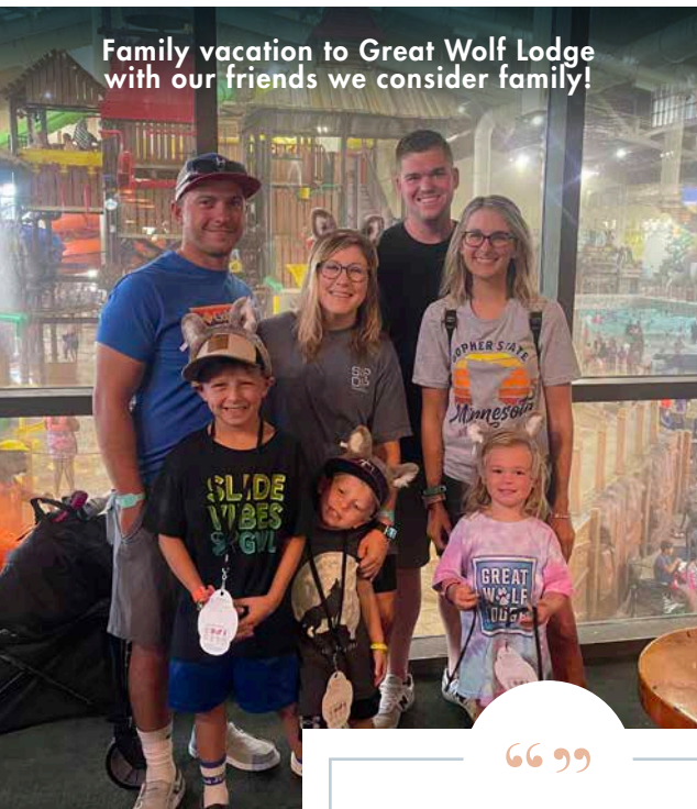
Family vacation to Great Wolf Lodge with our friends we consider family!