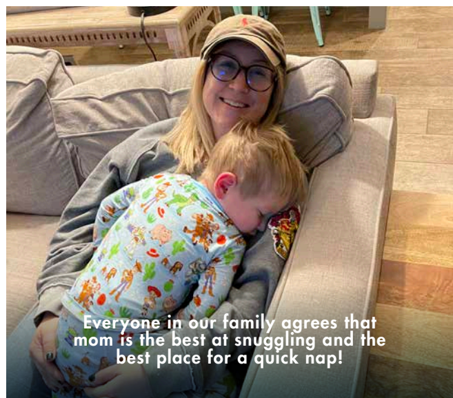
Everyone in our family agrees that mom is the best at snuggling and the best place for a quick nap!