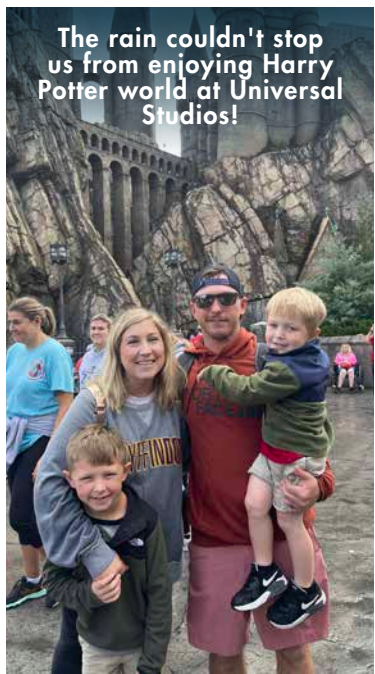
The rain couldn't stop us from enjoying Harry Potter world at Universal Studios!