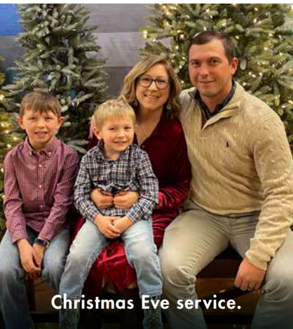
Christmas Eve service.