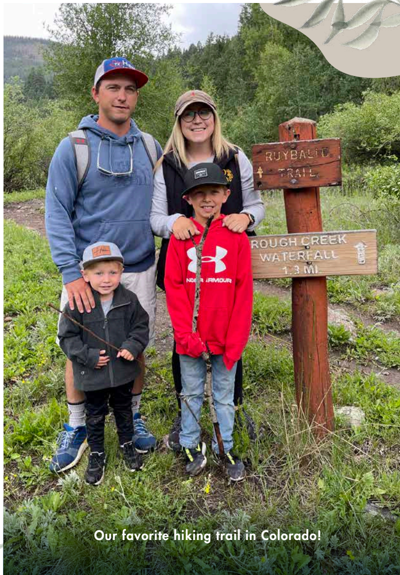
Our favorite hiking trail in Colorado!

As a family we enjoy watching the movies, reading the books, and have even gone on trips to Disney World and Universal Studios to see these mythical places come to life!