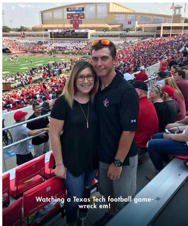
Watching a Texas Tech football game- wreck em!