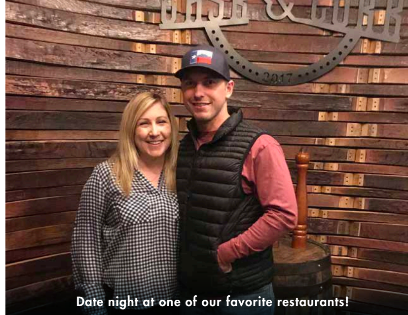
Date night at one of our favorite restaurants!