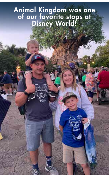
Animal Kingdom was one of our favorite stops at Disney World!