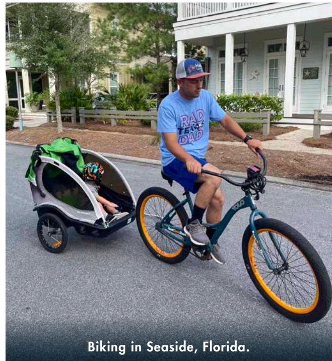
Biking in Seaside, Florida.