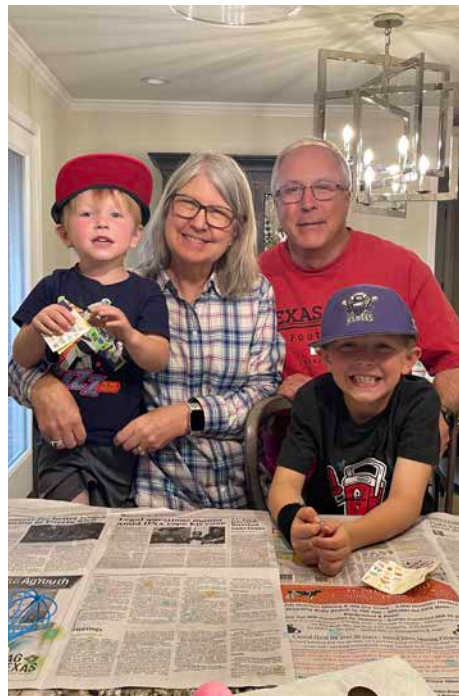
Easter egg decorating with Gigi and Old Daddy, what the kids call Ashlee's parents!