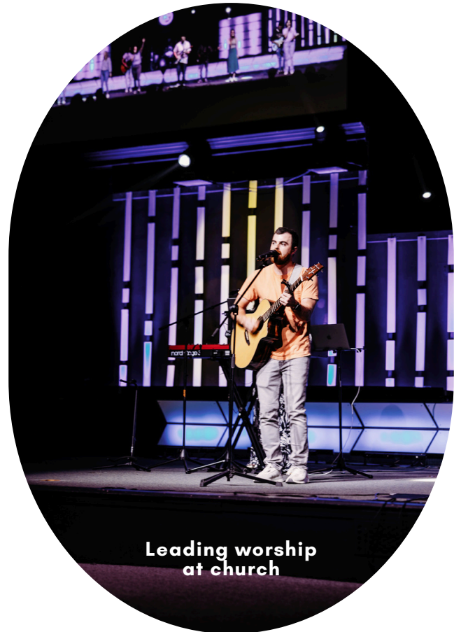
Leading worship at church