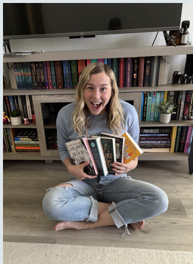
I love reading!