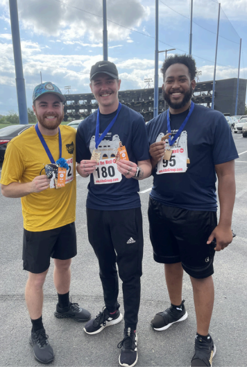
5k with friends in town