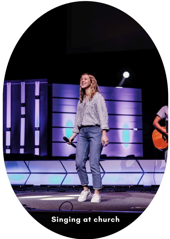
Singing at church