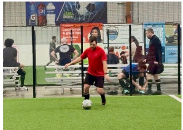
Playing indoor soccer