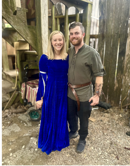
Tulsa Renaissance festival