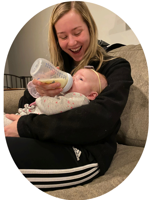
Bottle time at the daycare Sydney worked at