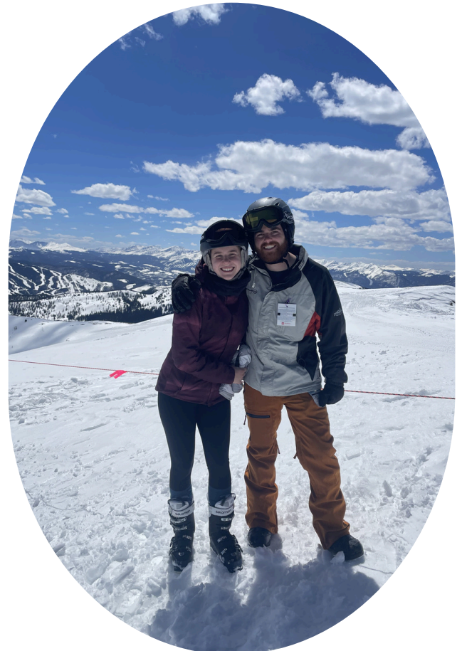
Skiing in Colorado