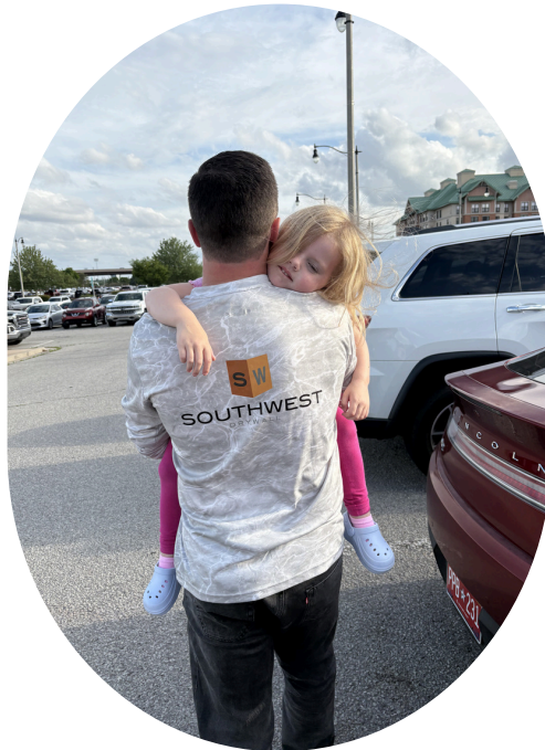
Carrying our niece after a long day outside