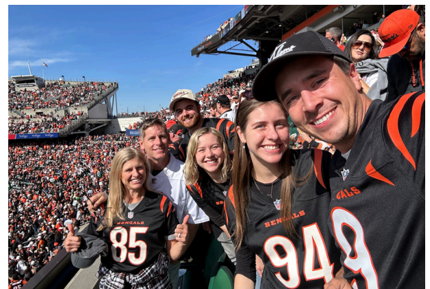
Bengals game with Sydney's family