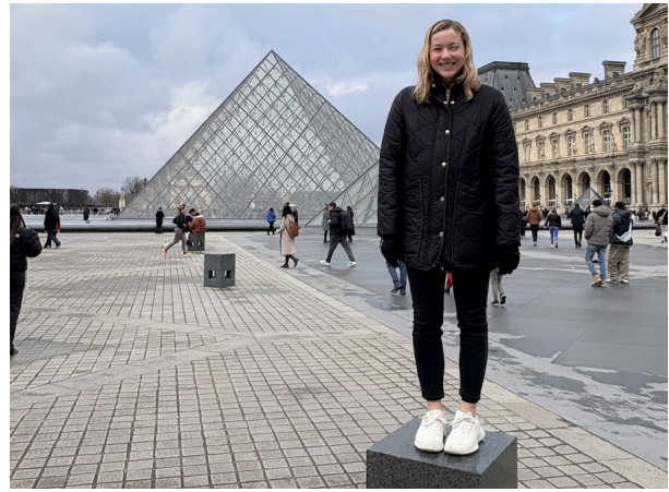
Traveling to new places