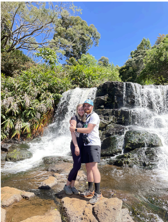
Hiking in Hawaii