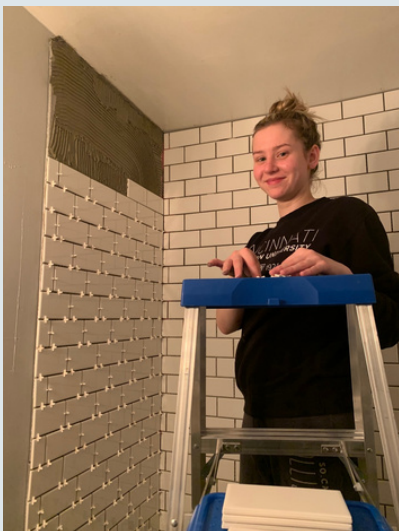
Working on house projects