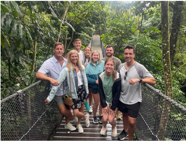
Vacation with Sydney's family