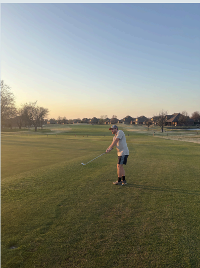
My favorite hobby - playing golf