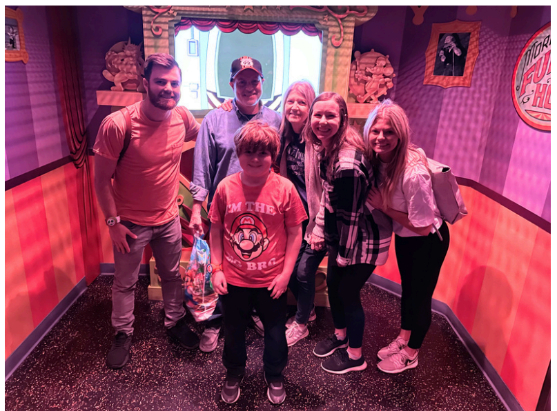
Universal Studios with Chris' family