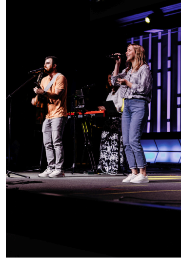
Leading worship at church