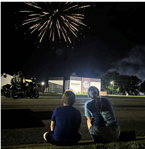
4th of July fireworks with our nephew