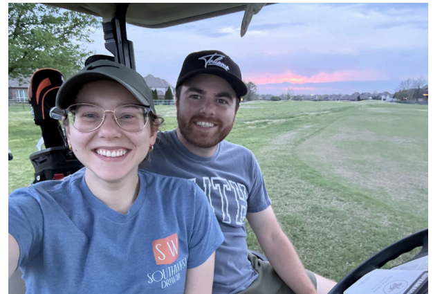
Playing golf together after work

These hobbies and traditions give us time to connect, recharge, and fully enjoy the life we're building as a family.