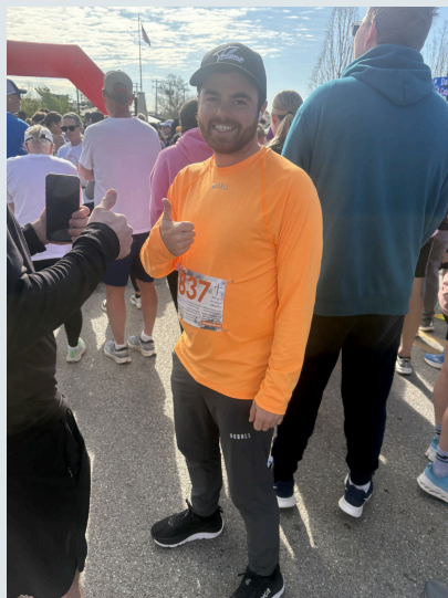
Running local 5k's