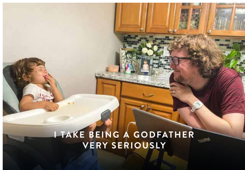
I TAKE BEING A GODFATHER VERY SERIOUSLY