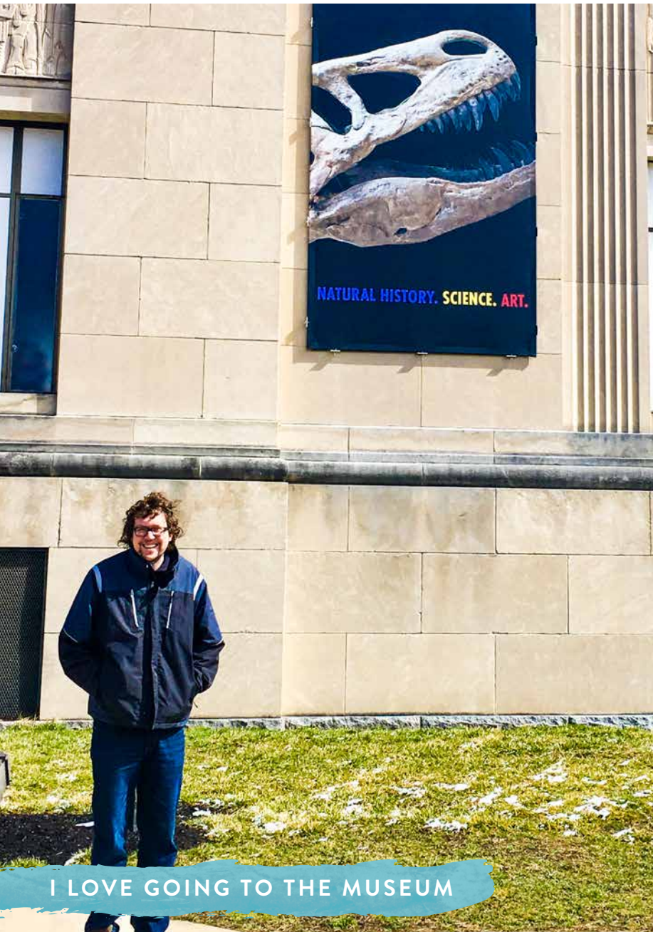
I LOVE GOING TO THE MUSEUM