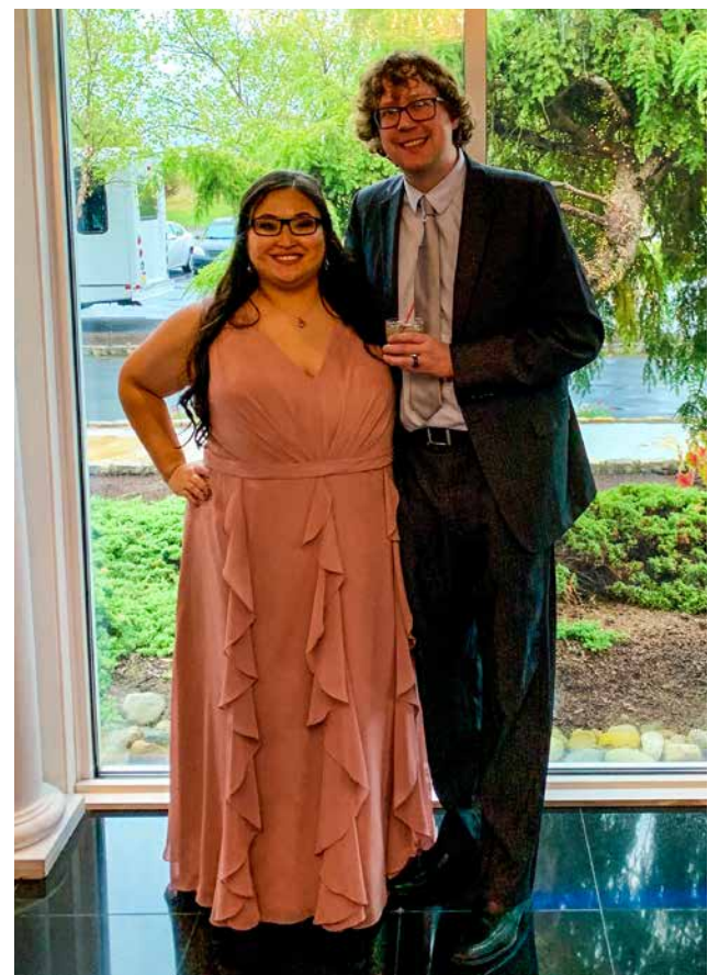
AT THE WEDDING OF A CLOSE FRIEND