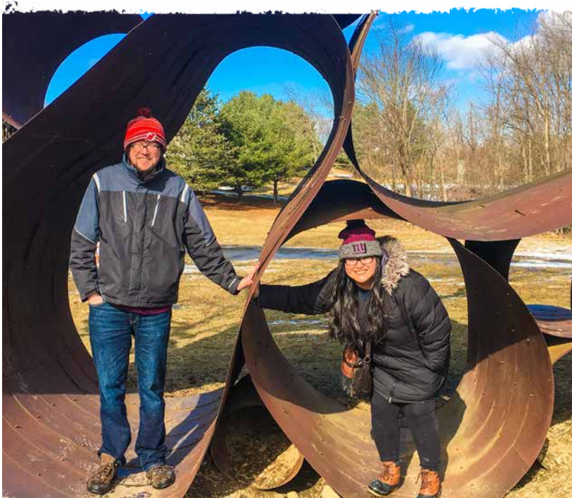
AT THE NY SCULPTURE GARDEN

WE CAN'T WAIT FOR THE NEXT CHAPTER OF OUR LIVES as parents.