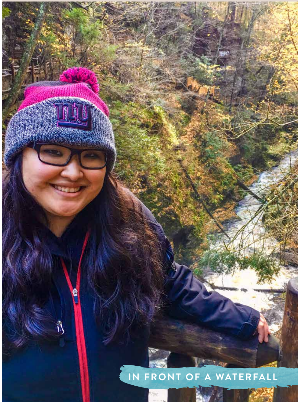
IN FRONT OF A WATERFALL