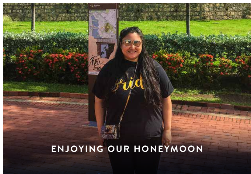
ENJOYING OUR HONEYMOON