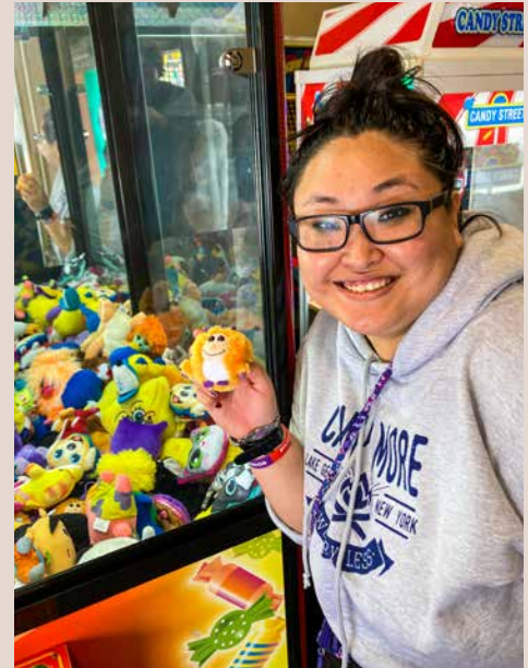
I ALWAYS WIN AT THE CLAW!