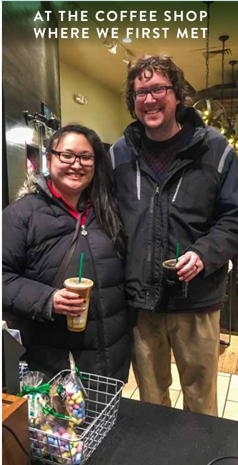
AT THE COFFEE SHOP WHERE WE FIRST MET

WE MET 8 SHORT YEARS AGO AND FELL IN LOVE INSTANTLY. WE BONDED OVER OUR LOVE OF COFFEE, AND FIRST MET AT A COFFEE SHOP!