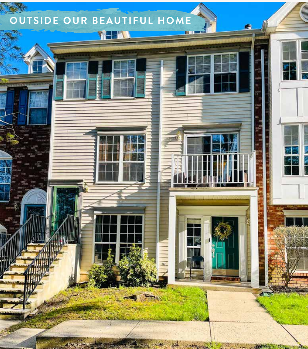
OUTSIDE OUR BEAUTIFUL HOME

OUR TOWN HAS EVEN BEEN RANKED AS one of the best places to live IN THE COUNTRY AS RANKED BY MONEY MAGAZINE. IN ADDITION, ALL OF THE CHILD'S GRANDPARENTS ARE IN THE COUNTY.