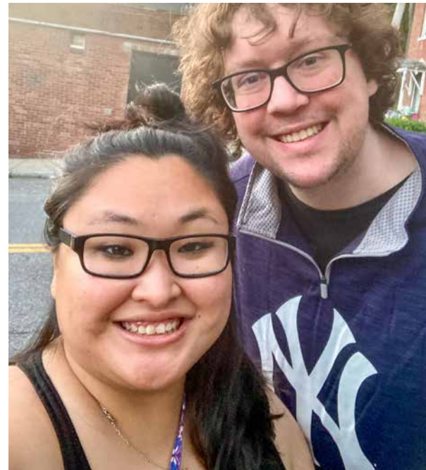
GOING ON WALKS TOGETHER