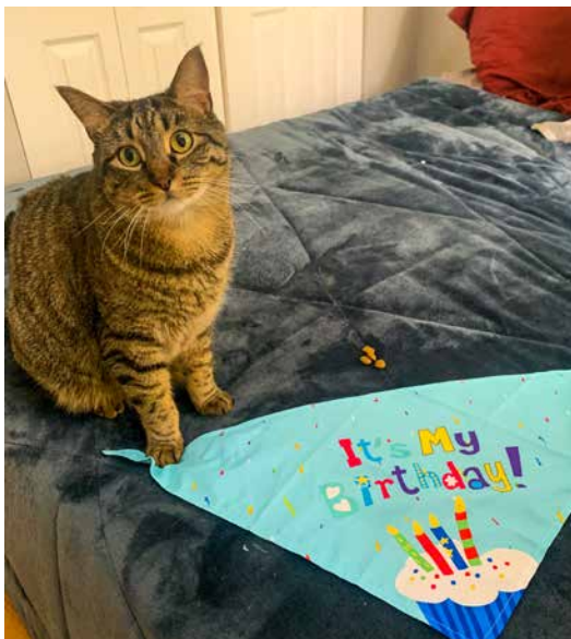
DYSON KITTY'S BIRTHDAY

All of our pets are rescues, and are up to date on their vaccines and are taken for checkups at the vet regularly. All of our pets have already shown a loving spirit towards all of the children and babies in our lives, and we think they are more excited than even we are of another family member joining our home.