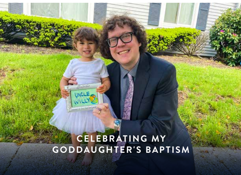
CELEBRATING MY GODDAUGHTER'S BAPTISM