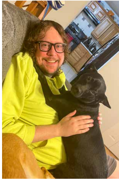
OUR DOGS LOVE TO CUDDLE