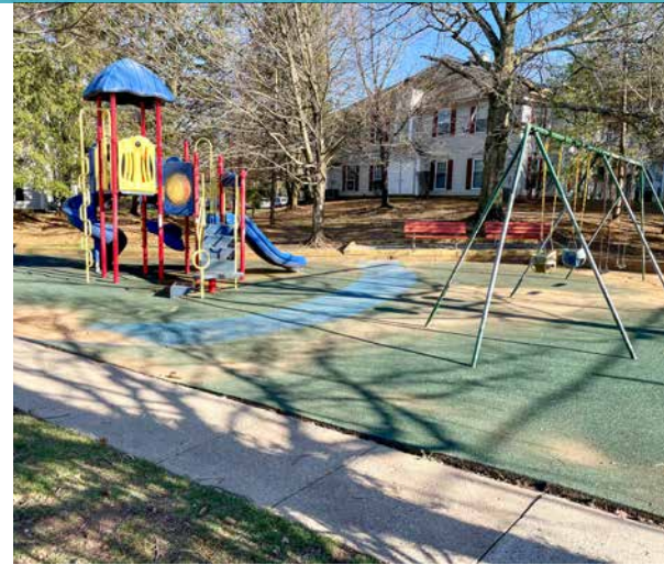
THE PLAYGROUND WITHIN WALKING DISTANCE

There is a lovely playground, tennis courts, and a pool with a lifeguard on duty that also includes a kiddie pool. We have plenty of room for a baby and we are in the process of painting what will be the baby's room. Living in central New Jersey allows us to have access to many parks, hiking trails, and beautiful beach destinations. There is a reason New Jersey is called the garden state, it has a lovely temperate climate with warm summers and beautiful winters. Franklin Township is a diverse area with a fantastic public school system.