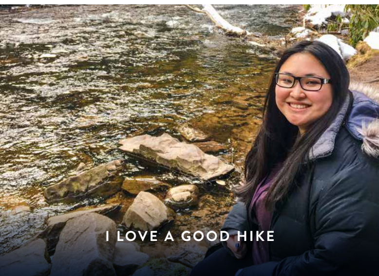
I LOVE A GOOD HIKE