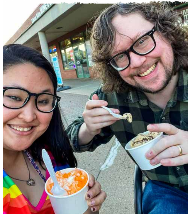
GETTING AN ICE CREAM TREAT

SUMMER TIMES will mean day trips to the Jersey shore, which won't be complete without an ice cream cone!