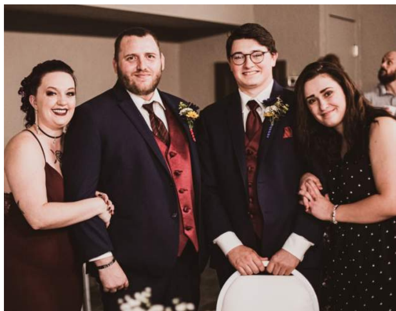
Frends at our wedding