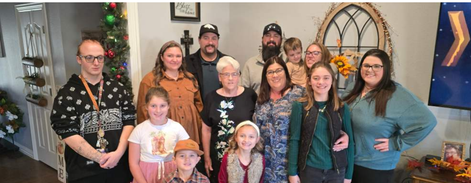
Thanksgiving Family Time