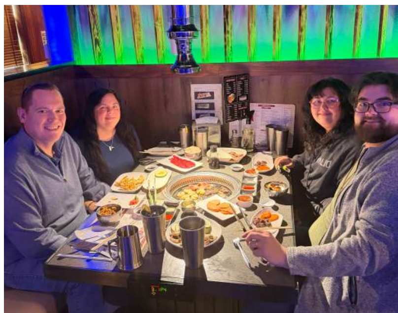
Friends at dinner