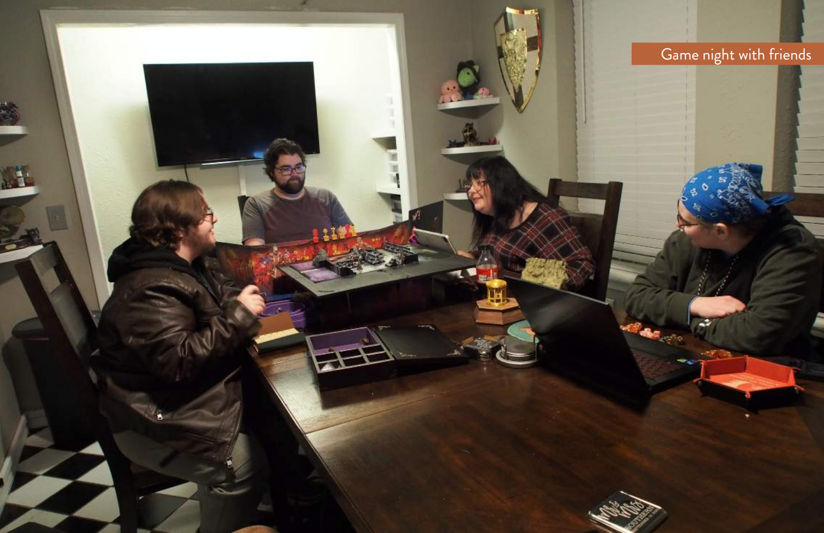
Game night with friends