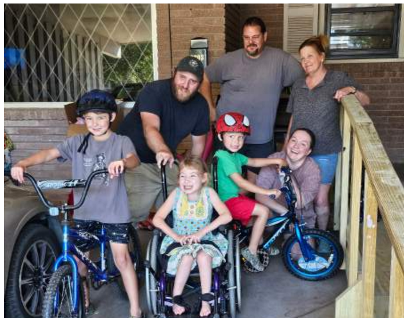
Long time friends with their adopted children