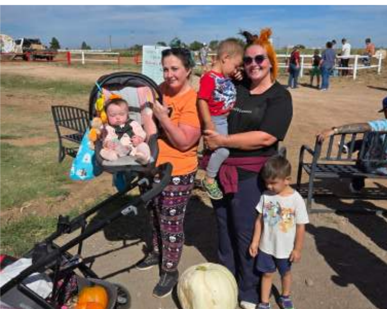
Family Friends at 'Gee's Family Farm'