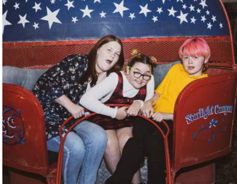
Nieces & nephews at the fair