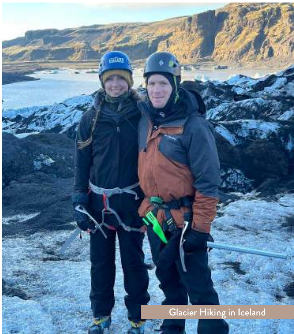
Glacier Hiking in Iceland