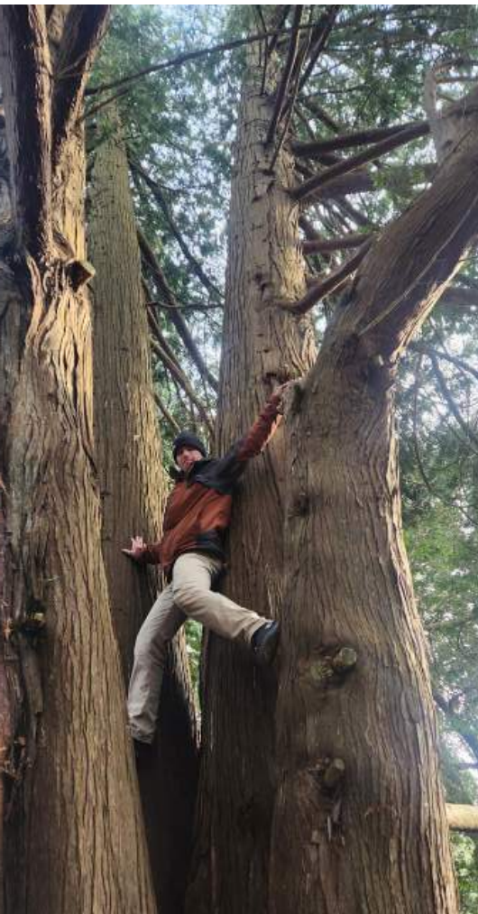
Ireland Tree Climbing