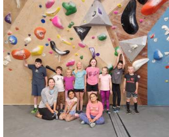
Youth Summer Camp