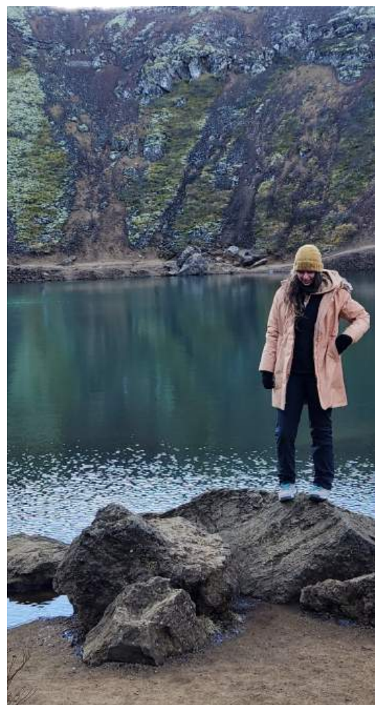
Crater in Iceland

When we aren't busy at work or on a trip we are definitely homebodies. This is where we workout, hang out with our dog, and take time to relax. We are competitive and like to beat each other at board games and chess. We are working towards moving into a different house that we are currently fixing up, so house projects also take our time.