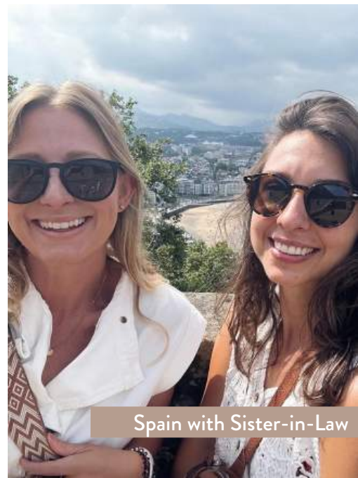
Spain with Sister-in-Law

Our family is rooted in faith, love, and gratitude. We strive to follow Jesus Christ in our daily lives, letting His example guide how we treat others—with kindness, respect, and compassion. Family is at the heart of everything we do, and we believe in supporting one another through every season of life. We feel deeply blessed for the place we call home and the opportunities it provides, and we believe in working hard to achieve our goals while appreciating the journey along the way. We also value caring for the bodies and lives we've been given by staying active, eating well, and making healthy choices. We aim to create a home filled with encouragement, integrity, and love, where everyone feels valued and supported.