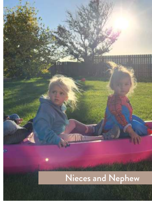
Nieces and Nephew