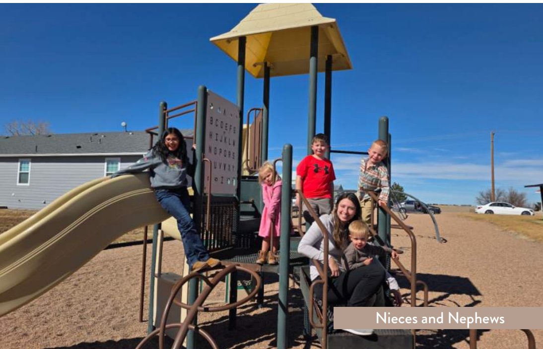
Nieces and Nephews