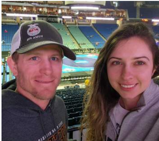
NCAA Wrestling Finals