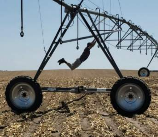
At the Field