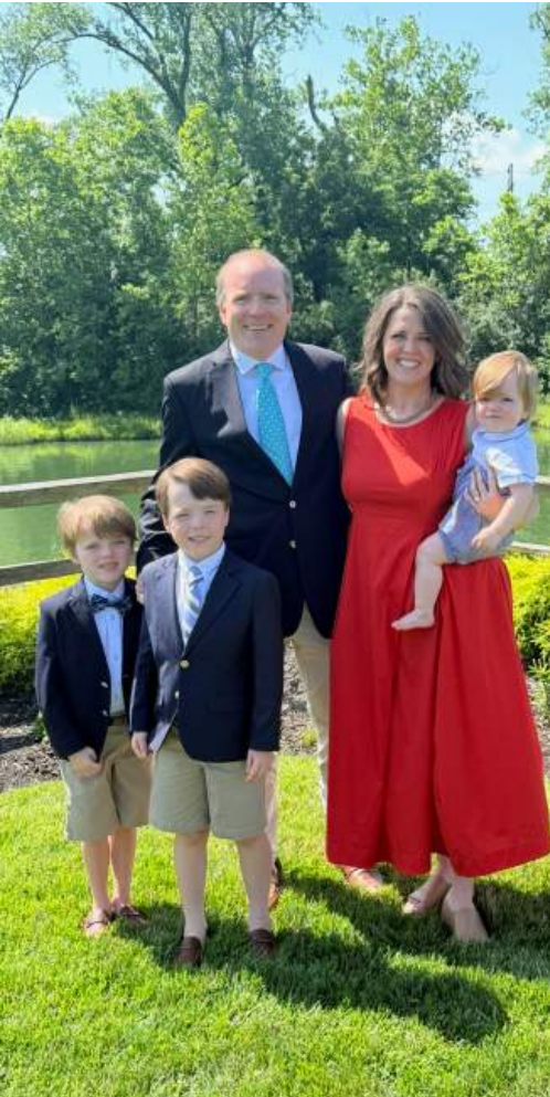
At Lane's cousins wedding