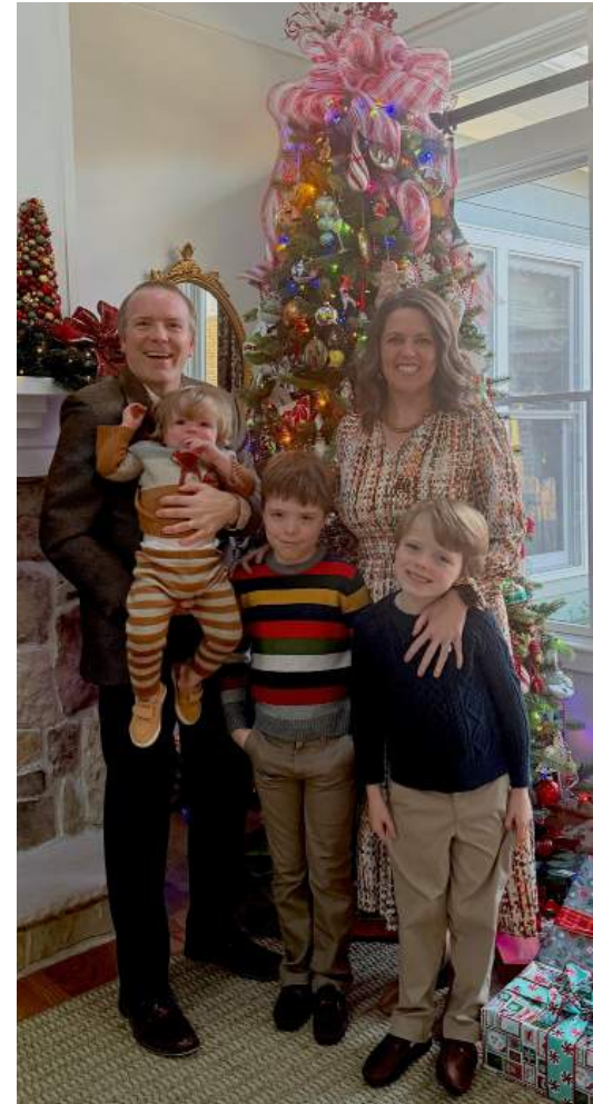
Before Thanksgiving dinner