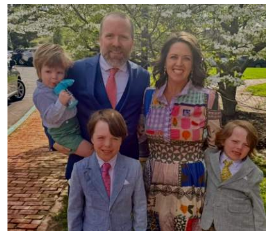
Easter Sunday at Church