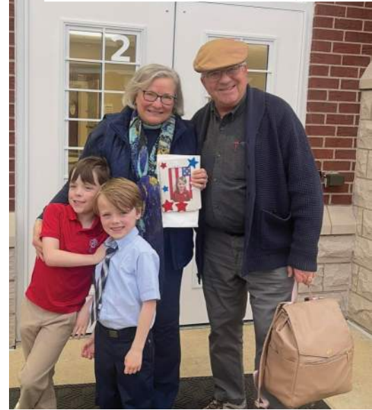
Lane's parents with the big boys