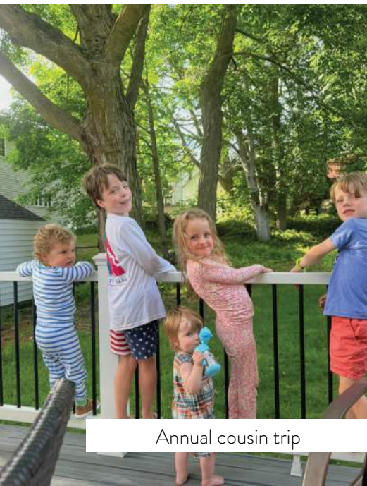
Annual cousin trip