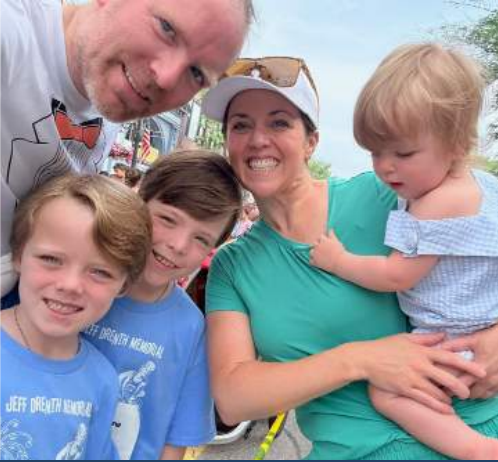
Annual family mile race