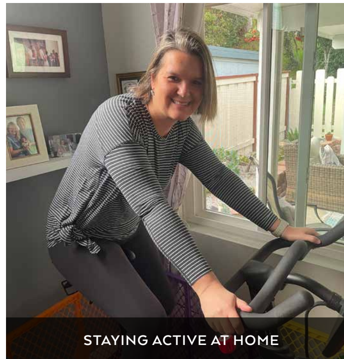
STAYING ACTIVE AT HOME