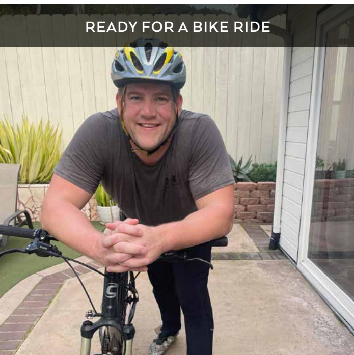
READY FOR A BIKE RIDE