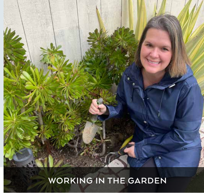
WORKING IN THE GARDEN