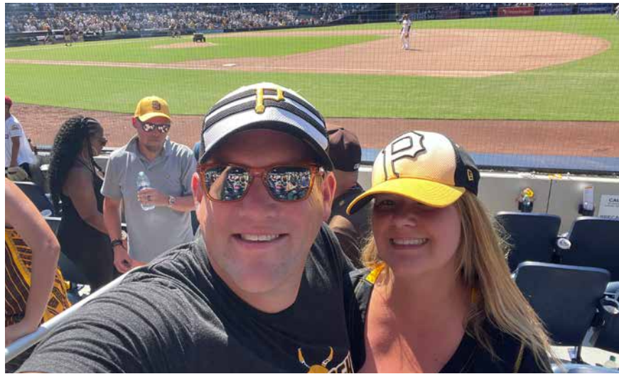
CHEERING ON THE PIRATES AT A BASEBALL GAME