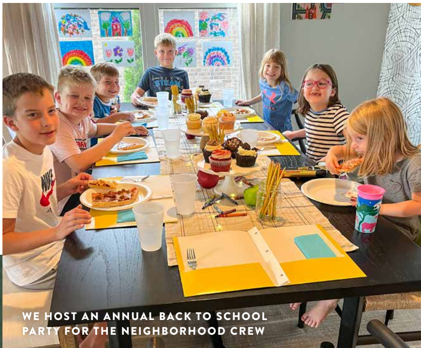
WE HOST AN ANNUAL BACK TO SCHOOL PARTY FOR THE NEIGHBORHOOD CREW

WE ARE THE HOUSE EVERYONE IS AT, BETWEEN THE TRAMPOLINE, LARGE PLAYSET AND NEVER-ENDING SNACKS, THEY ARE OUTSIDE FOR HOURS.