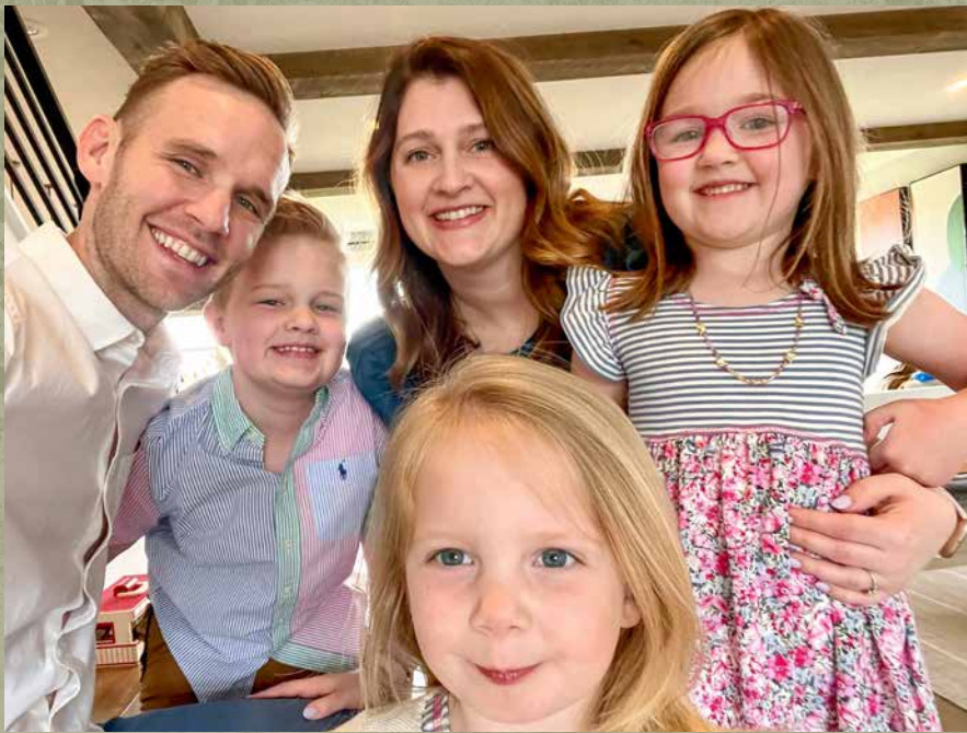
HEADING TO CHURCH ON EASTER