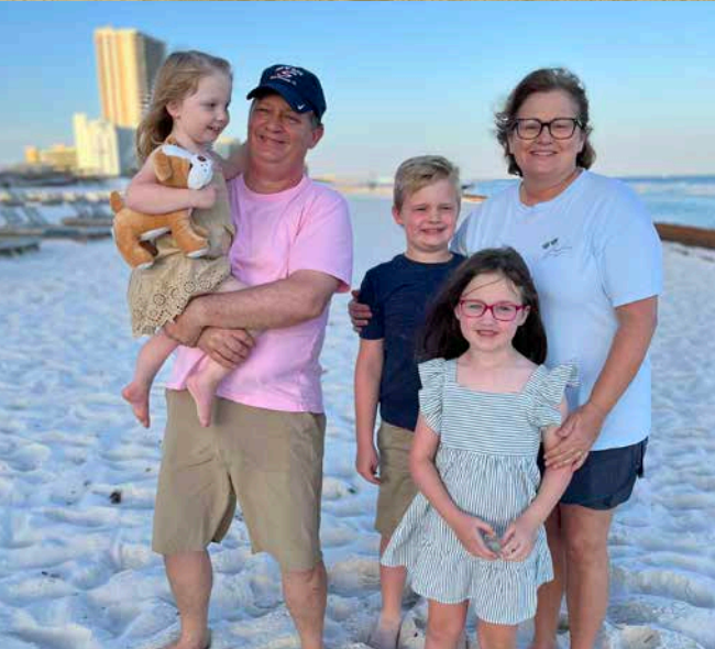
NANA AND PAPA ENJOYING THE BEACH WITH THE GRANDKIDS