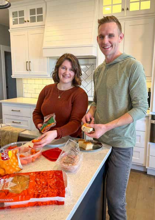
MAKING LUNCH FOR THE KIDS