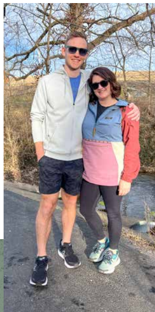
HIKING AND EXPLORING NEW TRAILS

YOU CAN OFTEN FIND US SPENDING TIME WITH EXTENDED FAMILY, EXPLORING THE OUTDOORS, TAKING ADVANTAGE OF LOCAL ATTRACTIONS OR TRAVELING TO NEW PLACES.