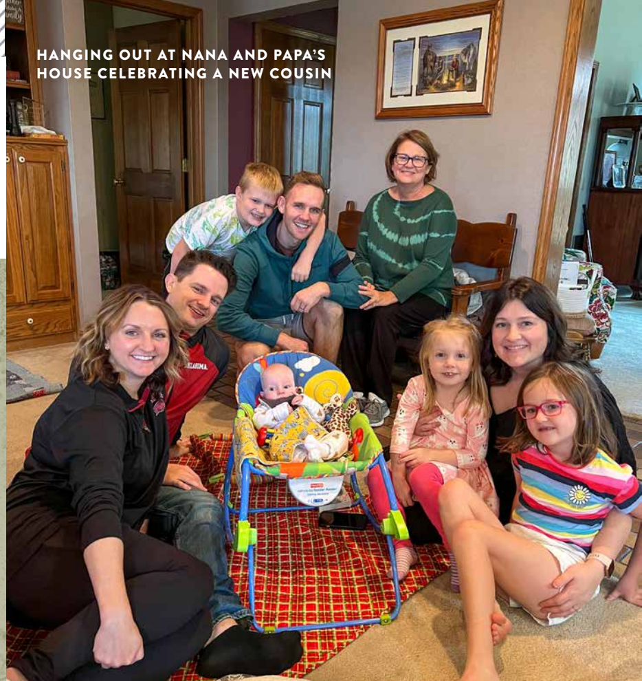
HANGING OUT AT NANA AND PAPA'S HOUSE CELEBRATING A NEW COUSIN