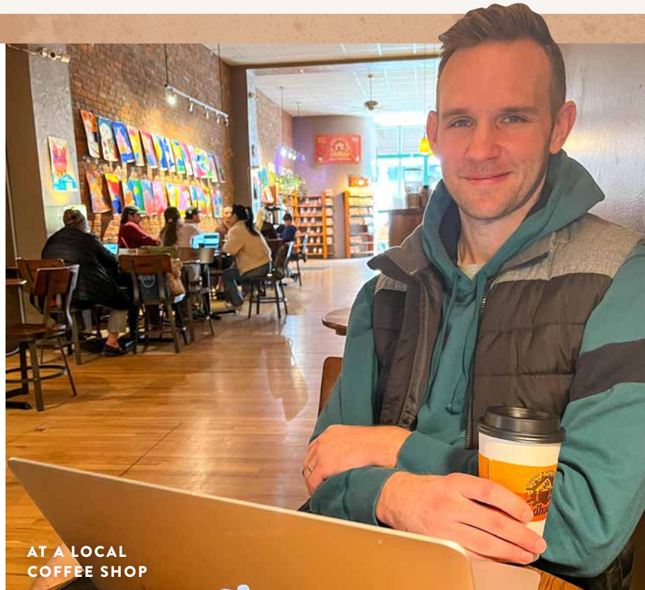
AT A LOCAL COFFEE SHOP