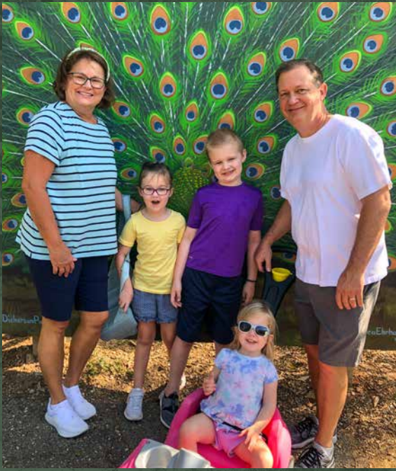
TRIP TO THE LOCAL ZOO WITH NANA AND PAPA