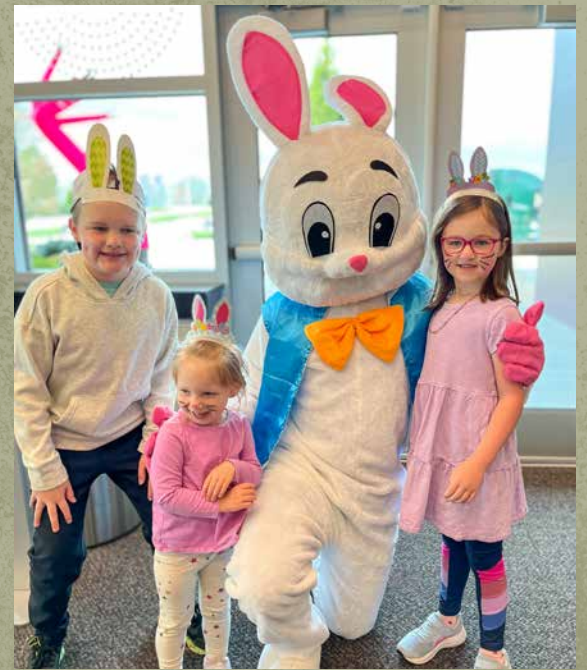
EASTER CELEBRATION AT CHURCH