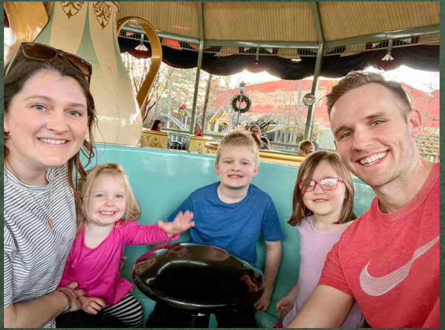
WE HAVE SEASON PASSES TO A LOCAL AMUESMENT PARK, SILVER DOLLAR CITY