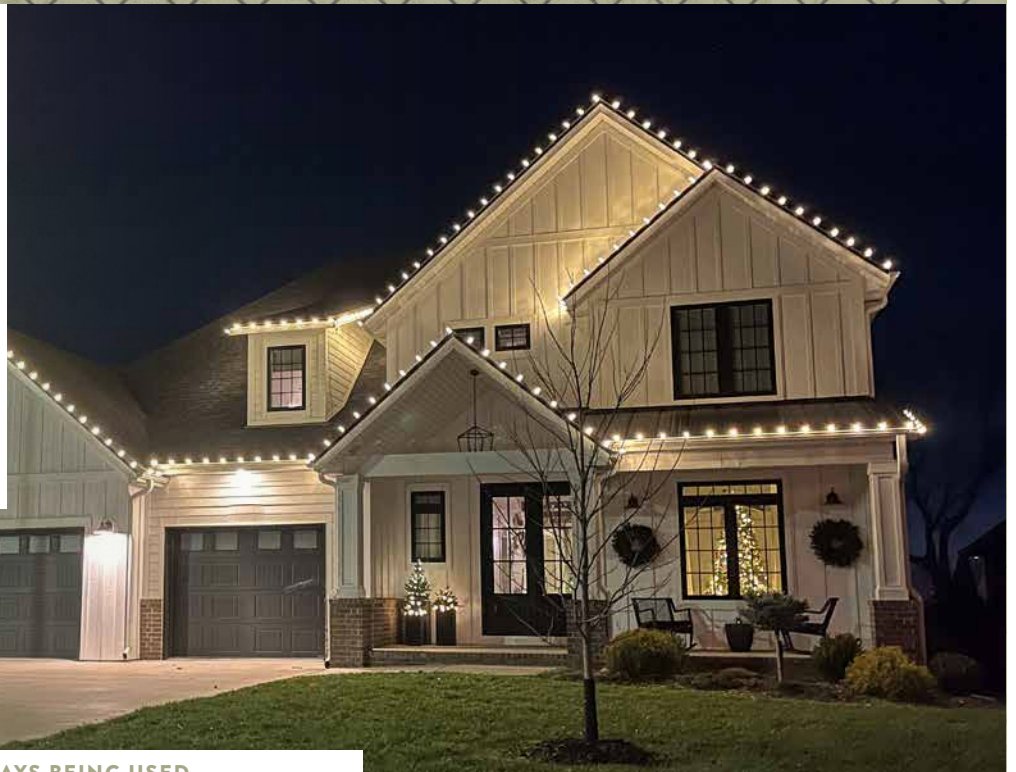
OUR BACKYARD PLAYSET IS ALWAYS BEING USED

WE LIVE IN A SIX-BEDROOM HOME WITH A LARGE YARD IN A FAMILY-FRIENDLY NEIGHBORHOOD.