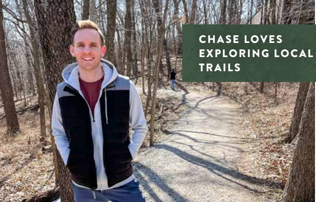
CHASE LOVES EXPLORING LOCAL TRAILS