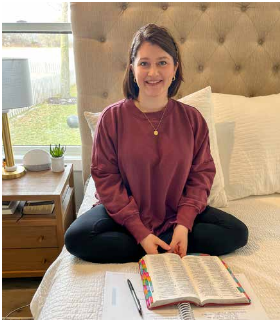
AFTER MEG DROPS THE KIDS AT SCHOOL SHE TAKES TIME TO READ HER BIBLE