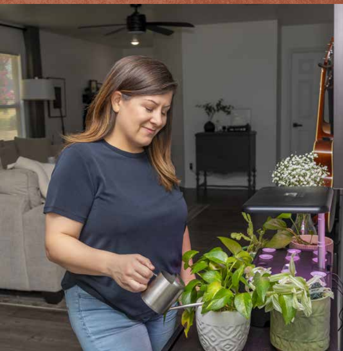
We recently started growing herbs