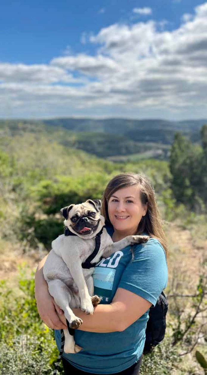
Mojo loves hiking with us