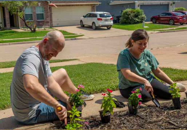
Doing yard work together