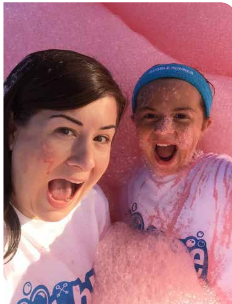
Bubble run with our niece