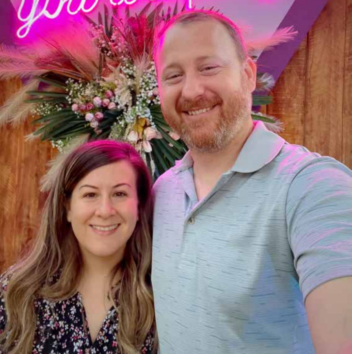
At a movie in the park date

Adopting your child would be an incredible honor for us. We look forward to the memories, laughter, and even the challenges of parenting, believing firmly that every moment would enrich our lives. Our promise is to surround our child with love, support, and encouragement, helping them grow into their best self in a stable and joyful home. Thank you for considering us and learning more about who we are. We are immensely grateful for your consideration and hopeful for the opportunity to share more of our lives with you.