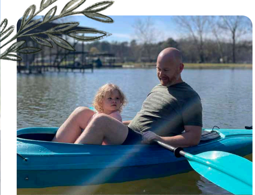
Kayaking with our niece on a family vacation