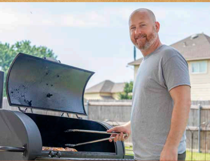
Grilling chicken thighs for the week