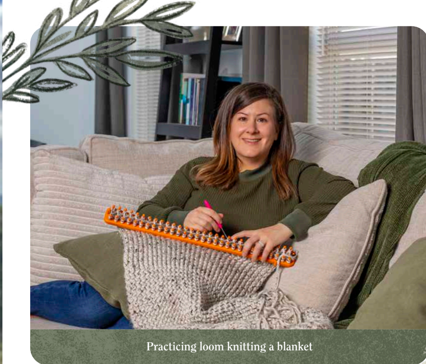
Practicing loom knitting a blanket