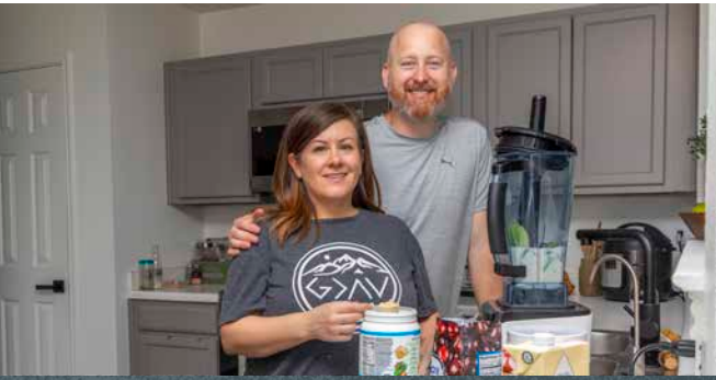
We both enjoy smoothies