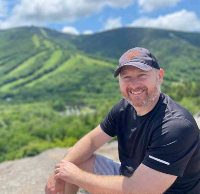
New Hampshire hike views