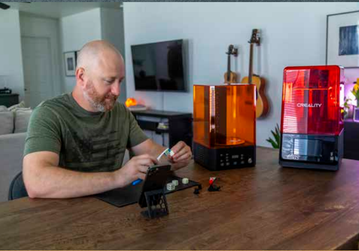
Practicing with our 3D printer