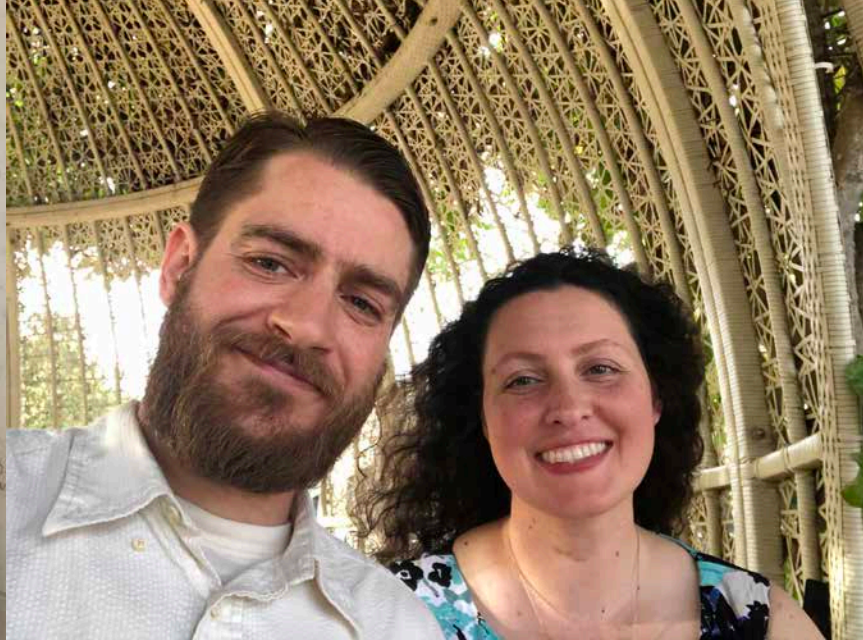
AT WILLIAM'S TWIN'S WEDDING IN MEXICO