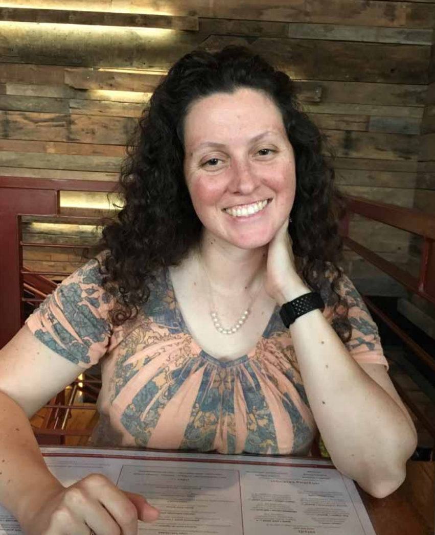
ALL SMILES AT DINNER WITH WILLIAM