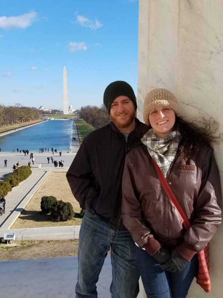
VISITING THE CAPITOL