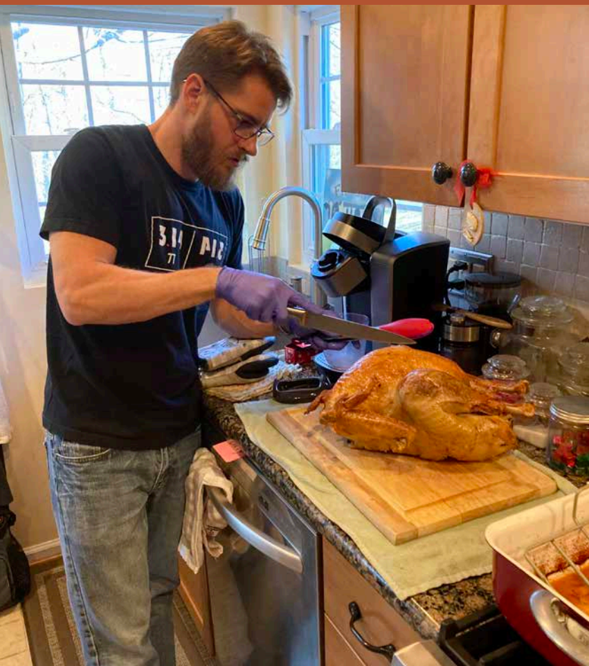
CARVING THE ROAST BEAST