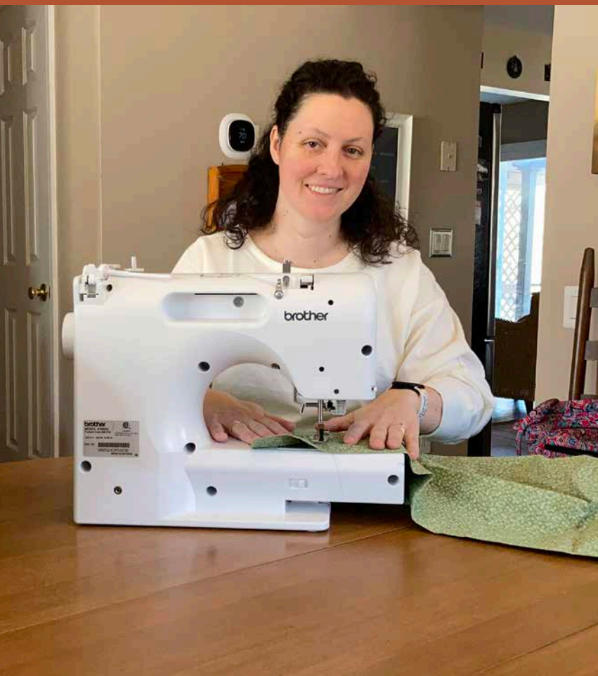
SEW MUCH FUN