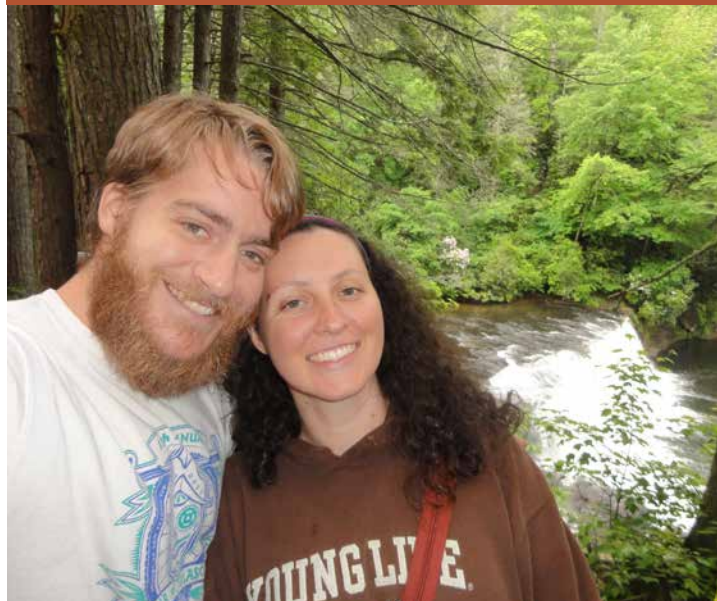
FAMILY WALKS ON THE TRAILS