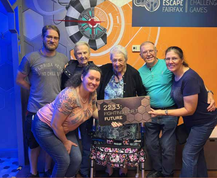
FAMILY FUN AT THE ESCAPE ROOM