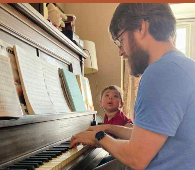
UNCLE WILL GIVING OUR NEPHEW HIS FIRST PIANO LESSON