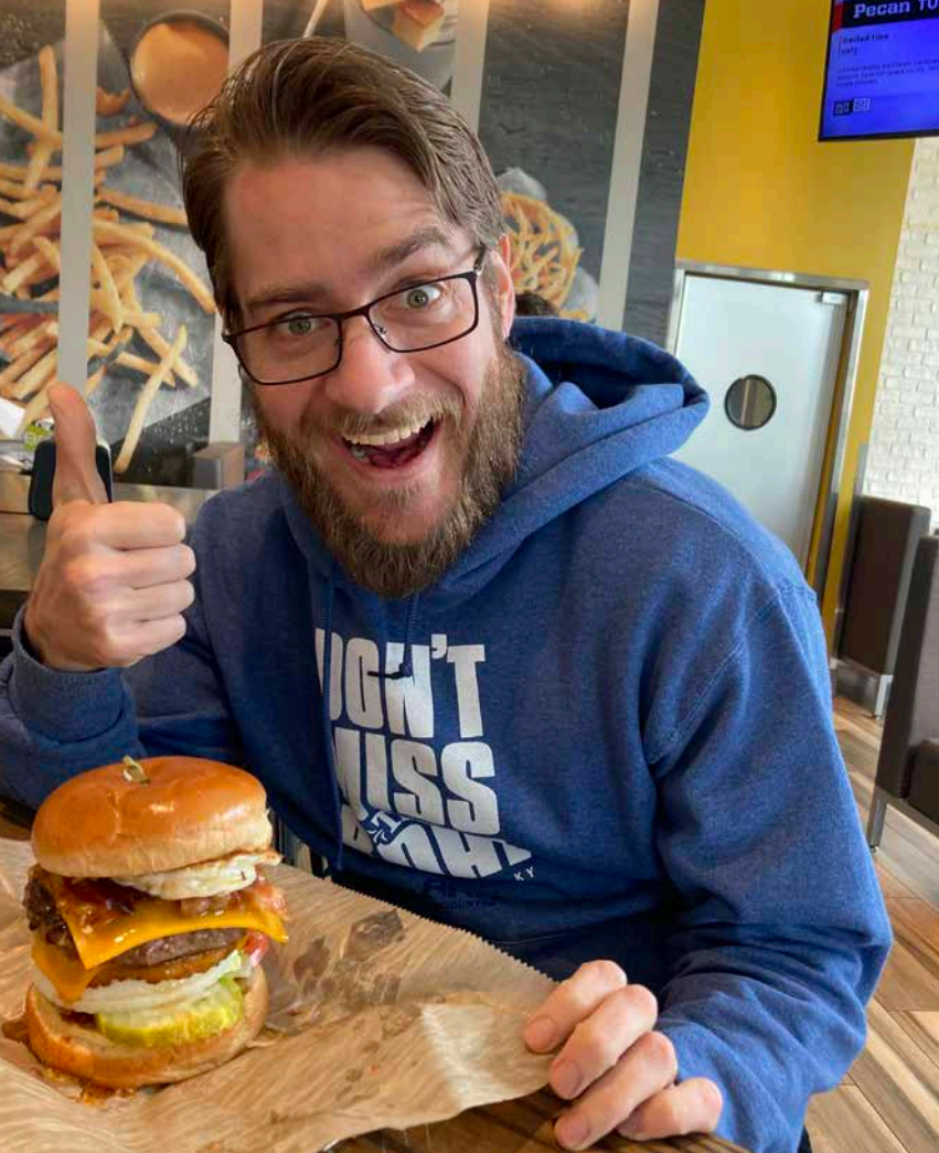
LOVE ME A GOOD BURGER