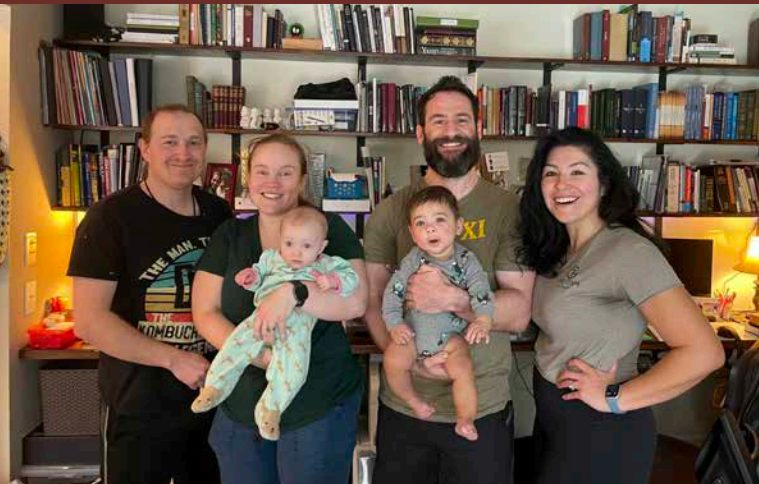
BROTHERS AND SISTERS, NIECE AND NEPHEW

Holidays have always been a time to spend with family, no matter how small the celebration. Over Easter and Thanksgiving we open our home up to members of our church who don't have family in the area, and weren't able to travel to be with theirs. We really enjoy being able to open our home and serve family and friends in this way. Decorating is also usually a big part of our holidays, and during Christmas the whole family gets involved. Setting up and decorating the Christmas tree is usually a family event and completed with a time of singing carols. Another part of the Christmas holiday is the mass production of Christmas cookies that we (mostly) give to neighbors and friends.