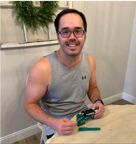
TINKERING AT HOME