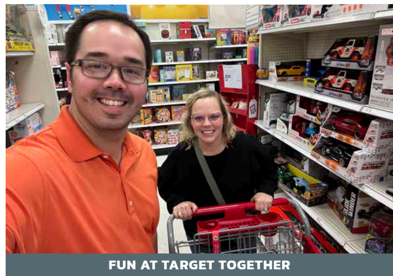
FUN AT TARGET TOGETHER