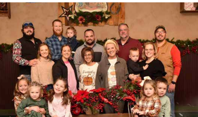
RILEY'S FAMILY ON VACATION