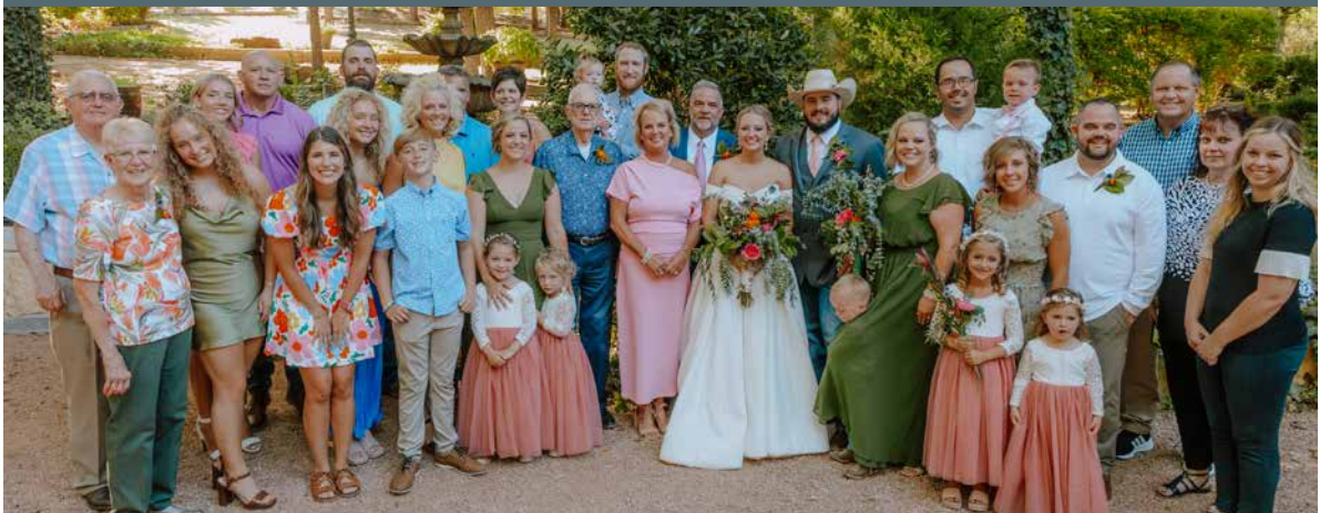
RILEY'S EXTENDED FAMILY CELEBRATING HER SISTER'S WEDDING