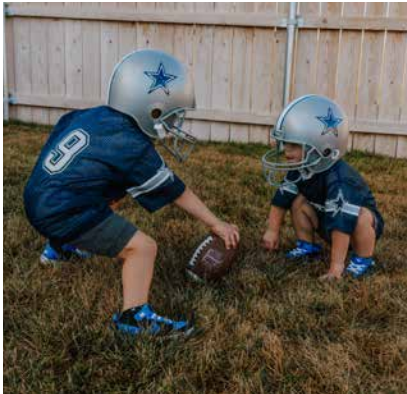
OUR DALLAS COWBOYS