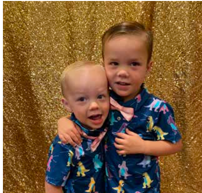
DRESSED UP TOGETHER