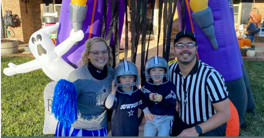
HALLOWEEN FUN AT HOME