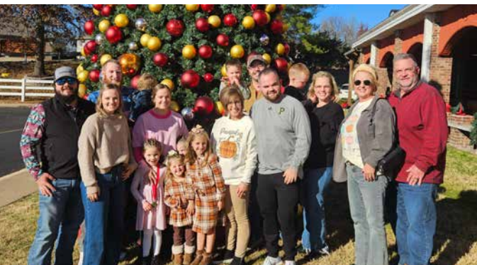
CELEBRATING THE HOLIDAYS