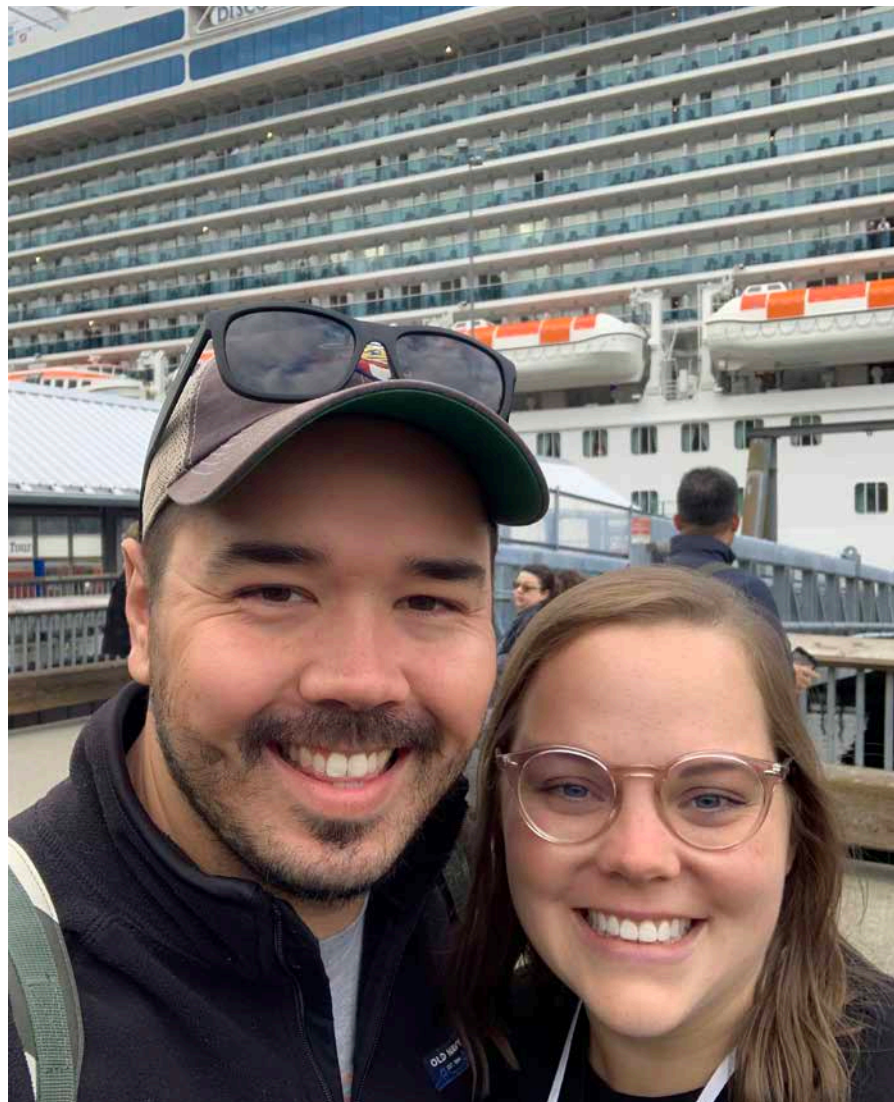
ON A CRUISE TOGETHER