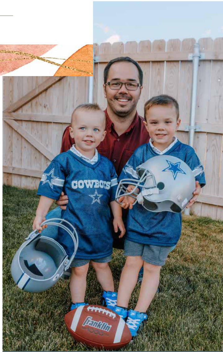
FOOTBALL FUN IN OUR BACKYARD