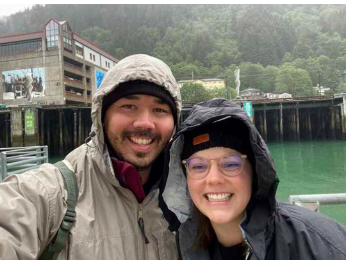
EXPLORING NEW PLACES