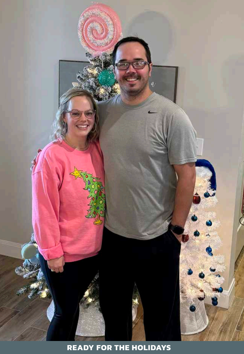
READY FOR THE HOLIDAYS