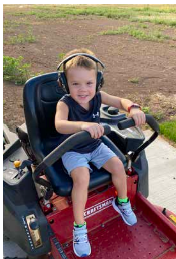
READY TO MOW