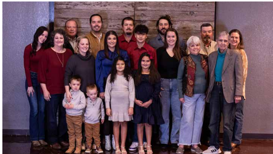
CHANCE'S FAMILY CELEBRATING THE HOLIDAYS