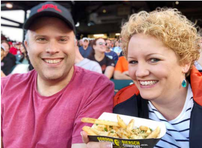
WE ARE BAY AREA SPORTS FANS AND LOVE ATTENDING GAMES OF ANY OF OUR TEAMS