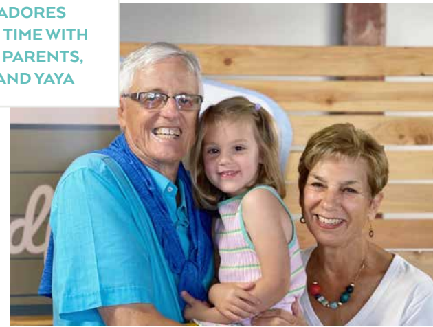
WITH JEANNA'S SISTER'S FAMILY & PARENTS