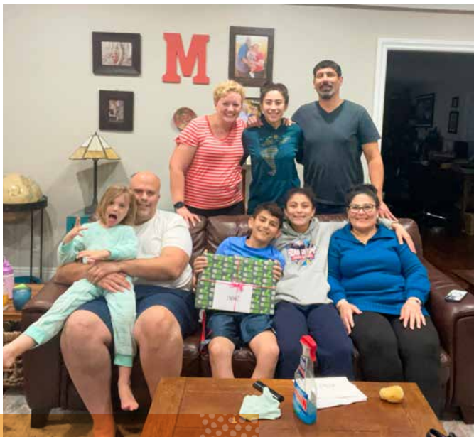
WE LOVE TO SPEND TIME WITH OUR FAMILY-FRIENDS