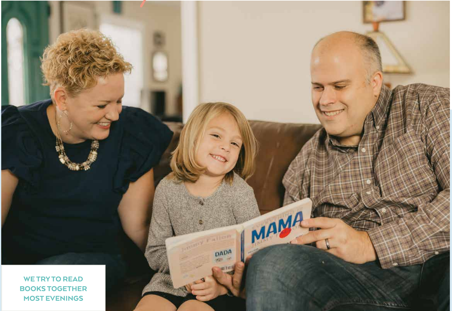
WE TRY TO READ BOOKS TOGETHER MOST EVENINGS