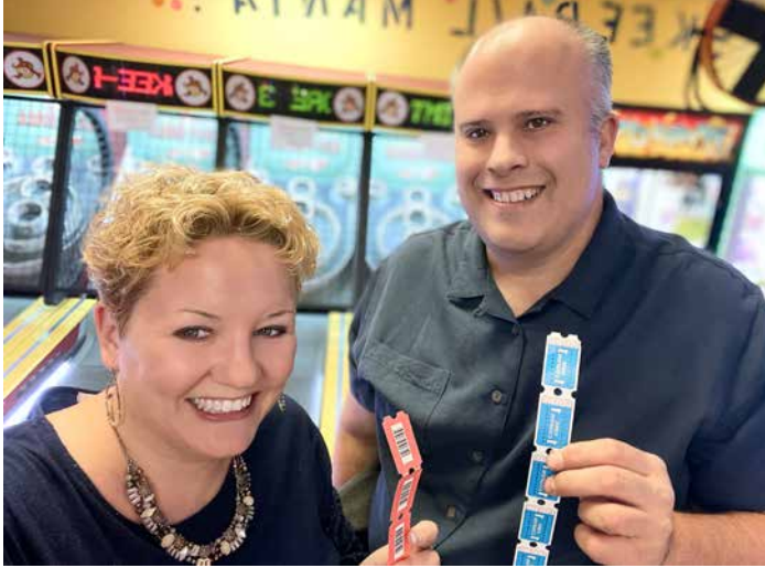
WE MAKE IT A POINT TO GO ON DATES AT LEAST TWICE A MONTH JUST THE TWO OF US TO HAVE FUN AND RECONNECT