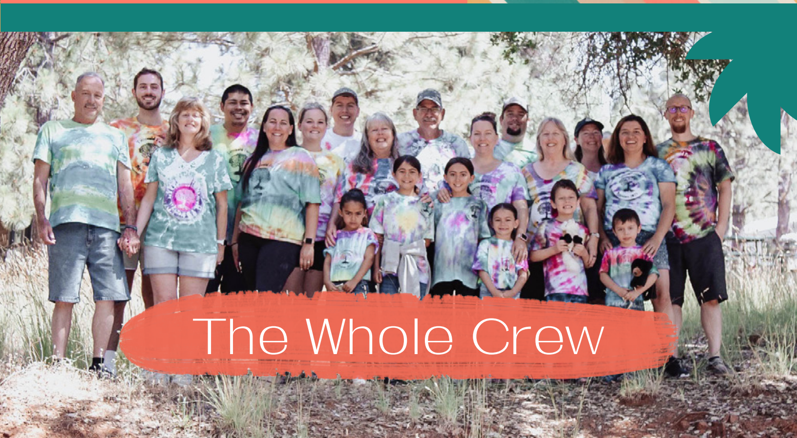
HAWAII TRIP WITH JAMIE'S FAMILY