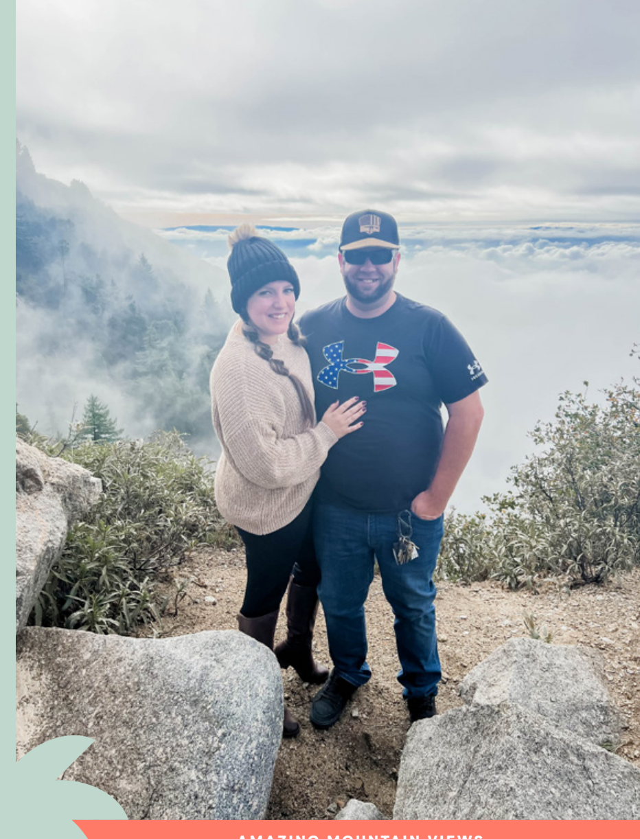
AMAZING MOUNTAIN VIEWS