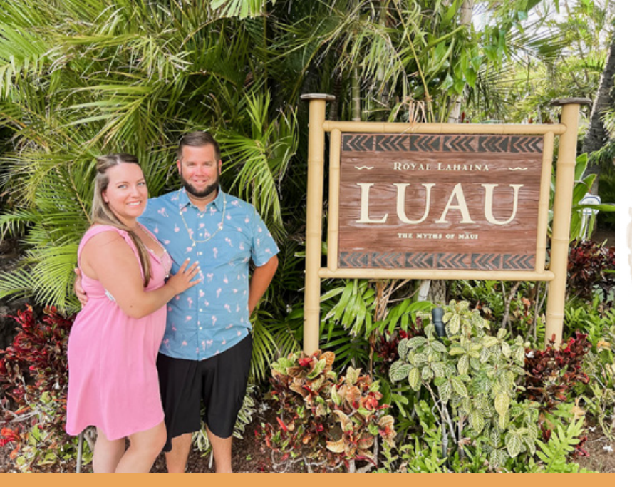
HAWAII IS MAGICAL