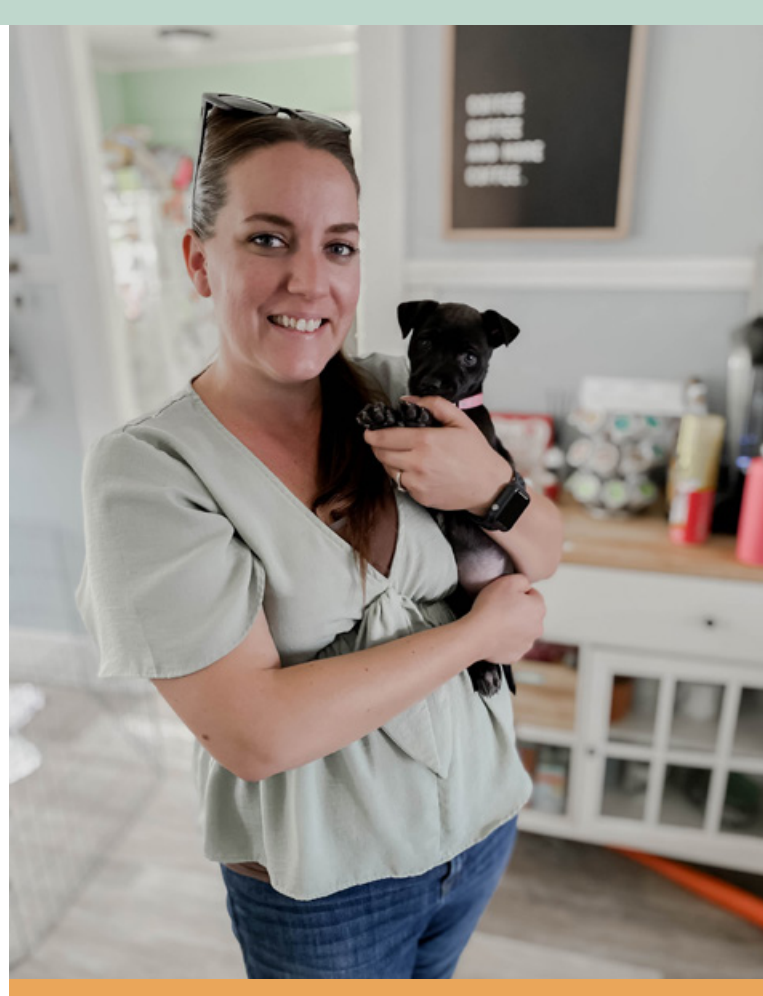
OUR DOG MELI WAS THE CUTEST PUPPY