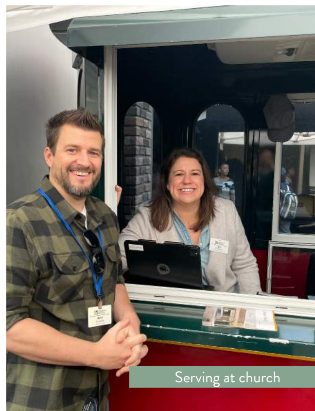
Serving at church

At night, everything shuts down by 10pm; it's a very quiet neighborhood. It's also very safe as Santa Clarita typically ranks among the safest cities, not only in California but also in America. Santa Clarita also has a huge selection of shops, restaurants and healthy grocery stores like Trader Joe's, Sprouts and Whole Foods. We've got theaters, a big selection of great schools including a well-connected community college which we both attended. We even have a theme park called Six Flags Magic Mountain. There's also a little man-made lake in our neighborhood which we take walks around and there's even a boardwalk area to feed the ducks. The lake area is so picturesque, we often see wedding parties taking pictures there, and it's even the place we got engaged.