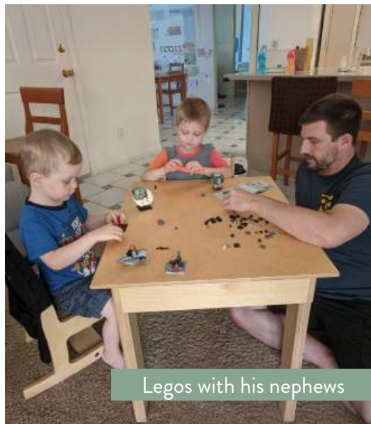
Legos with his nephews