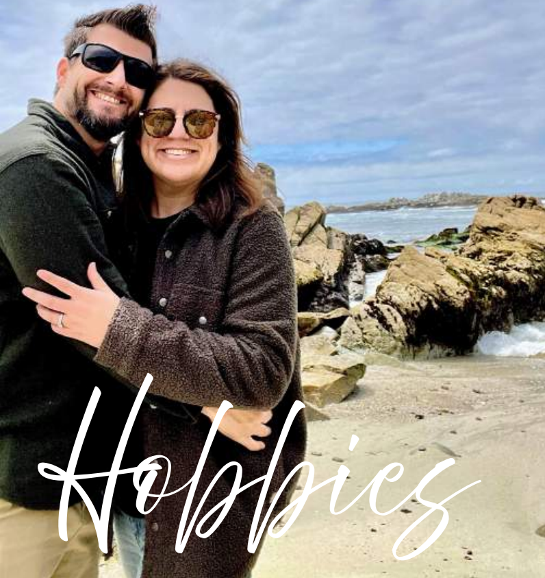
Hiking in Carmel