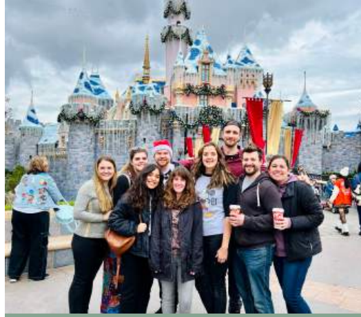
Bible Study friends at Disneyland