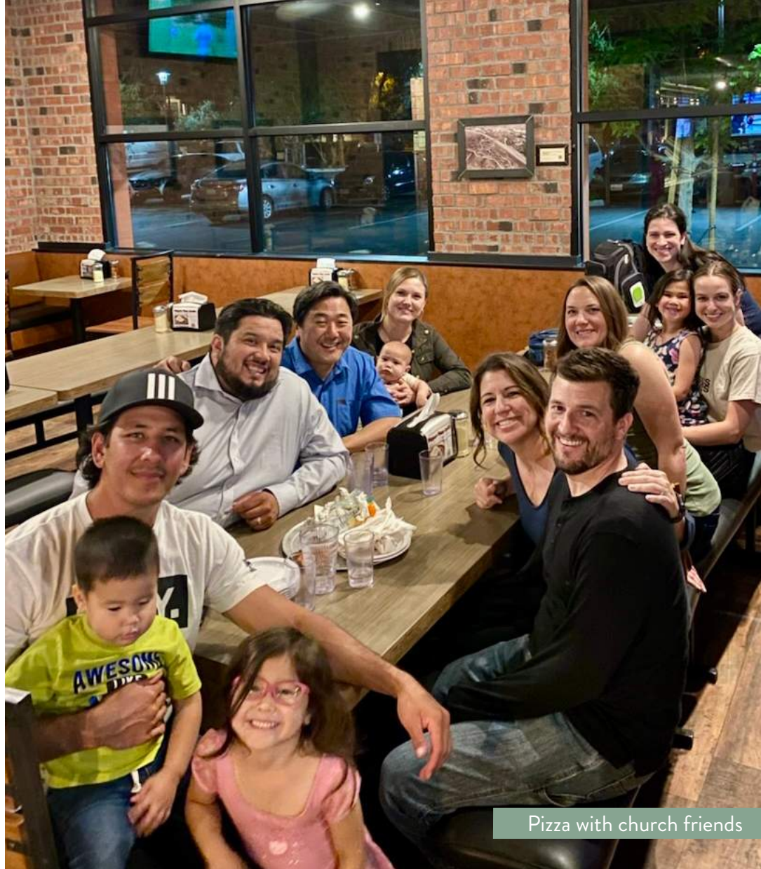
Pizza with church friends

We live in southern California, about 20-30 miles north of Los Angeles in a city called Santa Clarita. Both of us have grown up here in Santa Clarita and both of our immediate families still live here too so we see them quite often. We love our neighborhood! It has quick access to over a hundred miles of bike trails and paseos which we take advantage of, weekly. We don't have a backyard, but there's a city park with a playground, tennis courts and two soccer fields about a block away.