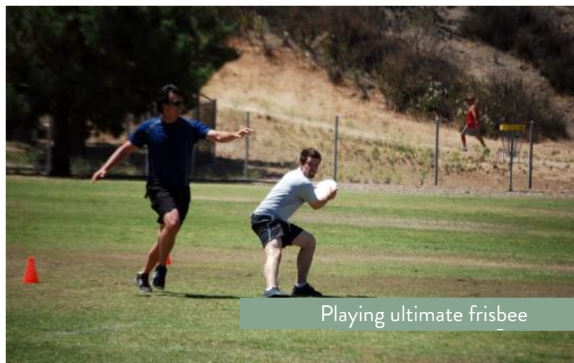
Playing ultimate frisbee