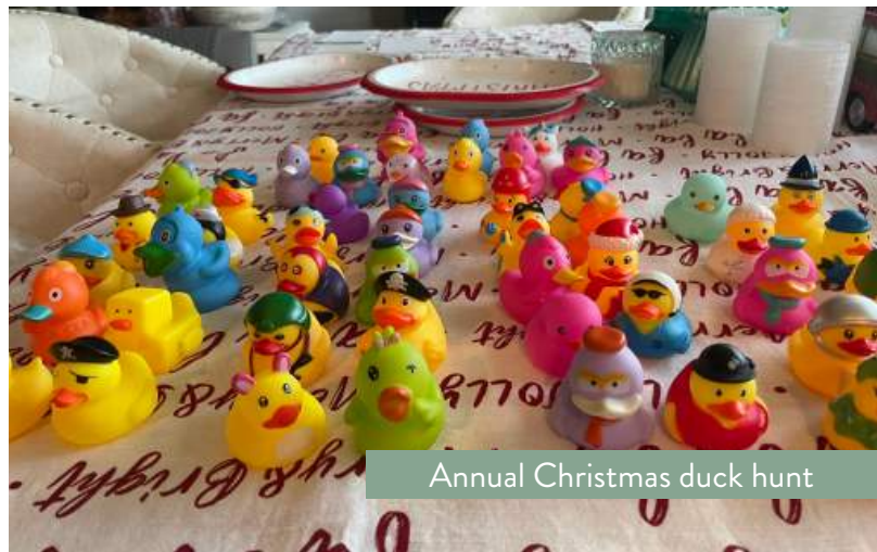
Annual Christmas duck hunt