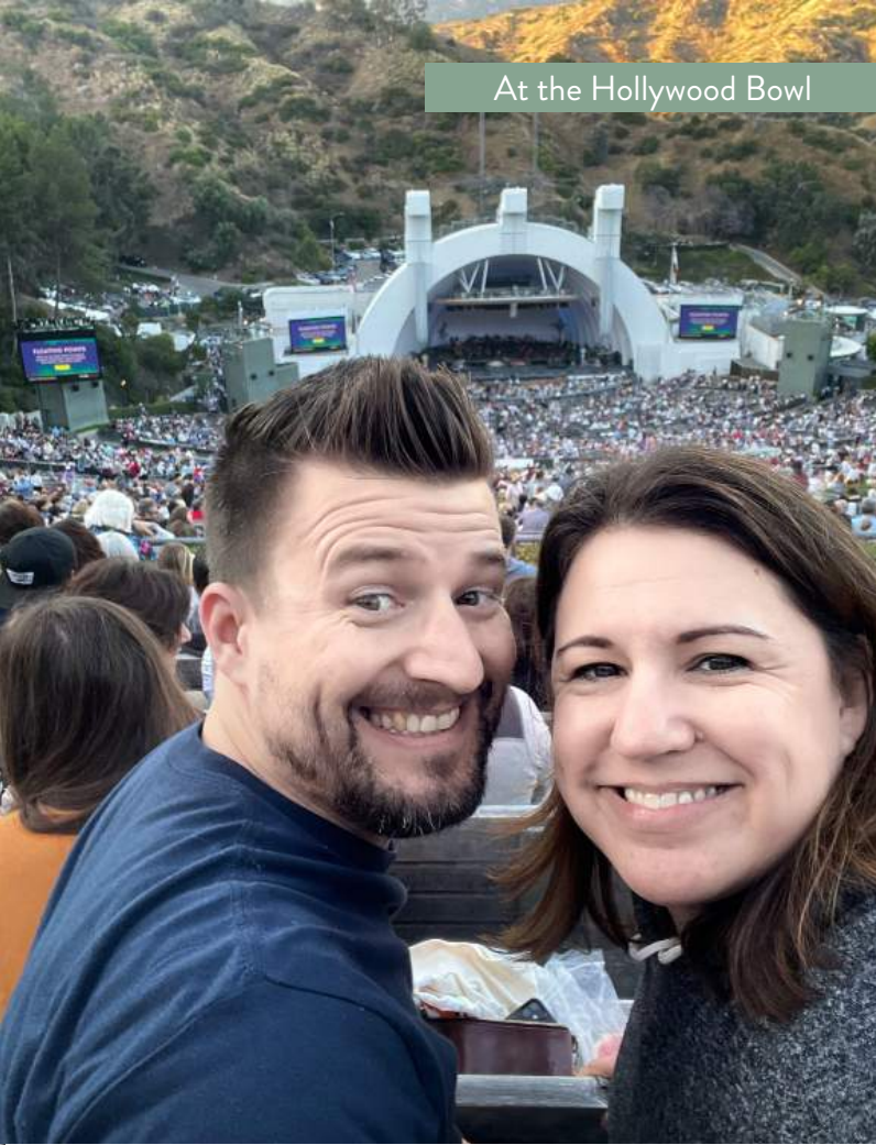
At the Hollywood Bowl