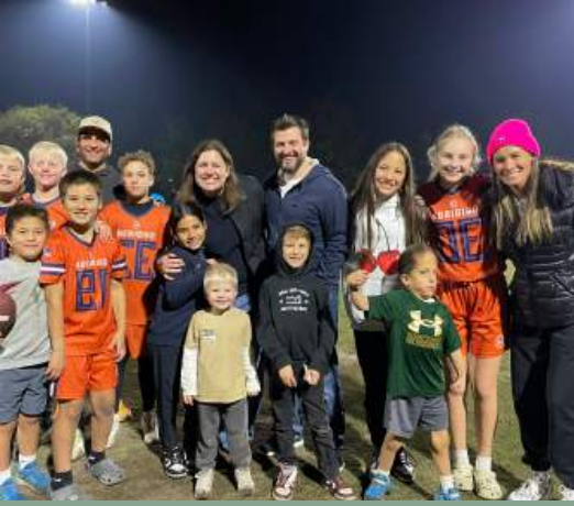
Attending our friend's kid's football game