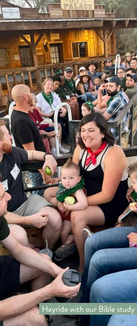
Hayride with our Bible study