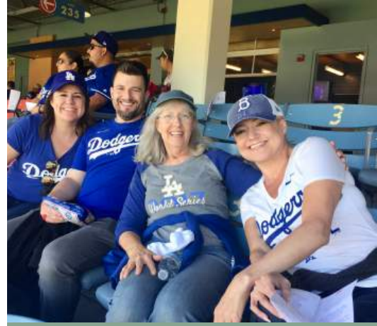
Dodger's game with famly