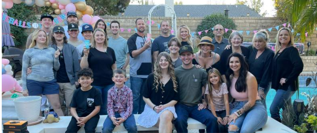
Jen's nephew's gender reveal party