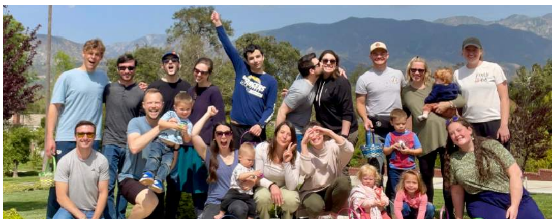
Our Bible Study Group