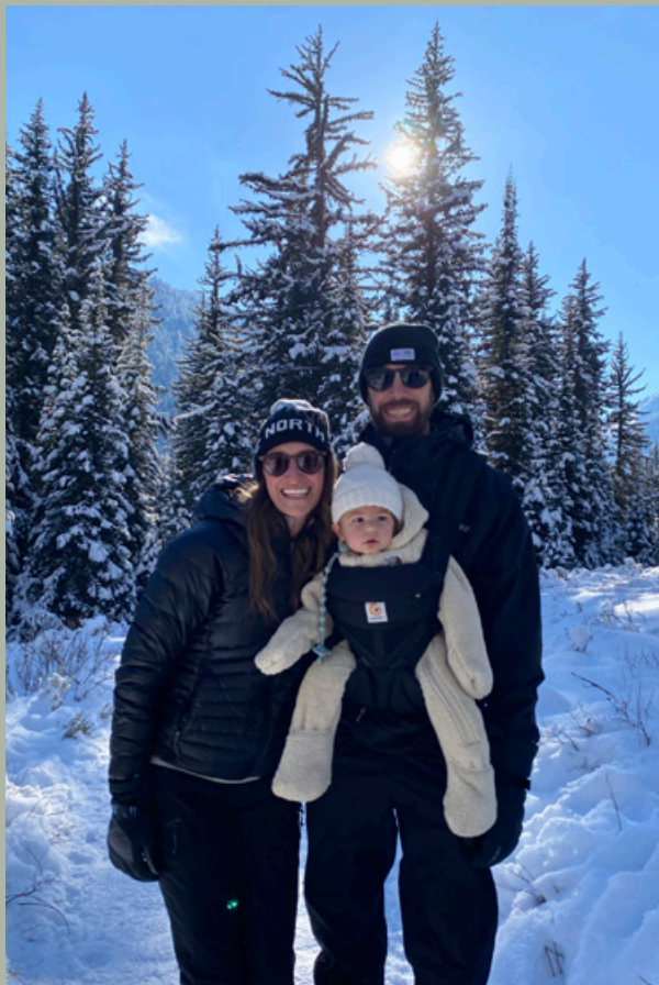
EXPLORING THE MOUNTAINS AFTER A FRESH SNOW

Our faith has carried us through various seasons of life. We feel blessed by the ways that God has loved us despite our failures and shortcomings. Because of that, we want love to be at the forefront of our lives. We desire for our children to always know that God loves them and their value and worth is not dependent on what they do or achieve in this life. When we found out we have permanent infertility, it caused us to question God's goodness, yet from the brokenness and grief, God has taught us a great deal about Himself and His plans. We know that even when we cannot see what He is doing, He is at work for our good and His glory.