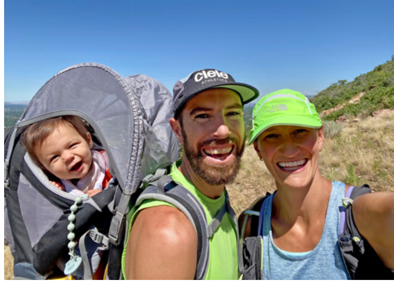
AS YOU CAN TELL WE ALL LOVE HIKING