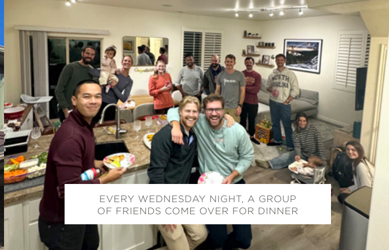
EVERY WEDNESDAY NIGHT, A GROUP OF FRIENDS COME OVER FOR DINNER