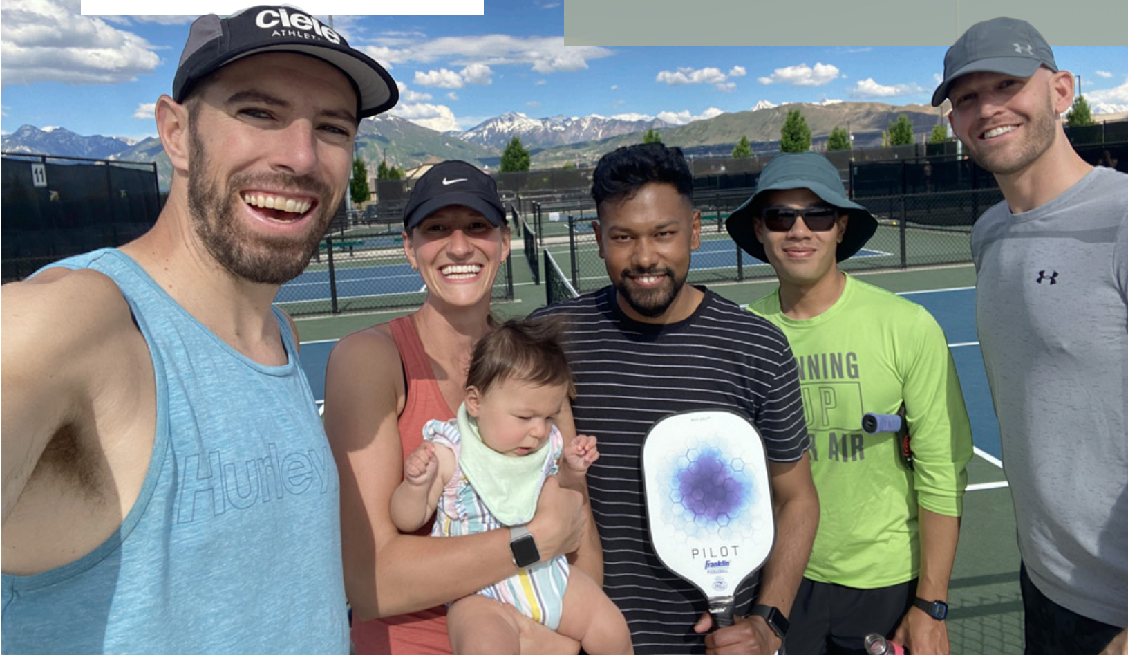
WE LOVE PLAYING PICKLEBALL WITH FRIENDS