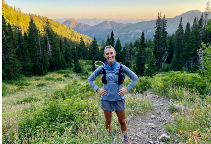
GETTING TO SEE BEAUTIFUL VIEWS MAKES EVEN THE MOST DIFFICULT HIKE WORTH IT