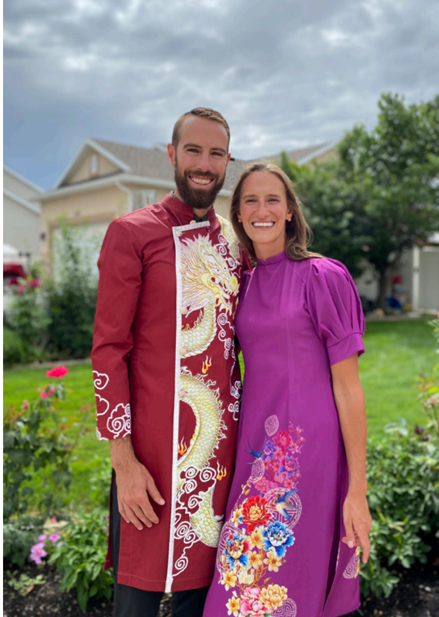
CELEBRATING OUR FRIEND'S TRADITIONAL VIETNAMESE WEDDING CEREMONY WAS SO SPECIAL