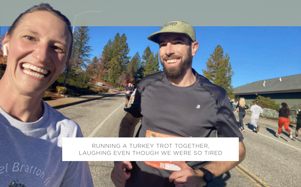
RUNNING A TURKEY TROT TOGETHER, LAUGHING EVEN THOUGH WE WERE SO TIRED