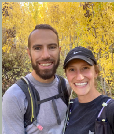
HIKING WITH THE LEAVES CHANGING COLORS