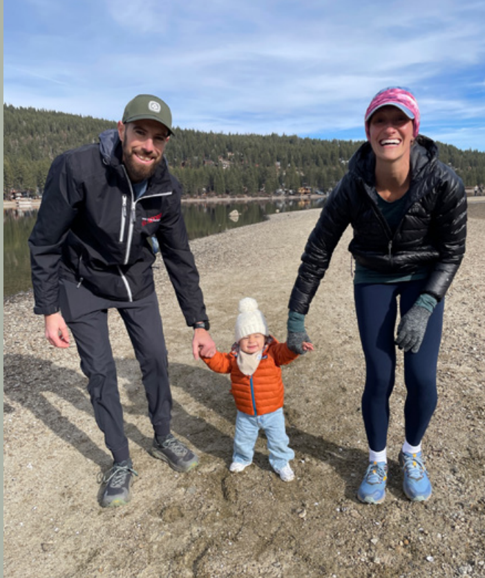
WE LOVE FAMILY ADVENTURES