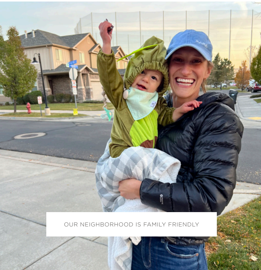
OUR NEIGHBORHOOD IS FAMILY FRIENDLY