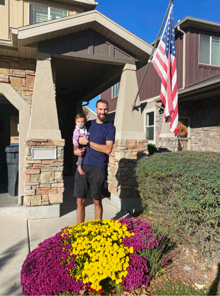
WE LOVE OUR HOME AND FEEL SO BLESSED TO HAVE A PLACE TO CALL OUR OWN