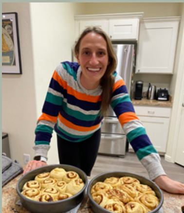
CINNAMON ROLLS ARE A HOLIDAY FAVORITE