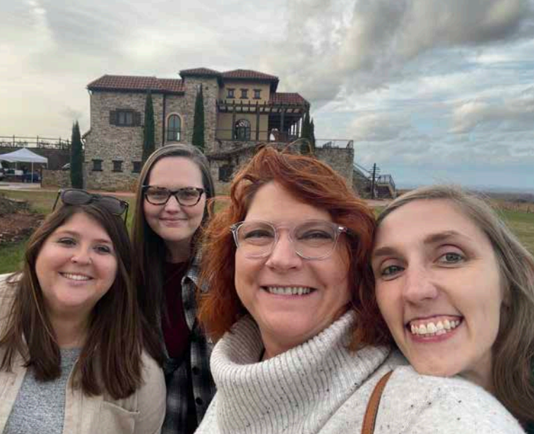
Morgan's friends are like family! We get together celebrate milestones and just enjoy being together!