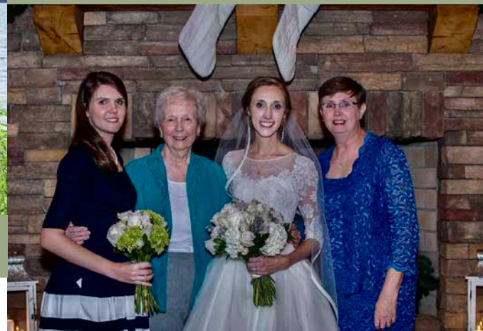
3 generations of women in Morgan's family- strong women are in her genes!