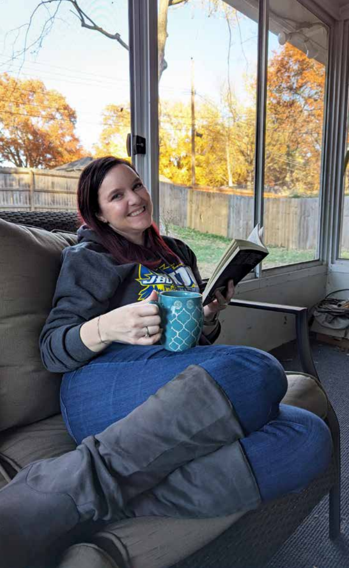
Sipping coffee and reading a good book