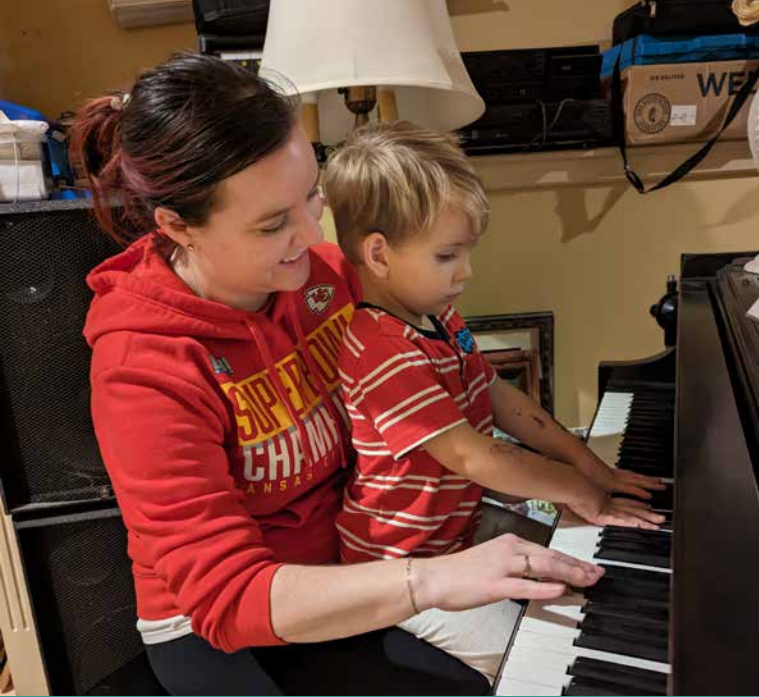
Sharing a love of music with our nephew