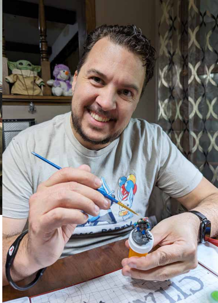
Painting a figurine for his D&D campaign

Author You Like to Read Brandon Sanderson