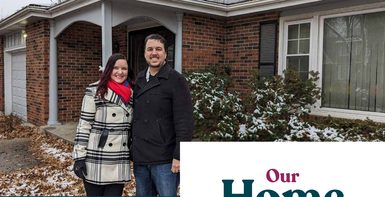
Walking in our neighborhood