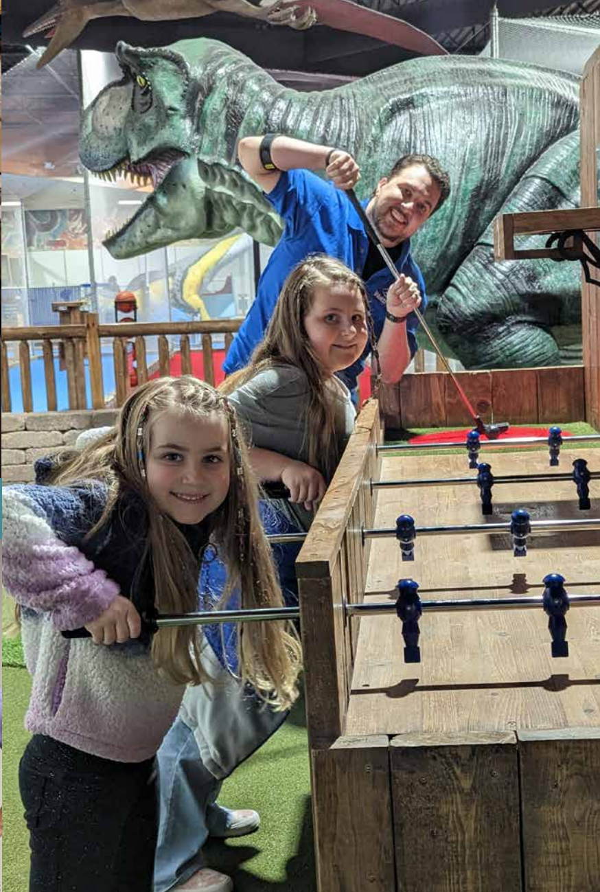
Mini-golf, dinosaurs, and making memories with our nieces