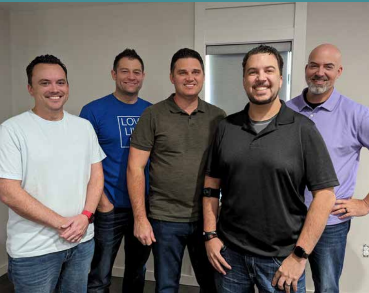
TJ has a great group of godly friends at church to have deep conversations with and get advice from.