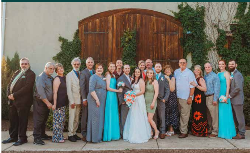
CELEBRATING A FAMILY WEDDING

Living in the moment is important to us. Many of our fondest memories come from time spent with friends and families over new experiences. We would like to impart these values on our future children.