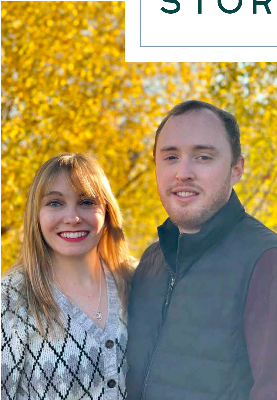
ENJOYING A BEAUTIFUL FALL DAY TOGETHER

We have been together for almost 16 years, married for 5. Our married life began in Salt Lake City, where we first became parents when we adopted our cat, Cora. Living in Salt Lake City taught us a lot about working as a team by leaning on one another for support. After 5 years together in Salt Lake, we returned to the St. Louis area. This is where we met, and we are elated to be surrounded by friends and family that inspire and motivate us every day.