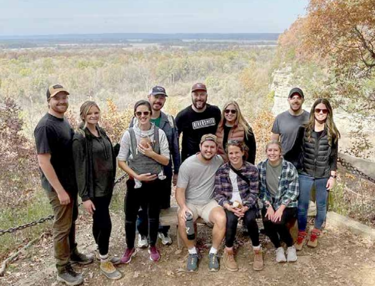
WEEKEND HIKING TRIP WITH FRIENDS