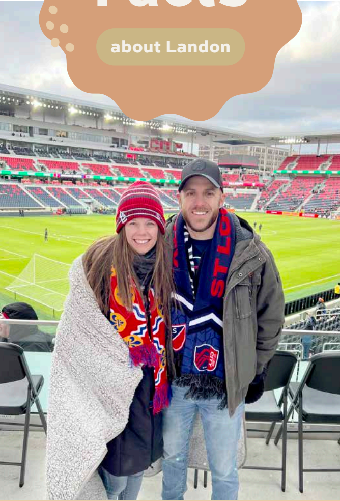
AT A ST. LOUIS CITY SOCCER GAME