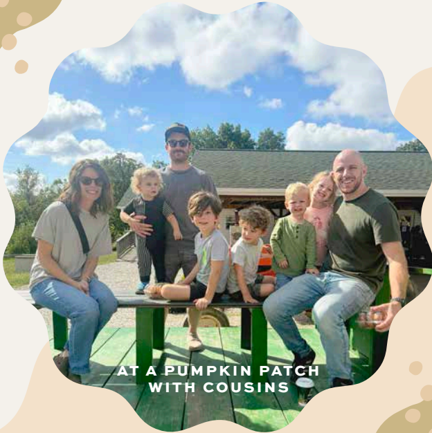
AT A PUMPKIN PATCH WITH COUSINS

We are grateful that both sets of our parents live close to us and play a big part in our kids lives.