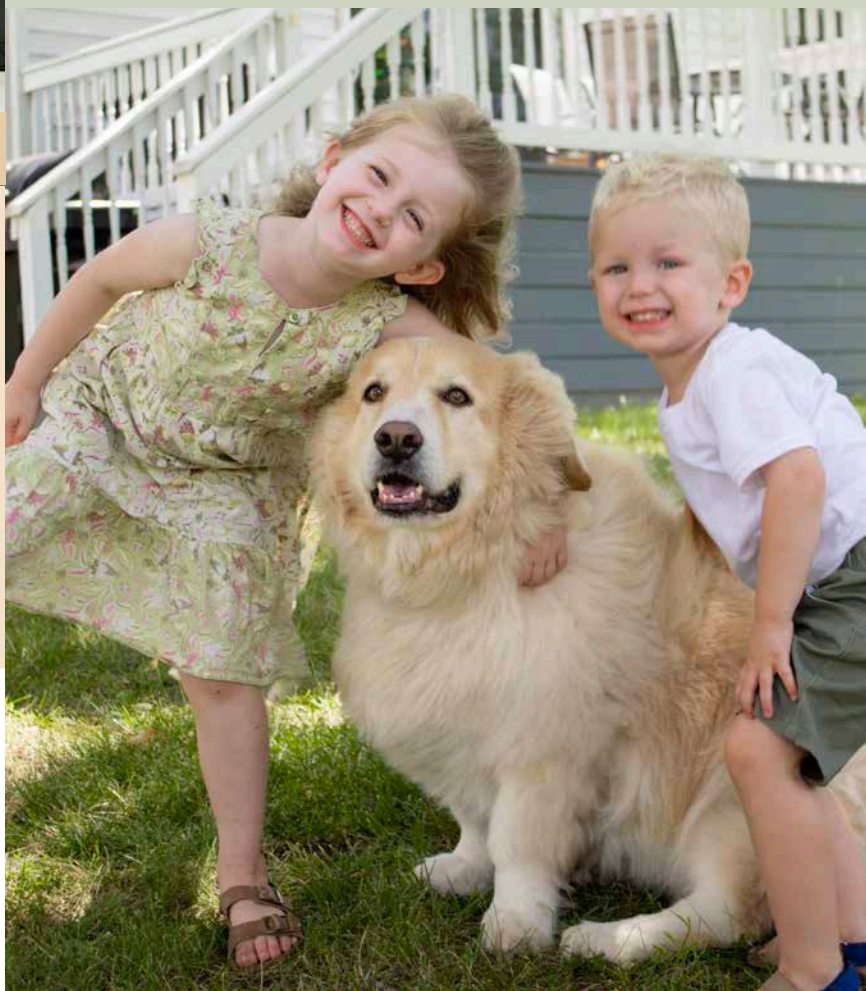
WINSTON IS VERY GENTLE AND GREAT WITH KIDS!