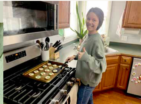
BAKING CHRISTMAS COOKIES

We lived in St. Louis for nearly ten years, so we make lots of trips back there to visit friends and family.