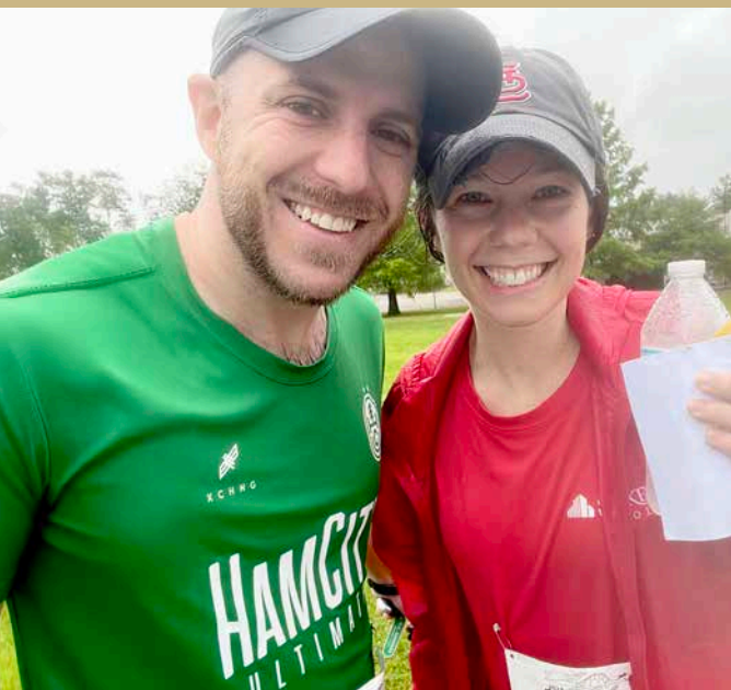
RUNNING A 5K RACE TOGETHER