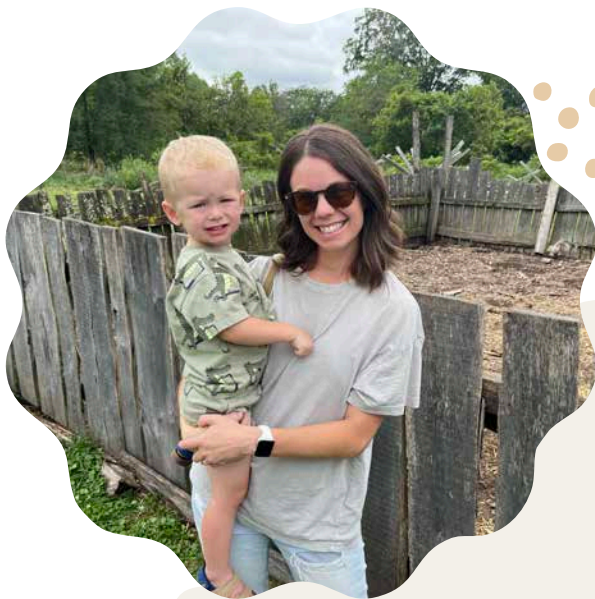
VISITING ABRAHAM LINCOLN'S NEARBY FAMILY FARM