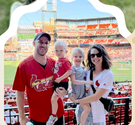
AT A ST. LOUIS CARDINALS BASEBALL GAME