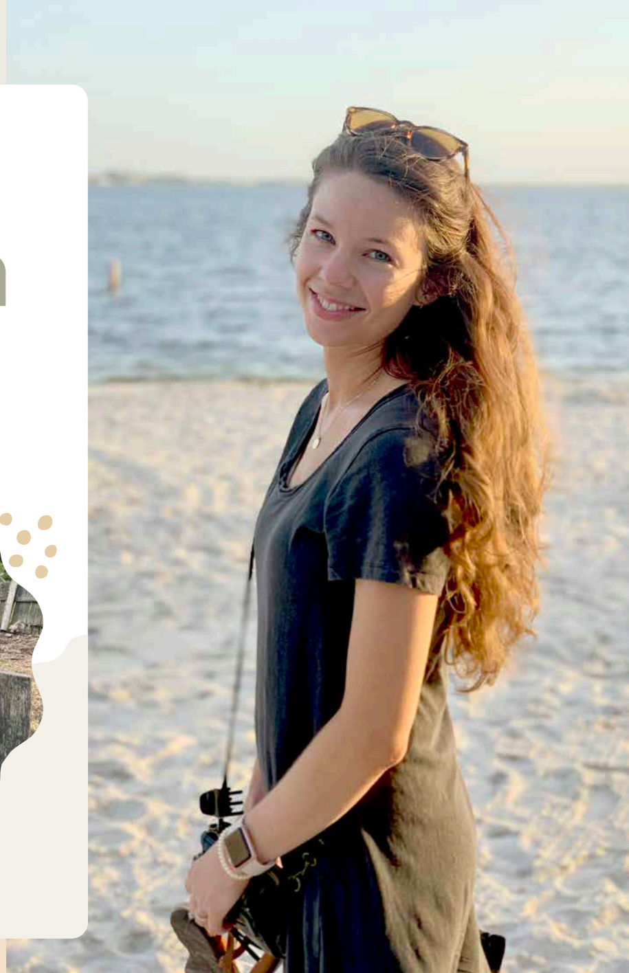
VACATIONING IN FLORIDA