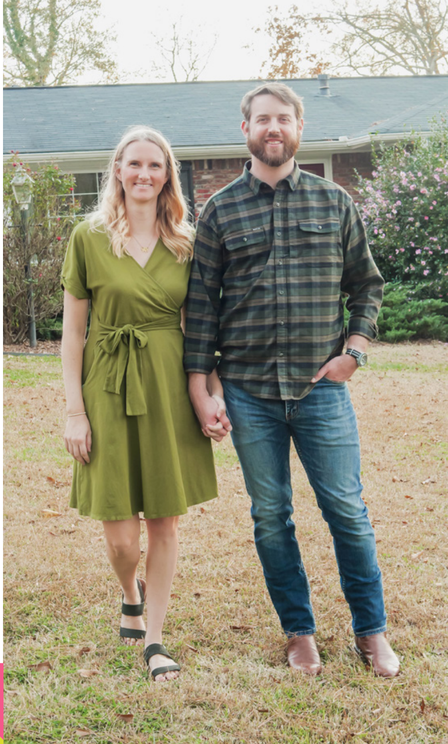
STANDING IN FRONT OF OUR HOME

We take this consideration seriously. If our adoption is trans-racial, we intend to lean our friend group to help us create an environment that respects and supports our child's ethnic background and heritage.