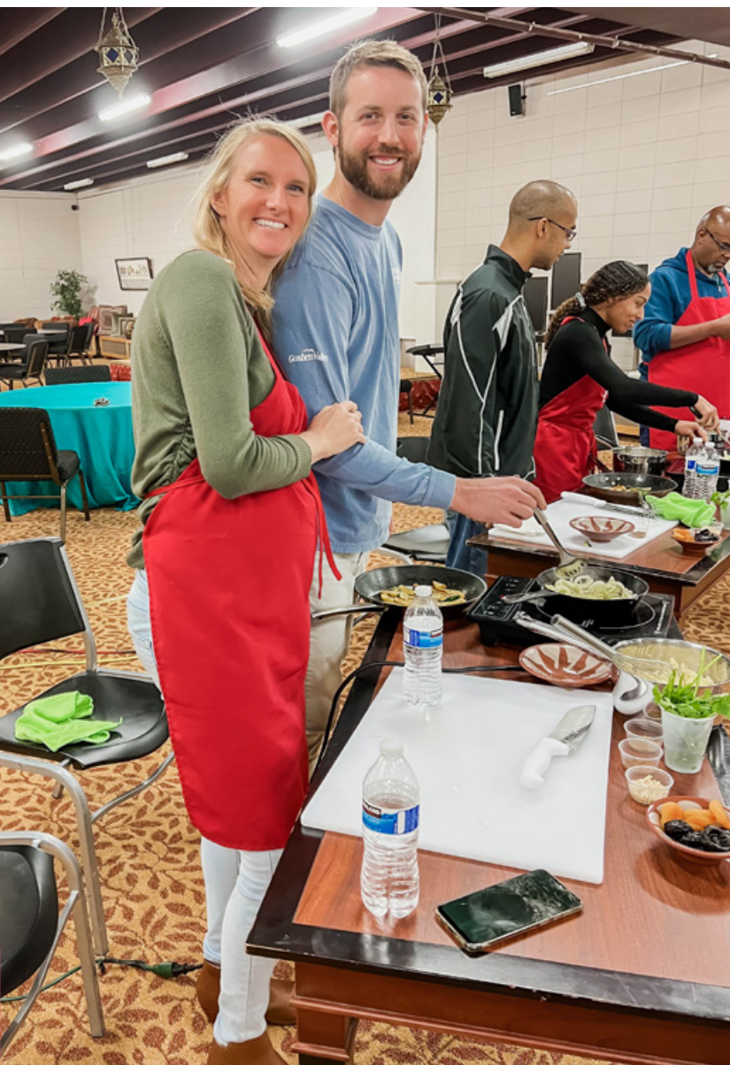
TAKING A COOKING CLASS TOGETHER