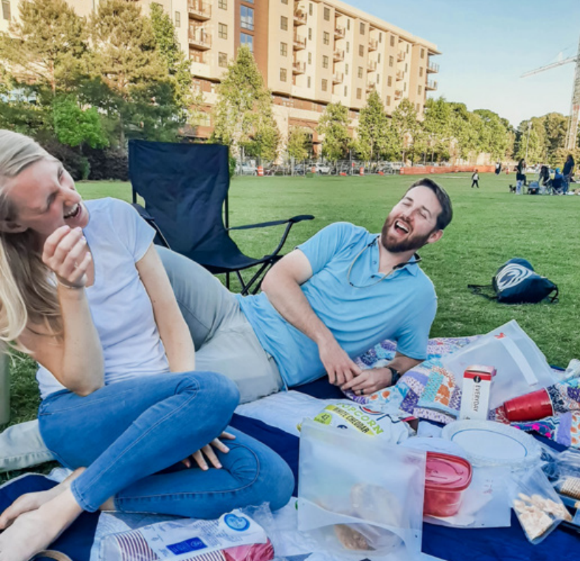
PICNIC IN THE PARK