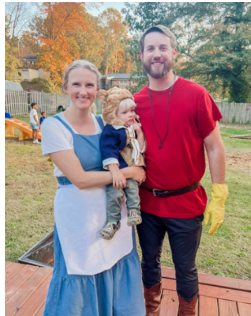
DRESSED UP FOR HALLOWEEN