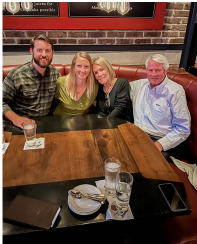
DINNER WITH GRIFFITH'S PARENTS