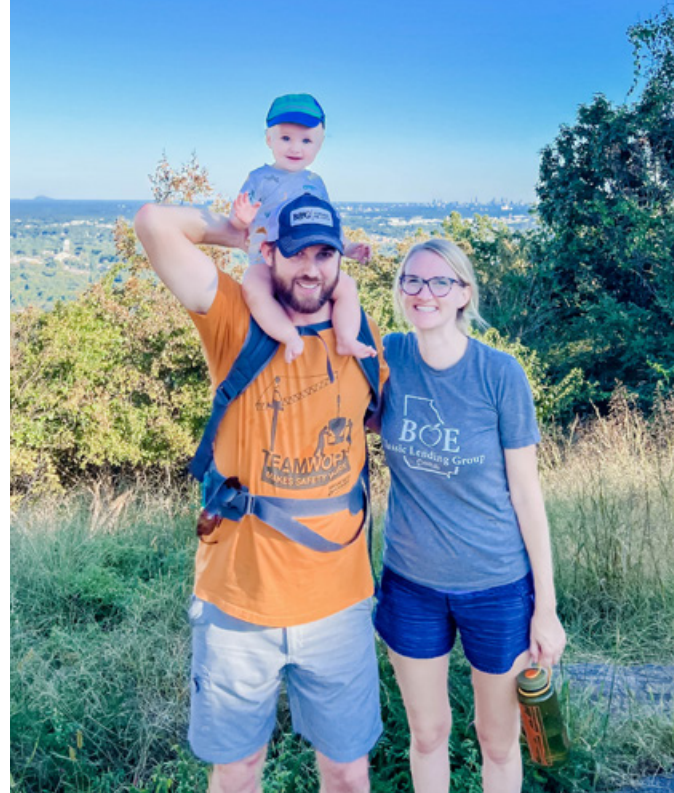
FAMILY HIKE NEAR OUR HOME

We enjoy spending time outdoors where we live. We have walking, biking, and hiking trails nearby that we utilize often. The city square is close to where we live. At the square, we go to the weekly farmers market, and we attend events like concerts and art festivals. We usually find something fun to do during our free time.