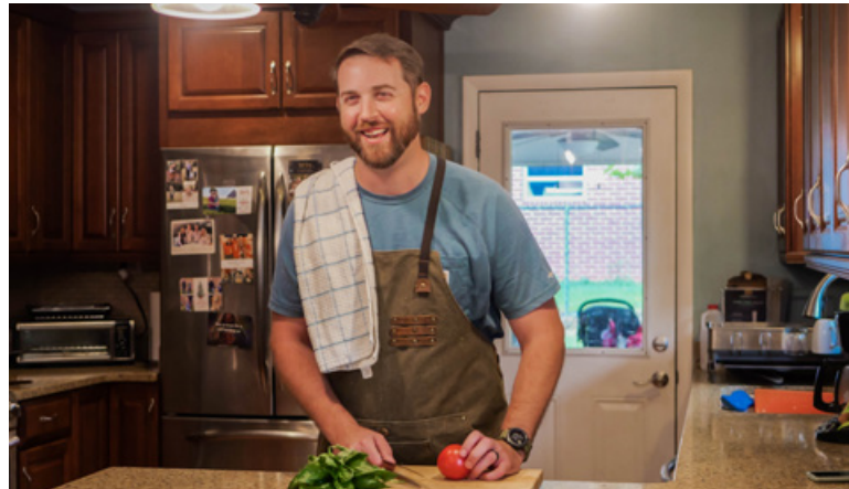
We enjoy playing sports with our friends