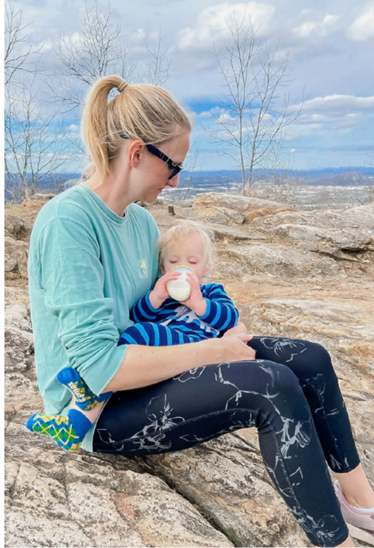
TAKING A MILK BREAK WITH MOM

Griffith and I rarely share a treat or dessert because I always go for chocolate, and he always going for something fruity