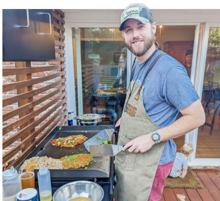
COOKING FOR A BIG GROUP OF FRIENDS