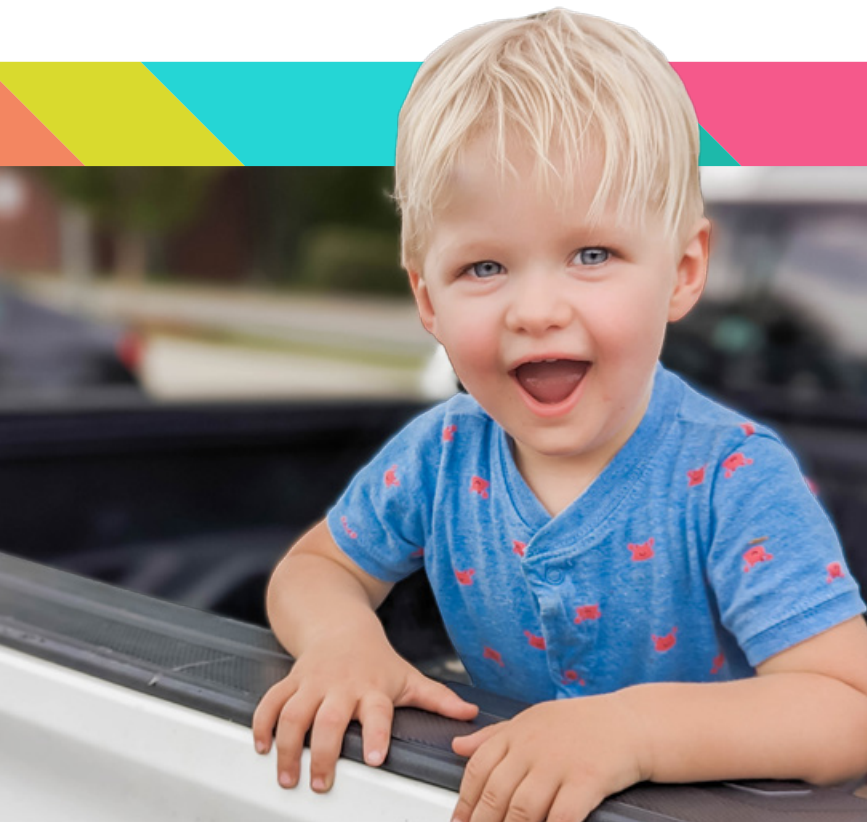
FAMILY PICNIC AT A LOCAL PARK