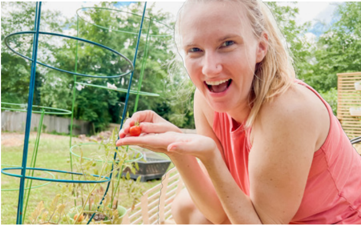
EXCITED TO EAT VEGETABLES FROM OUR GARDEN