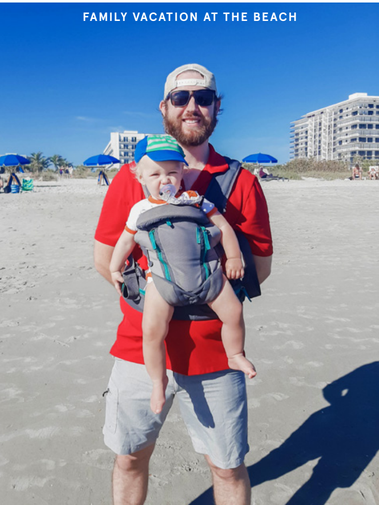
FAMILY VACATION AT THE BEACH