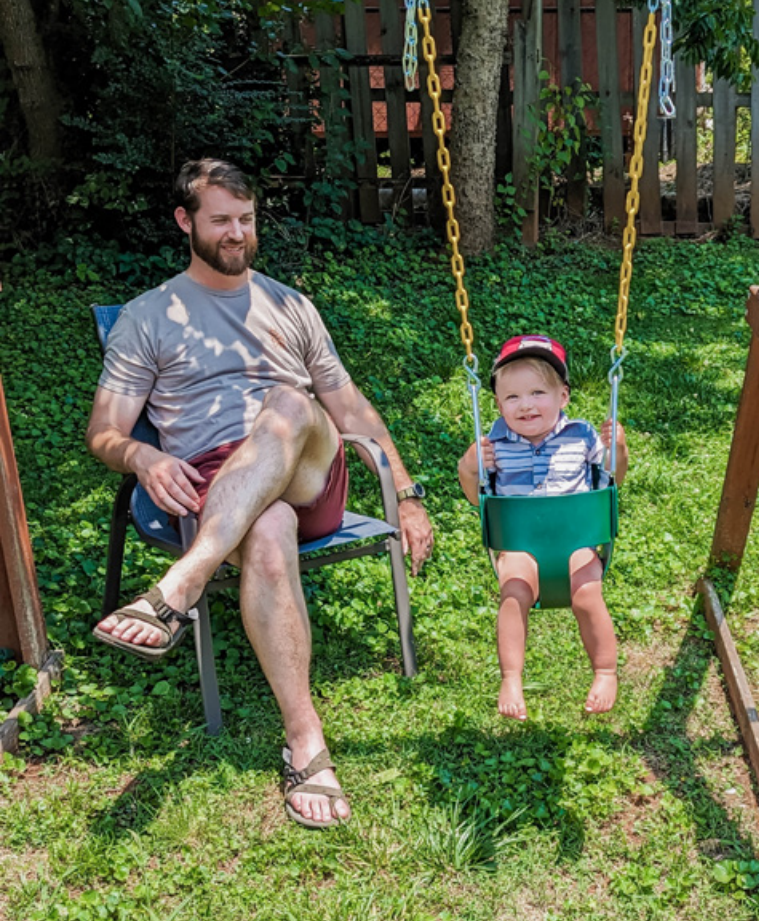
ENJOYING THE SWING IN OUR BACKYARD