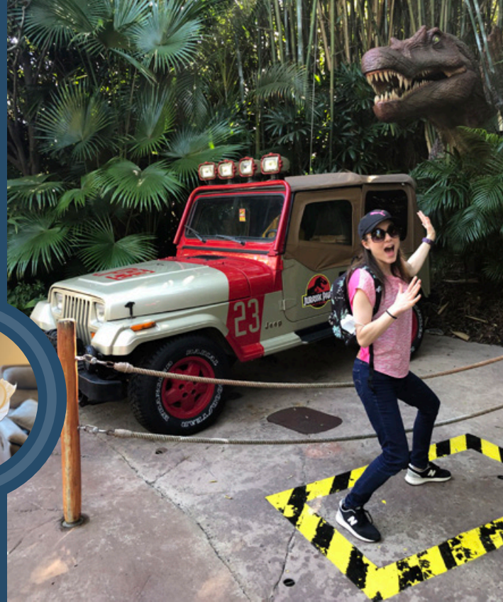
↑ WE LOVE TO LAUGH, EVEN IF WE ARE BEING CHASED BY DINOSAURS