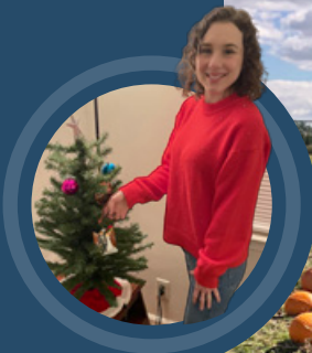
↓ WE ENJOY THE SPECIAL THINGS EACH SEASON BRINGS